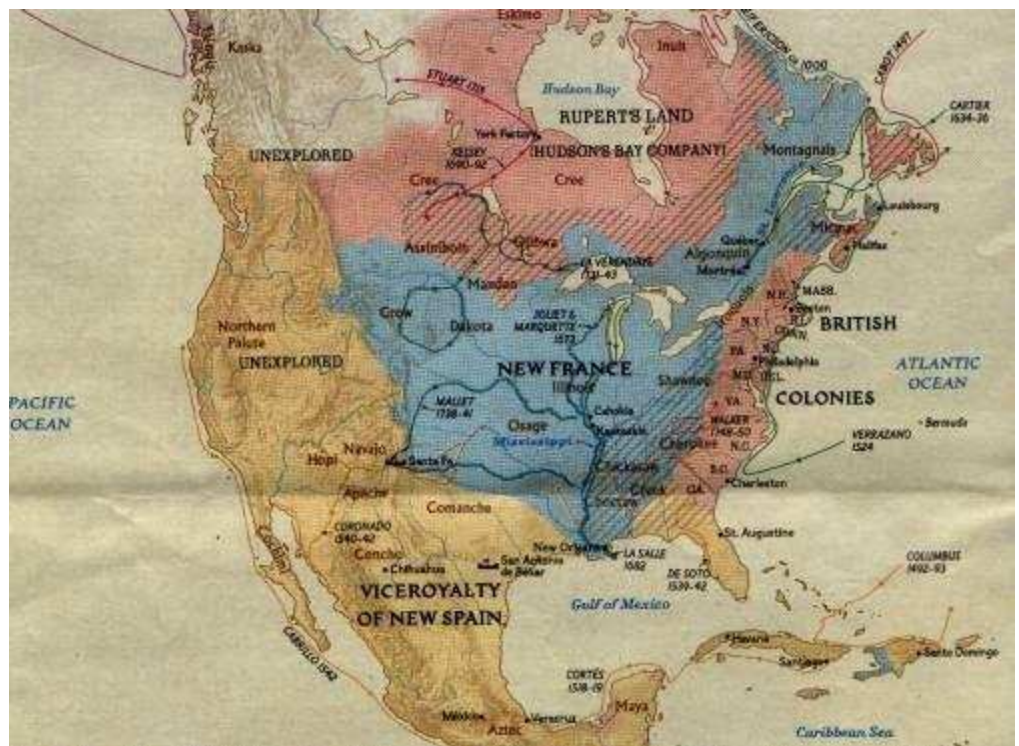
European Claims 1750