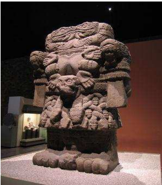
Fig 5. Brown Pride. "Coatlicue: The Goddess, demon, monster, and Masterpiece." 1 Feb 2013. < www.brownpride.com > Note: currently housed at Museo Nacional de Antropología, Mexico