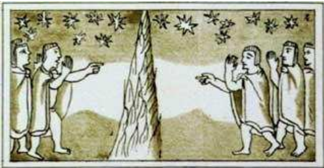
Fig 2. “Bad Omens.” The Fall of the Aztecs. 1 Feb 2013. < www.pbs.org >

“First, every night there arose a sign like a tongue of fire, like a flame. Pointed and wide-based, it pierced the heavens to their midpoint, their very heart.”