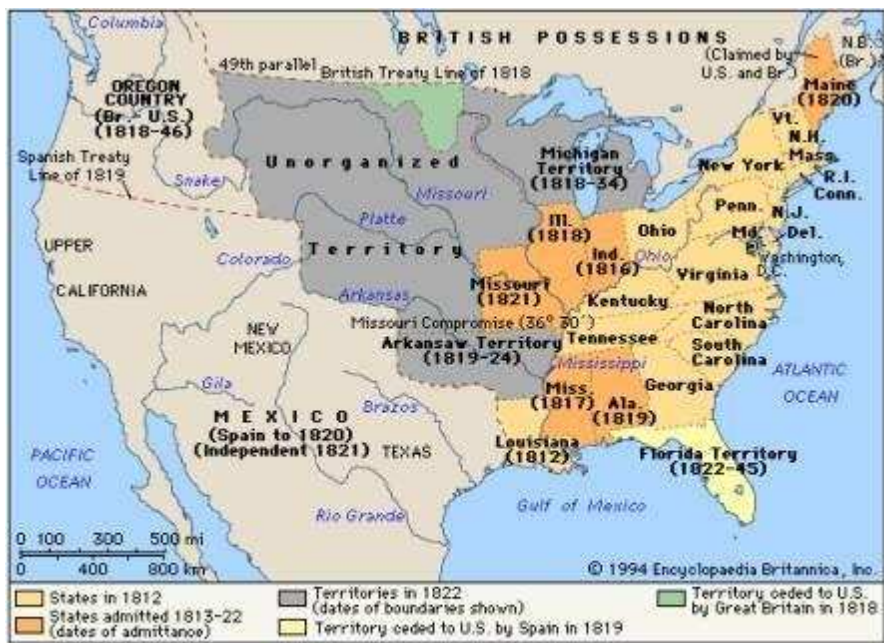
The United States, 1812-22.