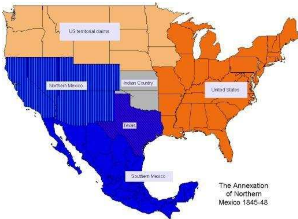
The Annexation of Northern Mexico 1845-48