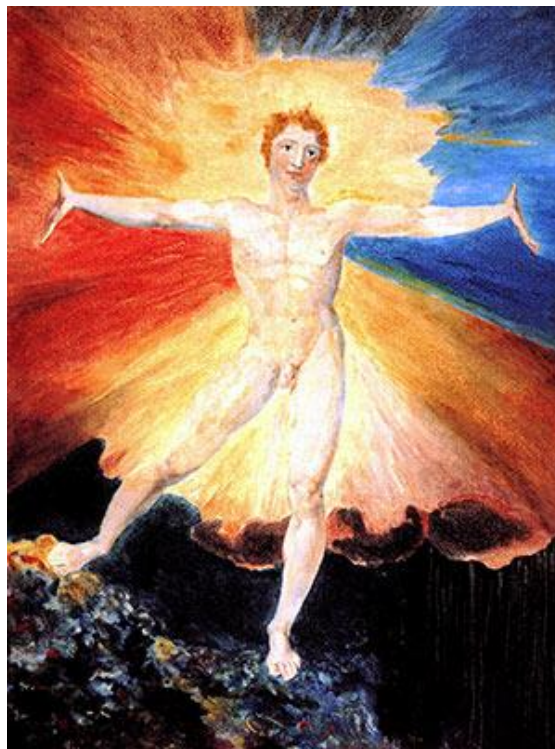
(William Blake, Glad Day )

To understand Blake's approach of the perception of the Real, the ins and outs of our organs of perception, the trap of the senses, the possible liberation through the "Poetic Genius" and the Imagination, to show how Blake had a profound understanding on human psychology, how he precisely and dutifully analyzed all the antagonistic aspects, forms, and forces of existence, the deep-seated troubles of man, and his possible emergence through Art as the absolute imaginative man, as "the true man" or "cosmic man" permanently aware of the illusion of materiality, it will be essential to dedicate at first some time and some lines to the life and faith of William Blake. This topic has been extensively treated already, and I will not add anything new. I will simply highlight the aspects of his life that will help us to go into such questions as "the Real" and its "total" perception. The first part of this work will be dedicated to this biographical point. Then only, when we will know better about Blake's life and ideals, we will be able to go into the very question of the possible "cleansing" of our senses through Imagination: the access to a "true" perception of the Real. In this respect, I will attempt to explore how Art and imaginative life, according to Blake, can be considered as a path of liberation from the fetters of material life, as an intuitive way to embrace the totality of reality and realize its infinite beauty.