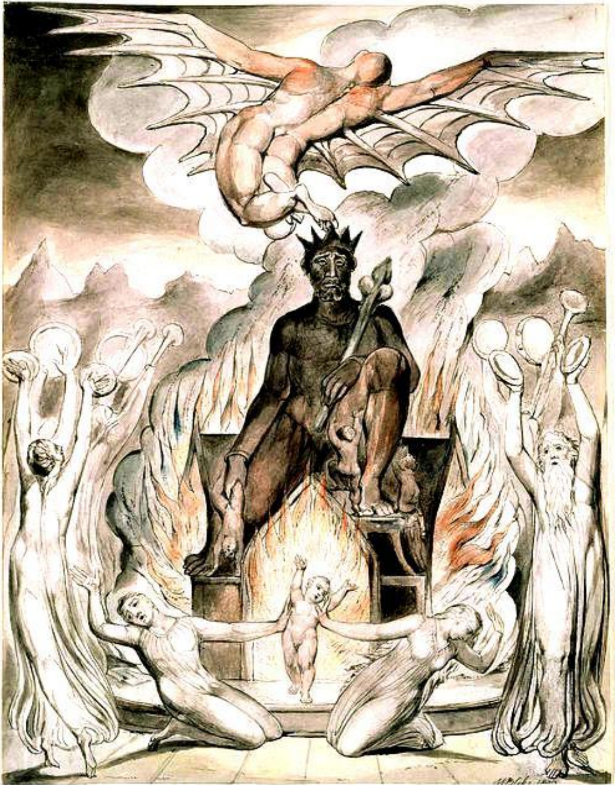
(William Blake, The Flight of Moloch )