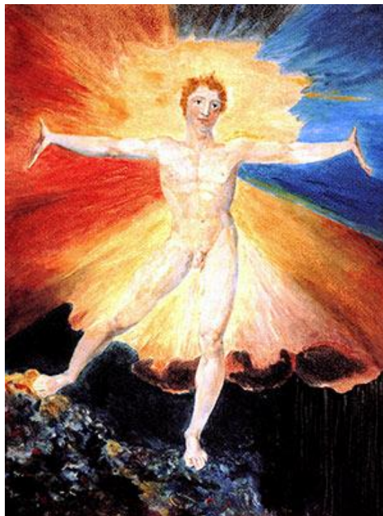
(William Blake, Glad Day )

To understand Blake's approach of the perception of the Real, the ins and outs of our organs of perception, the trap of the senses, the possible liberation through the "Poetic Genius" and the Imagination, to show how Blake had a profound understanding on human psychology, how he precisely and dutifully analyzed all the antagonistic aspects, forms, and forces of existence, the deep-seated troubles of man, and his possible emergence through Art as the absolute imaginative man, as "the true man" or "cosmic man" permanently aware of the illusion of materiality, it will be essential to dedicate at first some time and some lines to the life and faith of William Blake. This topic has been extensively treated already, and I will not add anything new. I will simply highlight the aspects of his life that will help us to go into such questions as "the Real" and its "total" perception. The first part of this work will be dedicated to this biographical point. Then only, when we will know better about Blake's life and ideals, we will be able to go into the very question of the possible "cleansing" of our senses through Imagination: the access to a "true" perception of the Real. In this respect, I will attempt to explore how Art and imaginative life, according to Blake, can be considered as a path of liberation from the fetters of material life, as an intuitive way to embrace the totality of reality and realize its infinite beauty.