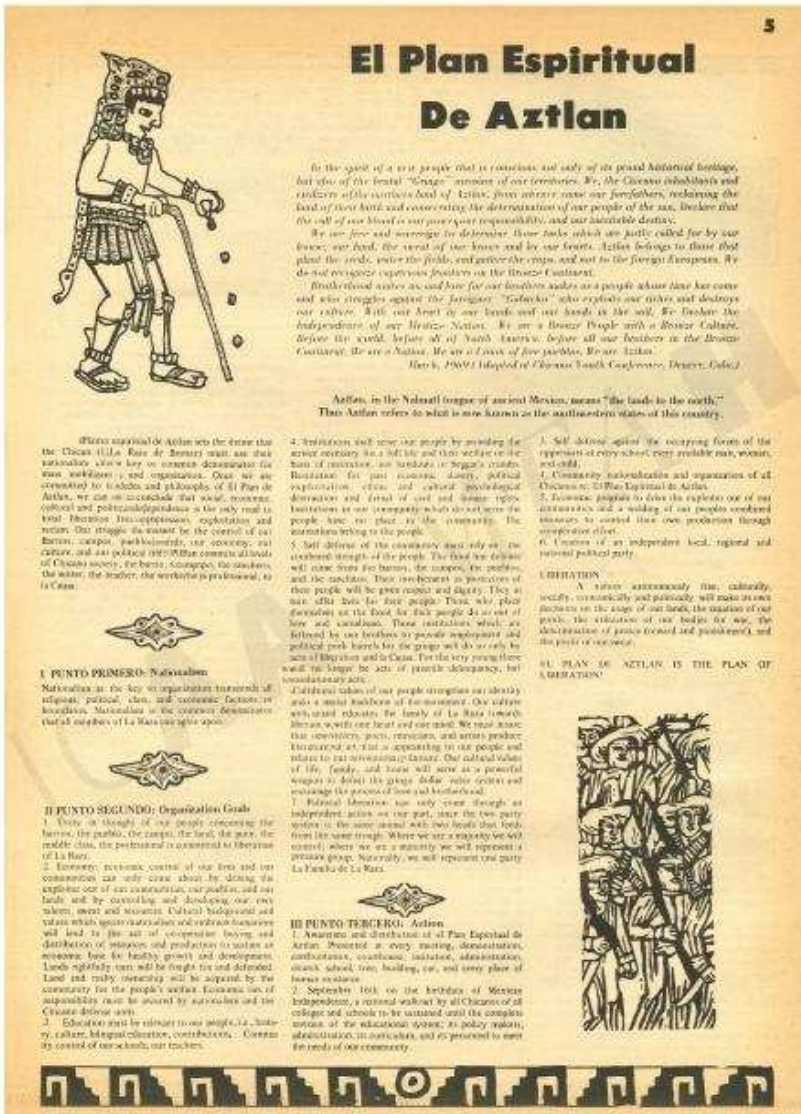
Fig 7. International Center for the Arts of the Americas at the Museum of Fine Arts, Houston. "Documents of 20 th -century Latin American and Latino Art." 1 Feb 2013. <www.icaadocs.mfah.org> Note: typed-text of image on the following page