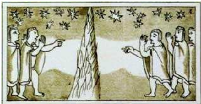
Fig 2. “Bad Omens.” The Fall of the Aztecs. 1 Feb 2013. < www.pbs.org >

“First, every night there arose a sign like a tongue of fire, like a flame. Pointed and wide-based, it pierced the heavens to their midpoint, their very heart.”