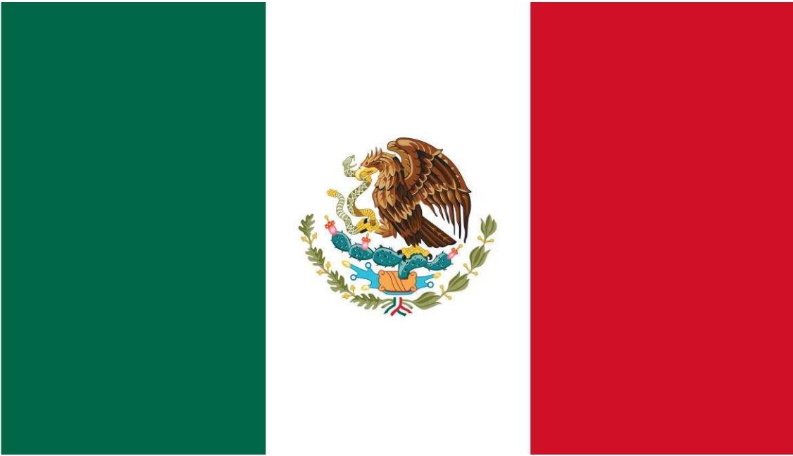
Fig 6. Inside Mexico. "The Mexican Flag." 1 Feb 2013. <www.inside-mexico.com> Note: The flag was created in 1821, marking Mexican Independence