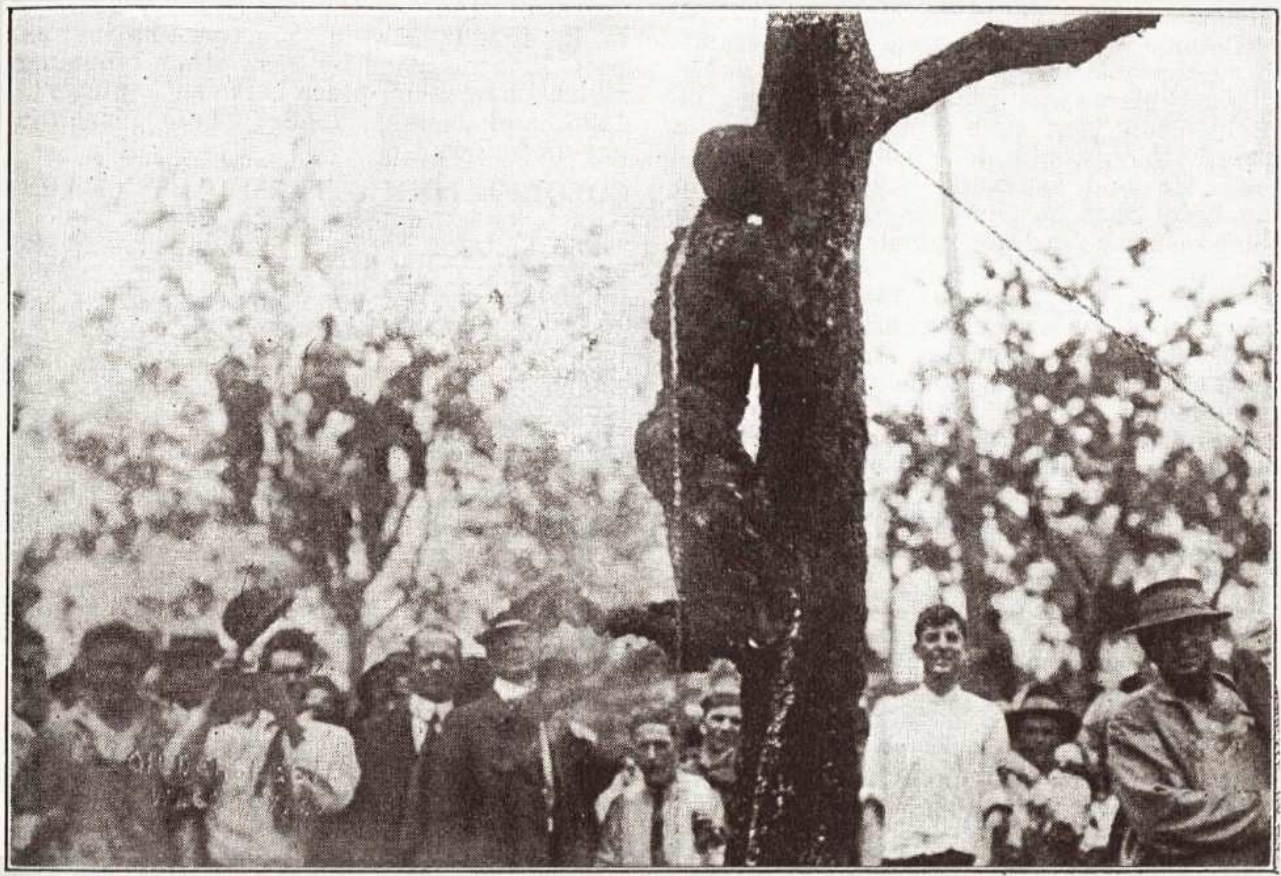
“We make no apology for including in this number a detailed account with pictures of perhaps the most horrible lynching that has taken place in the United States.” The Crisis , July 1916.

an “Anti-Lynching Fund” in the 1916 July issue of The Crisis . In order to mobilize his readers W. E. B. Du Bois also allowed to publish pictures of lynching in the editorials of April and June 1916 and dedicated a supplement number in July 1916 which published the crudest pictures of a lynching.