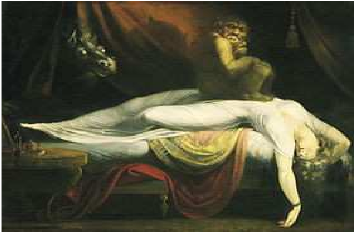
Appendix II: The Nightmare by Johann Heinrich Fuseli (1782)