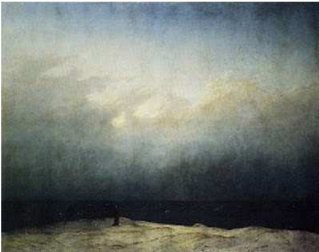
Appendix I: The Monk by the Sea by Caspar David Friedrich (1808)