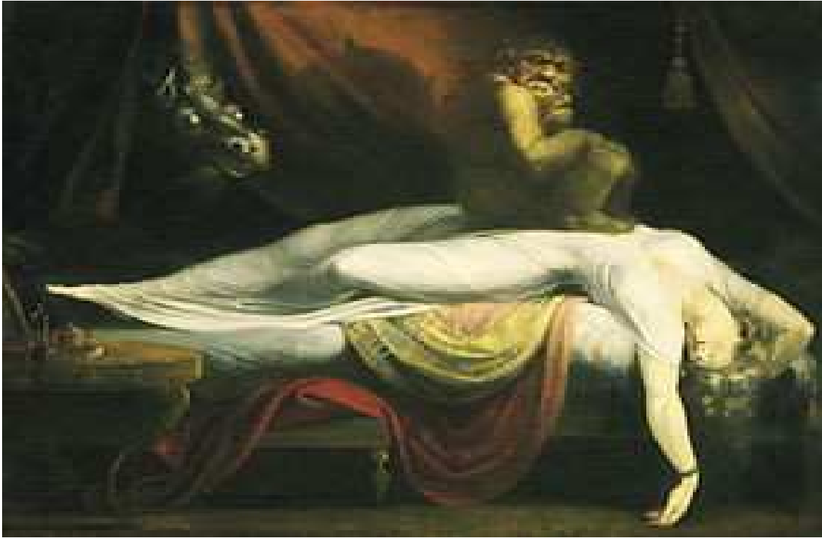
Appendix II: The Nightmare by Johann Heinrich Fuseli (1782)