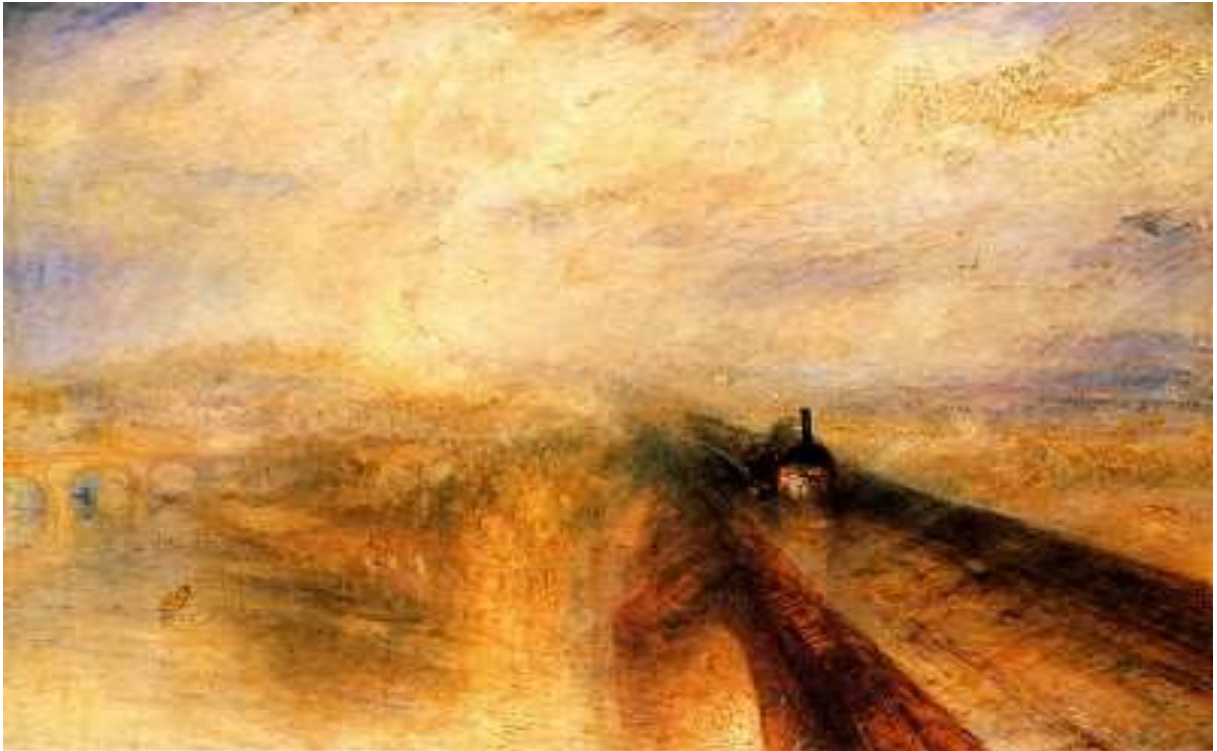
Appendix IV: Steam and the Great Western Railway by JMW Turner (1844)