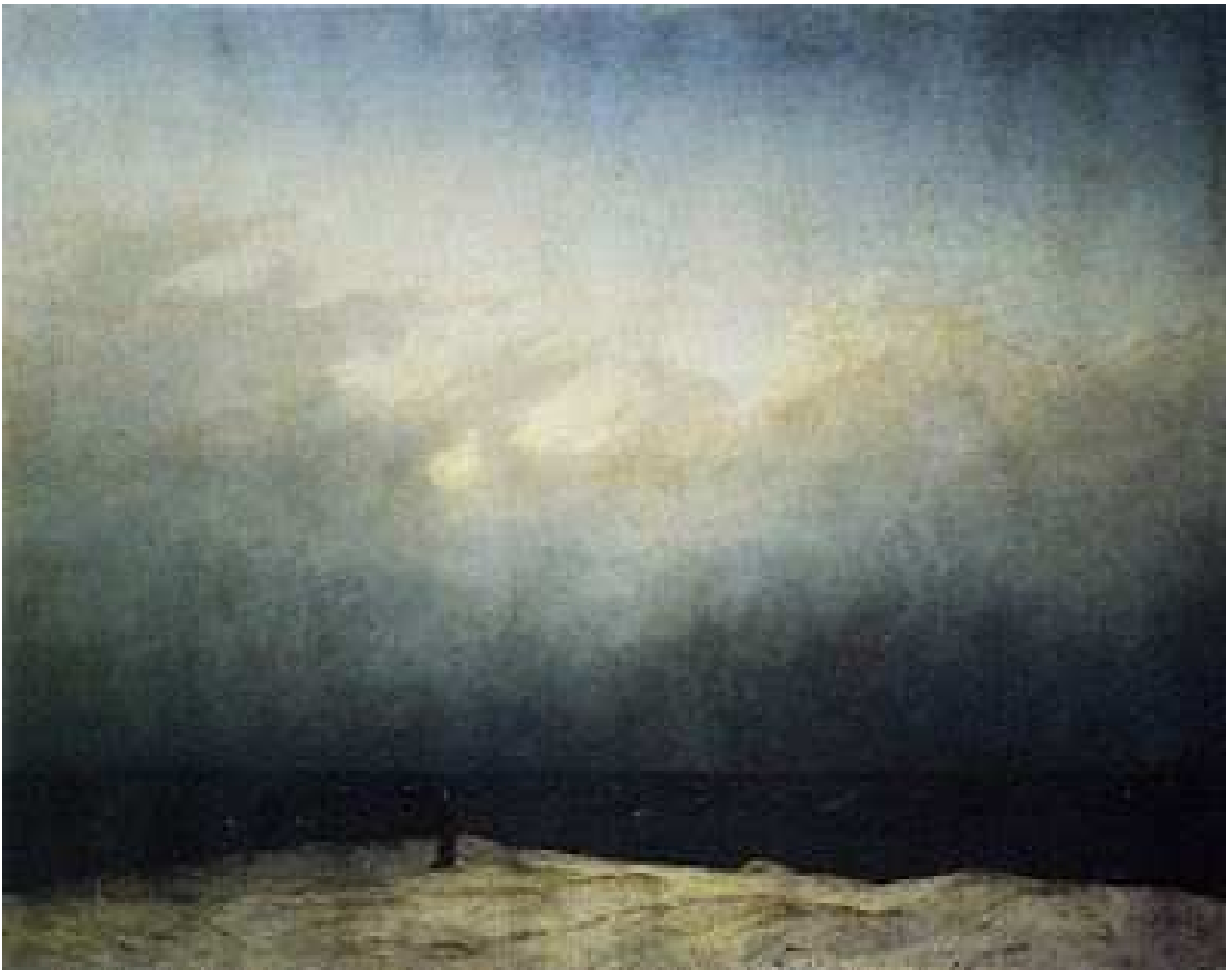
Appendix I: The Monk by the Sea by Caspar David Friedrich (1808)