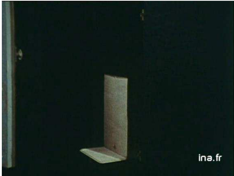
Screen capture n°4