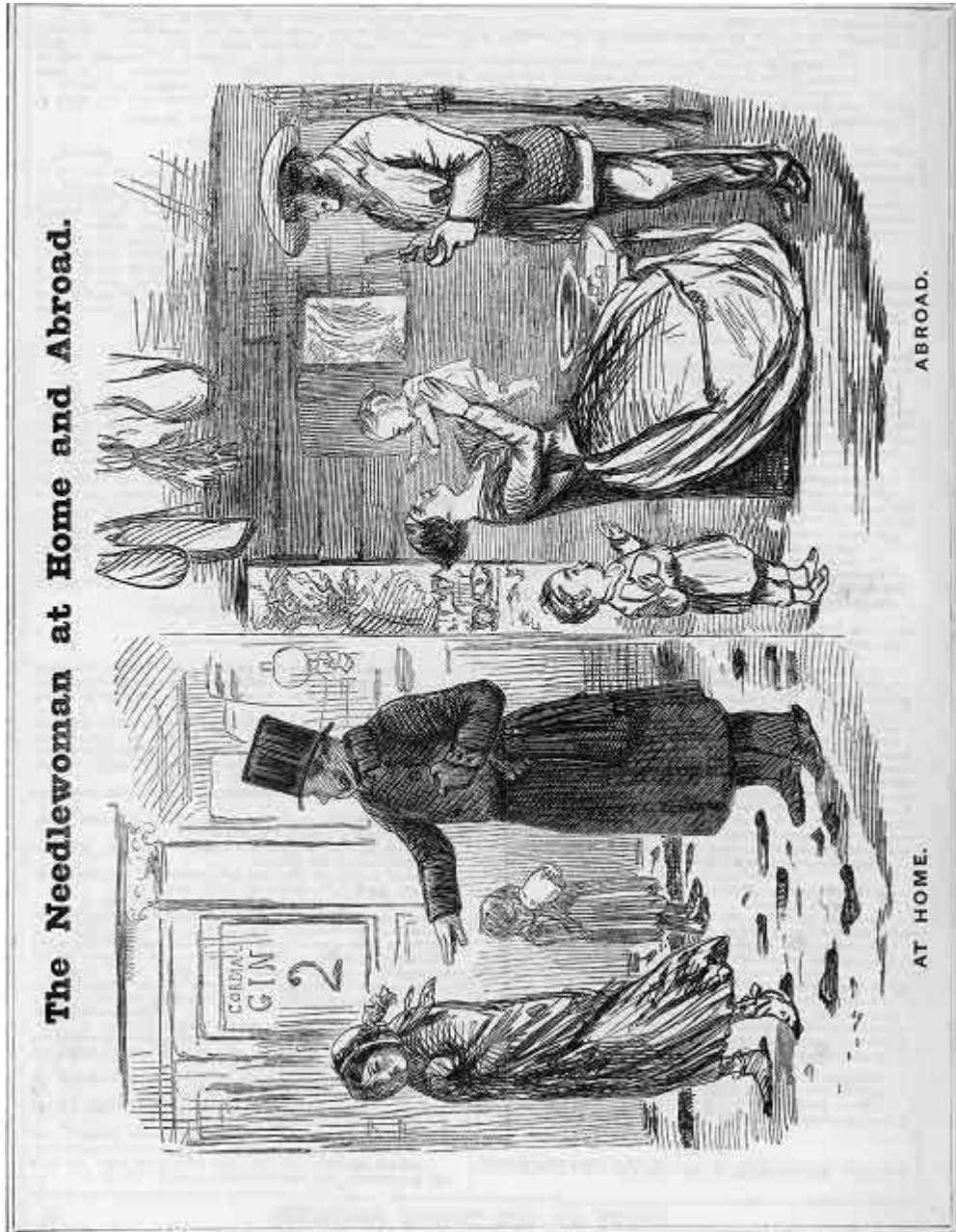
“The Needlewoman at Home and Abroad”, cartoon in Punch , vol.18, 1850.