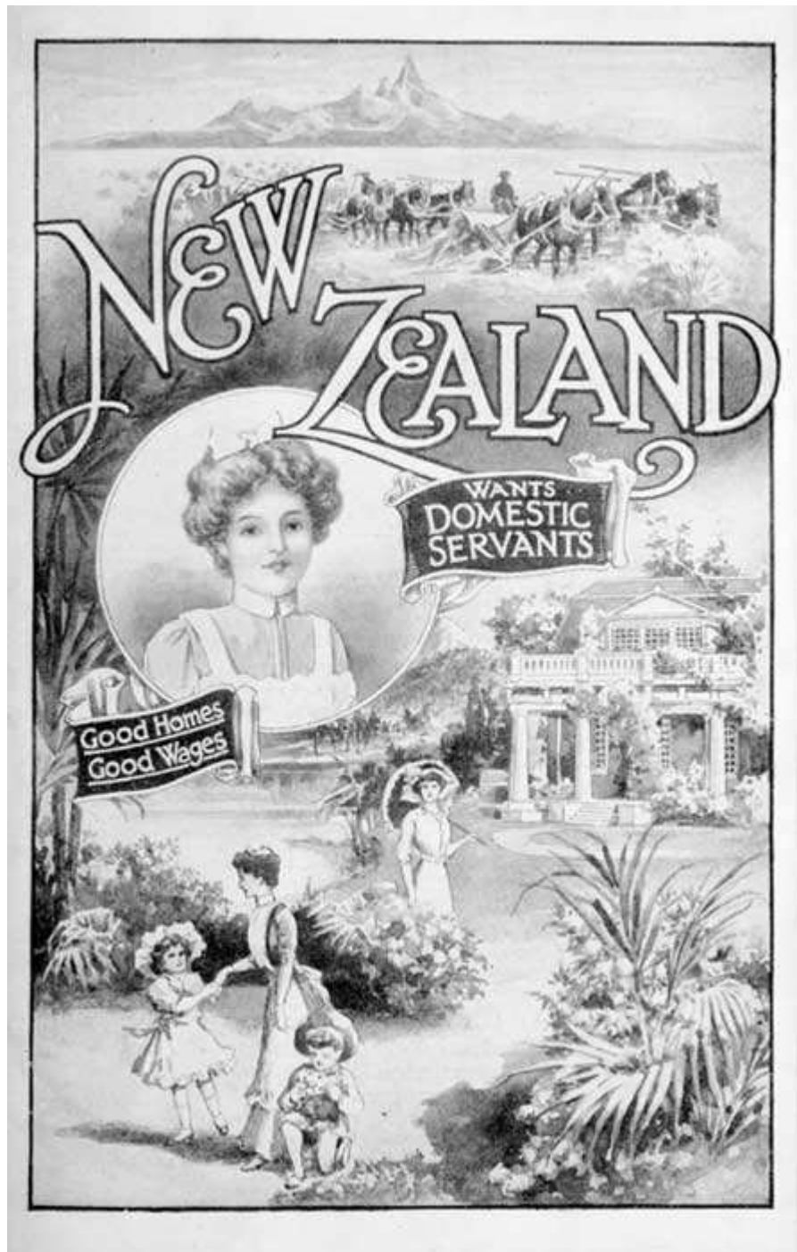
“New Zealand wants domestic servants; good homes, good wages”. Poster issued by the High Commissioner for New Zealand in Britain, London, circa 1912. Alexander Turnbull Library, National Library of New Zealand, New Zealand.