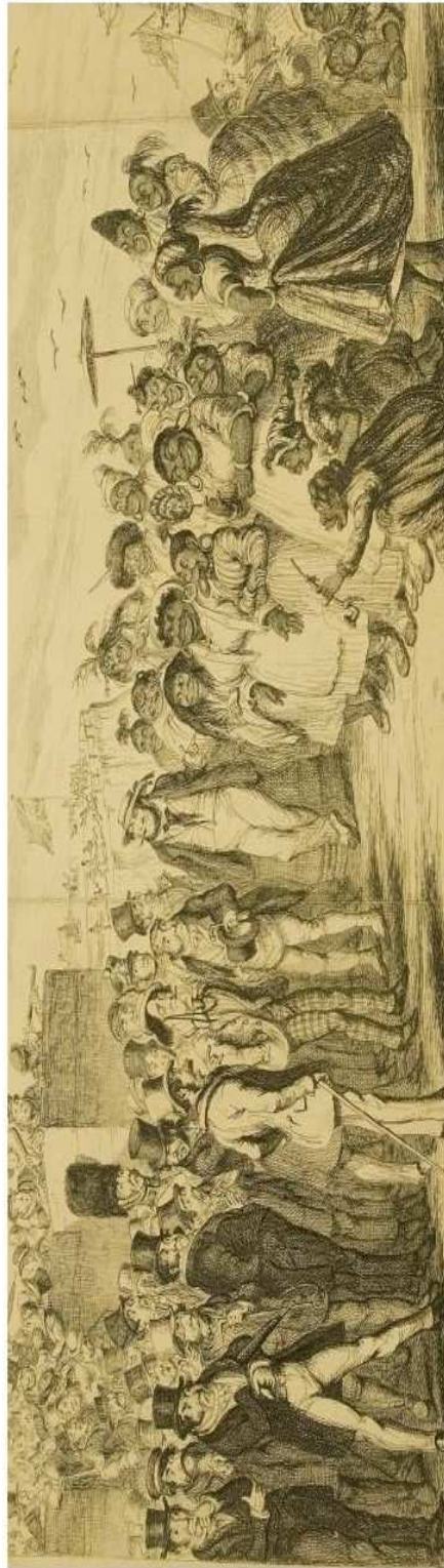
CRUIKSHANK, George, Probable effects of over female emigration, or, Importing the fair sex from the savage islands in consequence of exporting all our own to Australia , 1851. The People's History Museum, Manchester, United Kingdom.