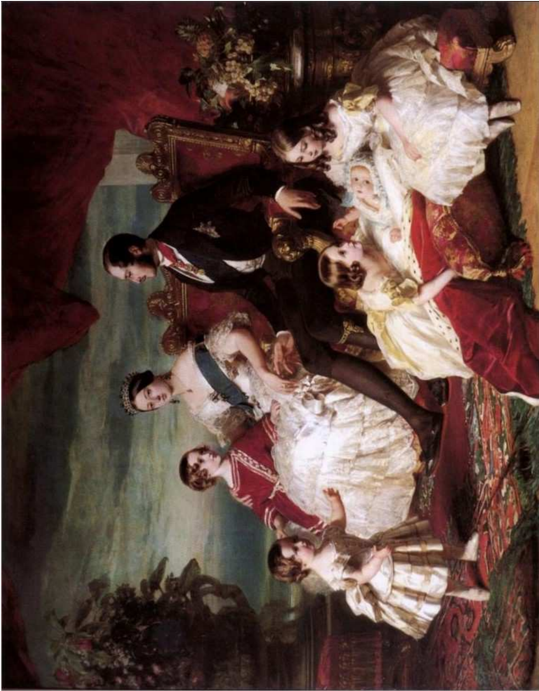
WINTERHALTER, Franz Xaver, The Royal Family in 1846 , Royal Collection, Her Majesty Queen Elizabeth II, United Kingdom