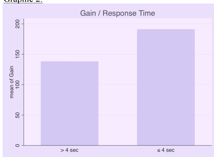
Average of gain per choice for “intuitive” and “analytic” answers