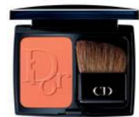
50€ Blush – Dior