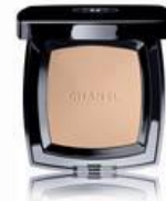
50€ Facial Powder - Chanel