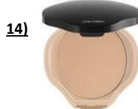
30€ Facial Powder - Shiseido