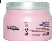
15€ Hair Mask – L'Oréal Professional