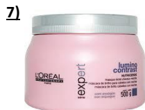
15€ Hair Mask – L'Oréal Professional