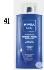
7€ Moisturiser - Nivea