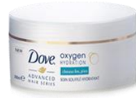
7€ Hair Mask - Dove