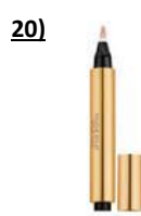
35€ Concealer – Yves Saint Laurent