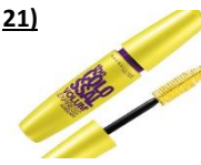
8 € Mascara - Maybelline