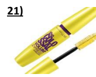
8 € Mascara - Maybelline