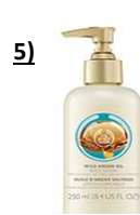
15 € Moisturiser – The Body Shop