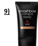
20€ BB Cream - Smashbox