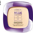
15 € Facial Powder – L'Oréal Paris