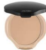
30€ Facial Powder - Shiseido