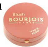
10 € Blush - Bourjois