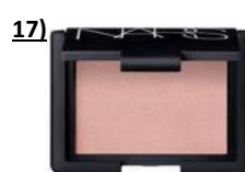
30€ Blush - Nars