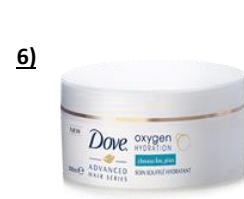
7€ Hair Mask - Dove