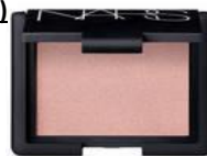
30€ Blush - Nars