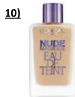
15 € Foundation – L'Oréal Paris