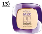
15 € Facial Powder – L'Oréal Paris