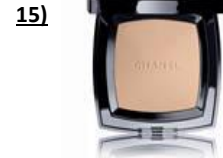
50€ Facial Powder - Chanel