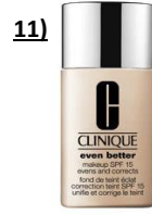
30€ Foundation - Clinique