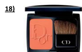
50€ Blush – Dior