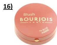
10 € Blush - Bourjois