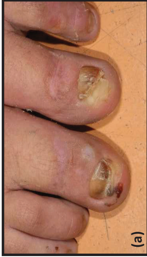
Figure 1. Phenotypic variability in junctional epidermolysis bullosa (JEB) patients with COL17A1 mutations. (a) dystrophic nails. (b) dental abnormalities localized in four limbs. (d) blister in an upper limb.