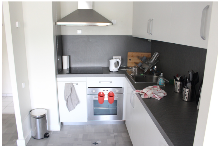
FIGURE A.3 – Vue de la cuisine de l'appartement Amiqua4Home