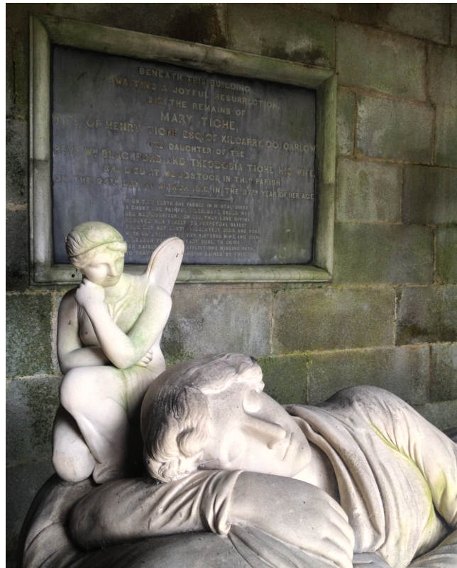
Figure 10: The statue at the tomb of Mary Tighe, by John Flaxman.

evil geni” not only on these particular sculptures but from the realm of Art in general.