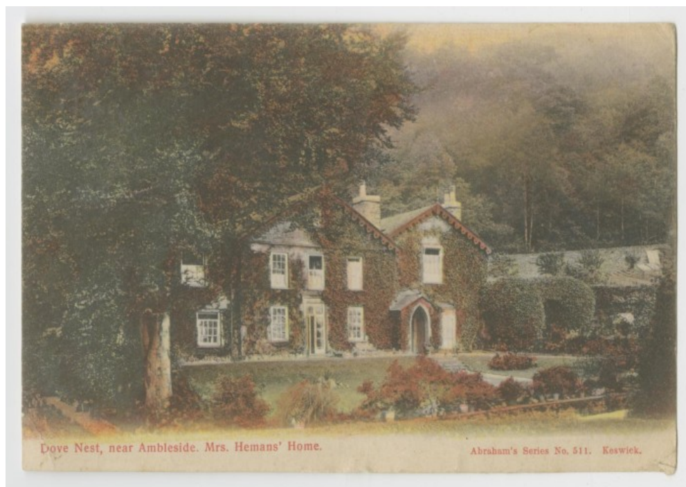
Figure 11: Postcard of the home of Felicia Hemans. Dove Nest, near Ambleside where she resided during the summer of 1830.

To begin with, she uses the word “beautiful” herself but the rest of the description appears to be in agreement with Edmund Burke's idea of the Beautiful; the spot is “little,” the sharpness of the window frame is softened with flowers and lastly the mountain in the background is “gleaming.” These terms are soft and minimize the impact of nature, it is not grandiose but pretty, the complete opposite of the Sublime. A postcard from Dove Nest present a visual representation of Felicia Hemans's descriptions.