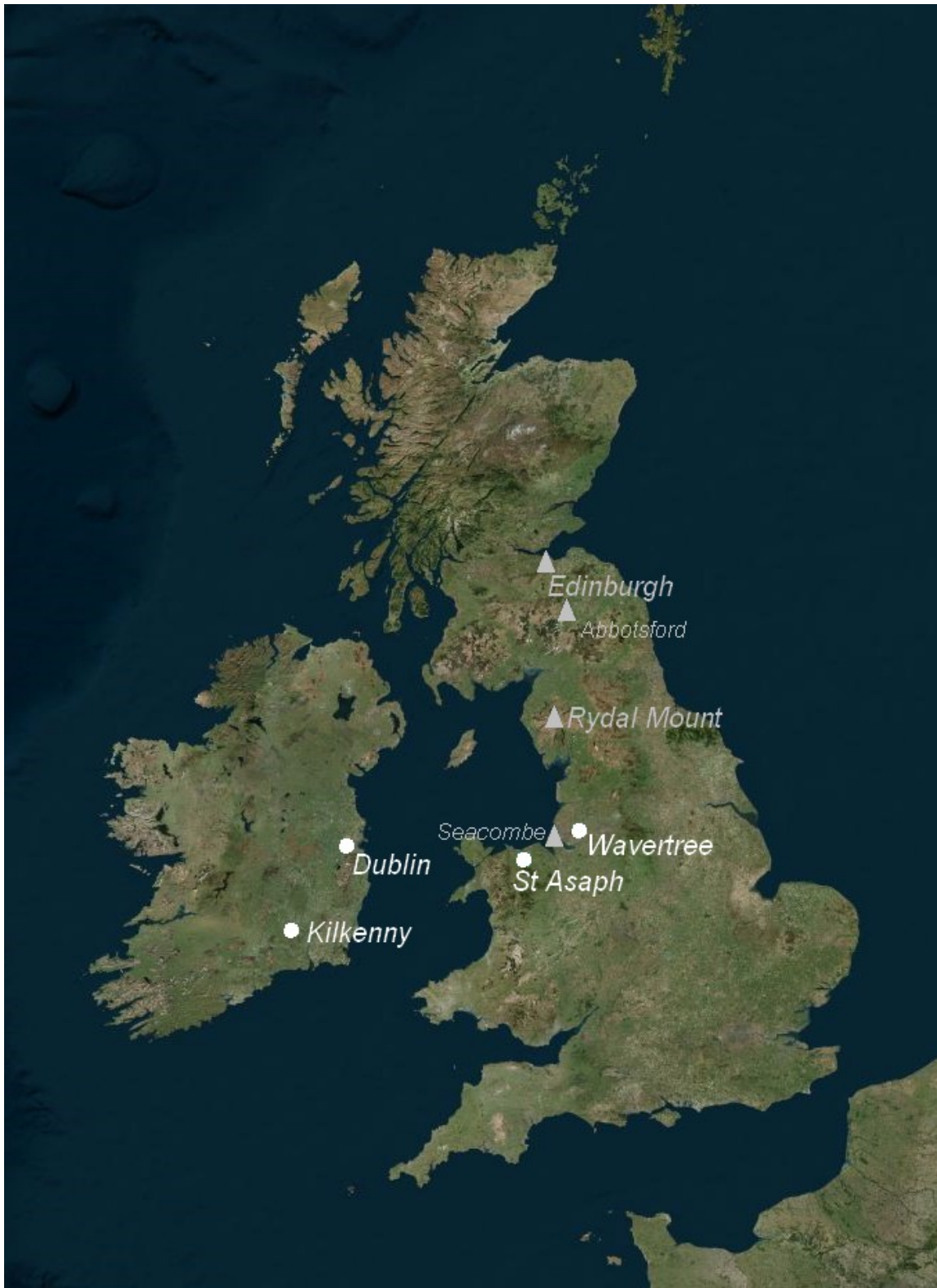
Figure 3: The map of Felicia Hemans's travels and residences.

On this map are indicated the places whence Felicia Hemans sent her letters. The white circles indicate where she lived and the gray triangles, where she resided as a