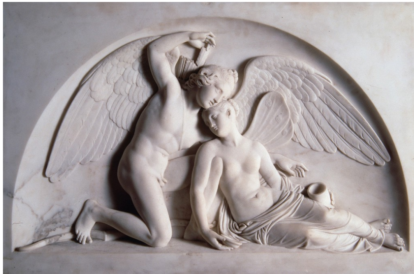
Thorvaldsen Museum, Copenhagen.

Appendix 5. Cupid revives the fainted Psyche , Bertel Thorvaldsen.