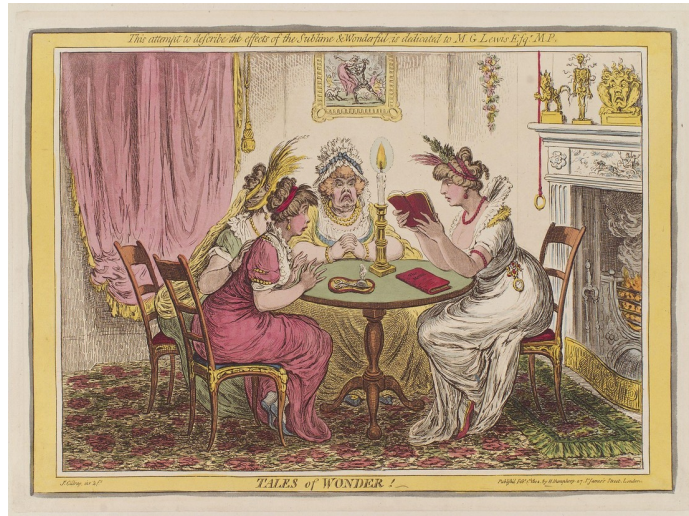
Image 1: James Gillray, Tales of Wonder! (London: H. Humphrey, 1 February 1802); British Museum, Department of Prints and Drawings, London.