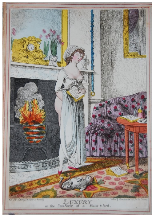
Image 2: Williams, 'Luxury or the Comforts of a Rum p ford' (London: S.W. Fores, 26 February 1801); British Museum, Department of Prints and Drawings, London