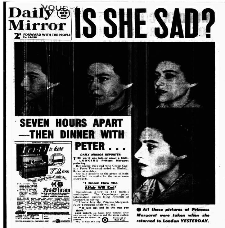
'Is She Sad?' Daily Mirror, October 18th, 1955.