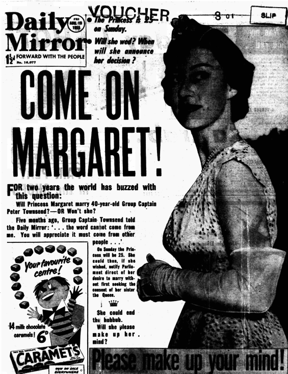
'Come On Margaret', Daily Mirror, August 19th, 1955.