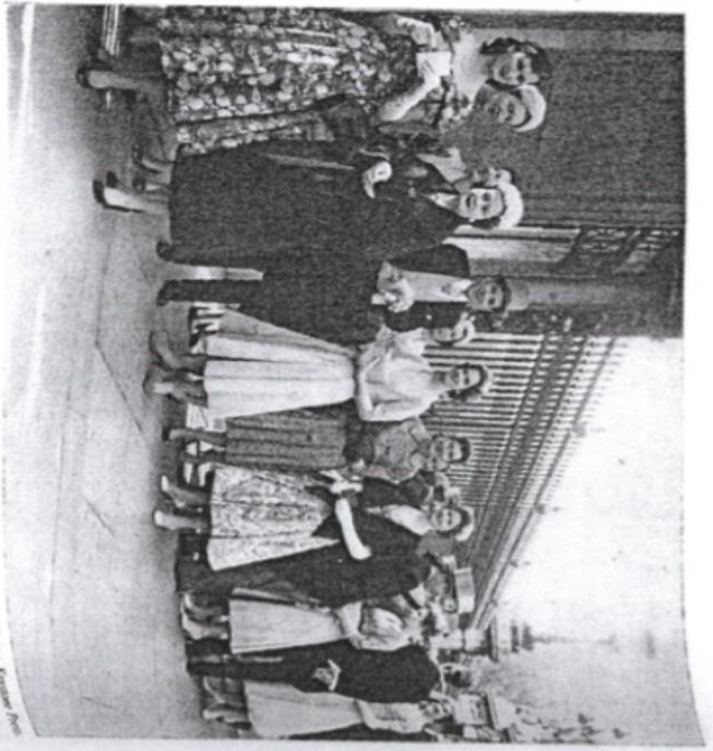
GUESTS ARRIVING AT BUCKINGHAM PALACE FOR A PRESENTATION PARTY.

1945. They pander to snobishness and give the Queen the appearance of standing at the apex of an aristocratic and plutocratic pyramid. People have a right to "bring out" their daughters in whatever way they please, but the Crown's benison should be reserved for those who have qualified for it by public service.