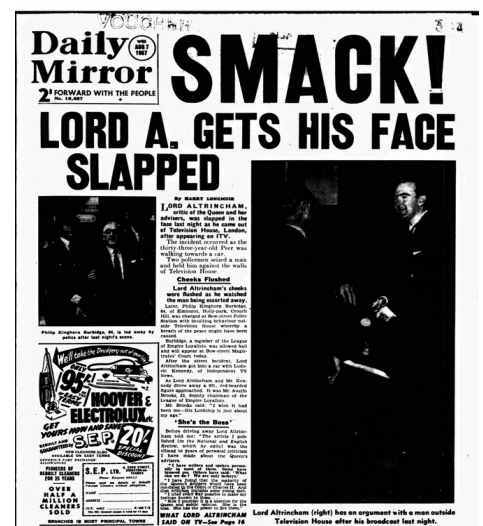
Daily Mirror, August 7th, 1957.