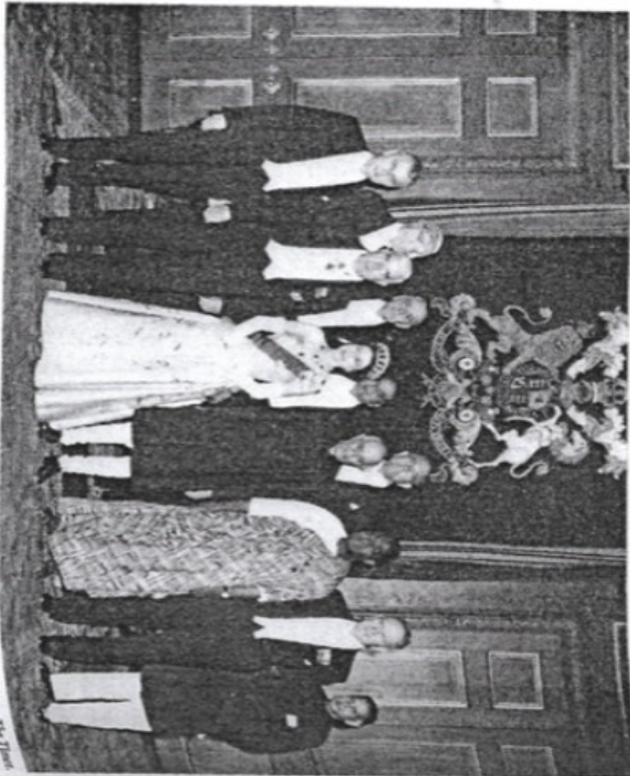
COMMONWEALTH PRIME MINISTERS AND MINISTERS WITH THE QUEEN AT WINDSOR. (N.B. THE U.K. PRIME MINISTER—PROBABLY FOR THE FIRST TIME—NOT IN THE FRONT ROW.)

Not do most harbour resentment against it, they have little heart. They either ignore what can be translated into the personal. Since they are "personalists" and dramatists, they are more interested in a few individual members of the Royal Family than in the less colourful figures of Parliamentary Government. The loyalty of these people—even allowing for changes of taste and mental habit due to education, social reform and other modern factors—would be shaken if the Monarchy were to depart too far from the accepted norm. Intelligence and eccentricity are permissible, but only in moderation.