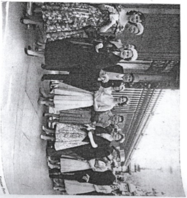
GUESTS ARRIVING AT BUCKINGHAM PALACE FOR A PRESENTATION PARTY.

1945. They pander to snobishness and give the Queen the appearance of standing at the apex of an aristocratic and plutocratic pyramid. People have a right to "bring out" their daughters in whatever way they please, but the Crown's benison should be reserved for those who have qualified for it by public service.