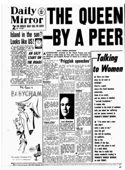
Daily Mirror, August 3rd, 1957. The British Newspaper Archive.

Therefore, even moderate newspapers seemed to be shocked and offended by Altrincham’s article. This was a popular topic in the British press of the time. The popular opinion seemed to be against Altrincham at that time. Furthermore, Altrincham’s being assaulted would also make the headlines. This type of news was quite unusual at the time and people wanted to know more about what happened.