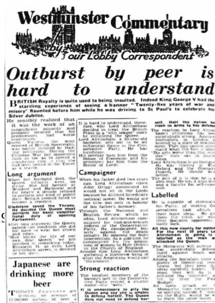
Hartlepool Northern Daily Mail, August 8th, 1957.