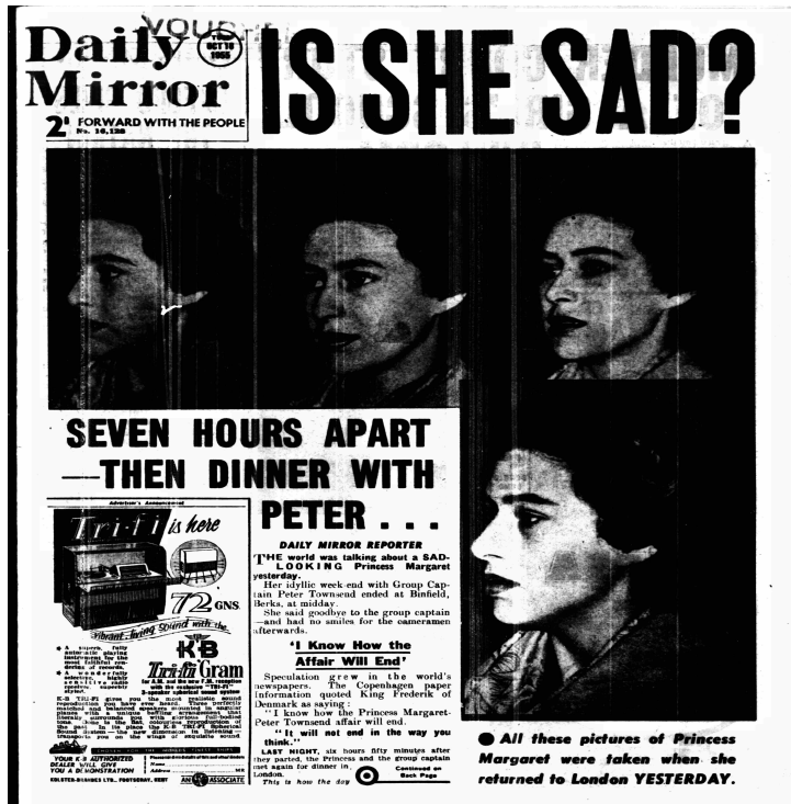
'Is She Sad?' Daily Mirror, October 18th, 1955.