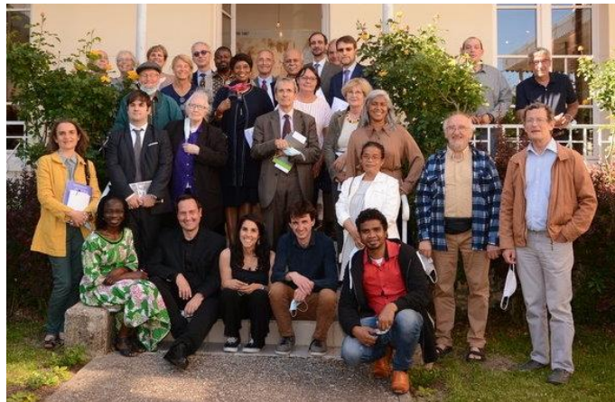
Figure 5: Visit UNESCO's ambassadors at JWC

Following the goal of rendering visible the value of the history of the poorest people and gain recognition by the society, as it was said before, the Centre held different events during my working period which gave me another perspective of the organization. One was hosting a delegation from the UNESCO on 31 st May 2021 to know the Centre and to give support to the nomination to be included it in the Memory of the World's Programme, I assisted with logistics, reception of people and time checking 32 . Another event was the celebration of the week of the international archives in June, for which I was asked to write an article about my experience in the JWC. It was published on ATD