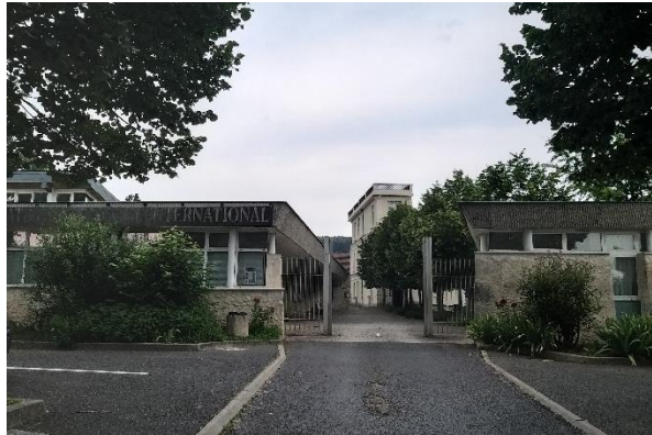
Figure 3: JWC entrance

JWC was inaugurated on 10 th February 2007 as part of the International Movement ATD Fourth World. It is an institution where the daily fight against misery by the poorest, also known in the Movement as resistance , is recognised and their history is kept as a precious treasure 23 .