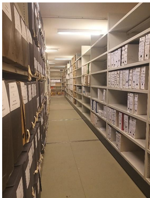
Figure 7: Boxes in the conservation room at JWC

I searched through J. Wresinski's unpublished printed documents dated from the 1960's to the late 1980's to find texts and expressions that can enrich the Seminar's discussion and its final publication. I did my search across three significant subject files: Fourth World People's University which gathers the transcriptions of J. Wresinski's speeches and his dialogue with the Fourth World in the context of the People's University, mainly in Paris; Allies which collects the transcripts of his addresses to the allies on the occasion of training sessions or his letters; and Conferences that folds his preparatory notes, drafts of texts and transcripts of his recorded public conferences, public lectures, and pleas to national and international political bodies.