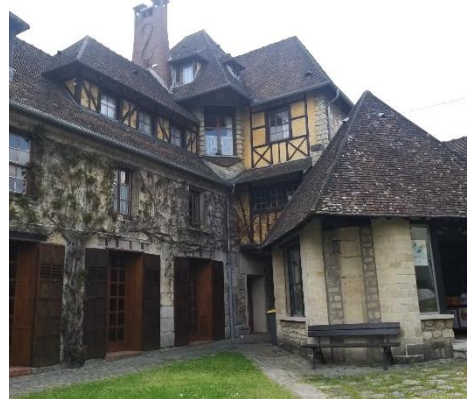
Figure 6: International Centre at Méry-sur-Oise

During my internship, I have done two formal presentations, one on the 6 th May 2021 as a mid-term presentation in front of the Research pole, presenting my findings until that moment. The second one was on the 29 th June 2021, where I explained the most relevant points and reflections about my experience in ATD Fourth World. The latter was done in a more open frame because it was part of a “Causerie” and some friends and allies of the Movement were invited. Both were enriching experiences since