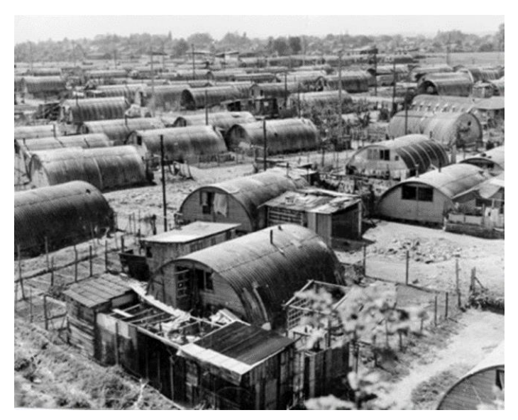
Figure 1: Igloo at Noisy-le-Grand in 1966

homeless families. The housing camp was a place where poor families lived in tents that were later replaced by houses made of corrugated metal and dirt floors "igloo" named as by inhabitants of the camp. The area was situated in a wasteland surrounded by a rubbish dump, a small copse and the ruins of an old castle. "The nearest water pump was very far away. There was no electricity and no facilities, and when it rained, we were up to our