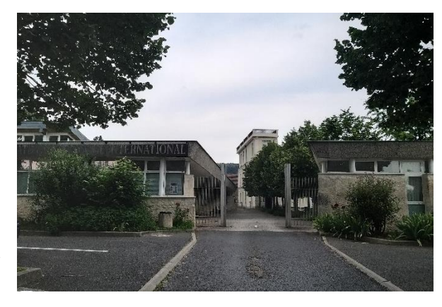
Figure 3: JWC entrance

JWC was inaugurated on 10<sup>th</sup> February 2007 as part of the International Movement ATD Fourth World. It is an institution where the daily fight against misery by the poorest, also known in the Movement as resistance , is recognised and their history is kept as a precious treasure<sup>23</sup>.