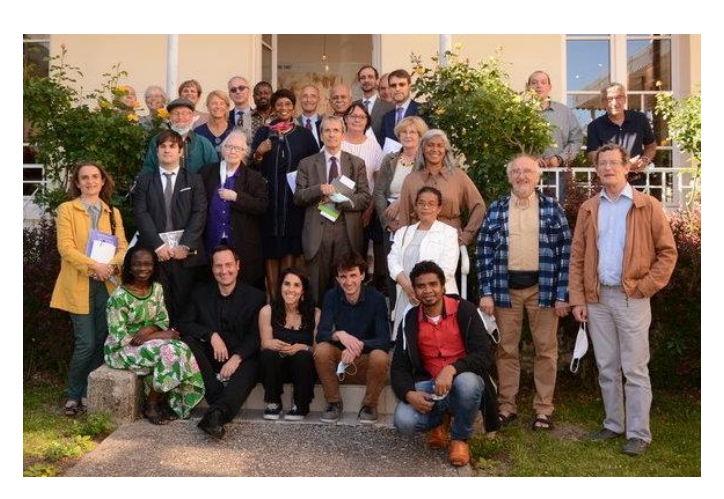
Figure 5: Visit UNESCO's ambassadors at JWC

organization. One was hosting a delegation from the UNESCO on 31<sup>st</sup> May 2021 to know the Centre and to give support to the nomination to be included it in the Memory of the World's Programme, 1 assisted with logistics, reception of people and time checking<sup>32</sup>. Another event was the celebration of the week of the international archives in June, for which I was asked to write an article about my experience in the JWC. It was published on ATD