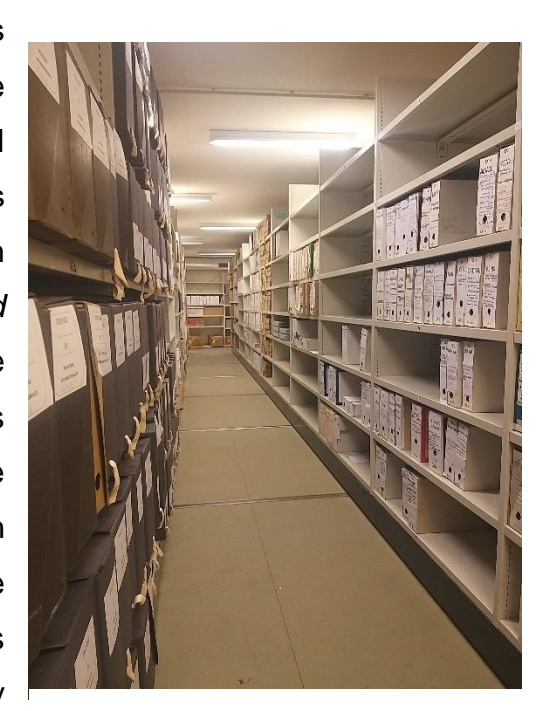
Figure 7: Boxes in the conservation room at JWC