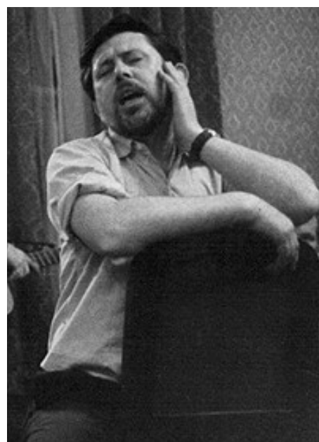
Figure 7: Ewan MacColl singing with fingers planted firmly in the ear, a habit picked up from his father, and meant to help him better hear himself sing. Late 1950s-early 1960s.