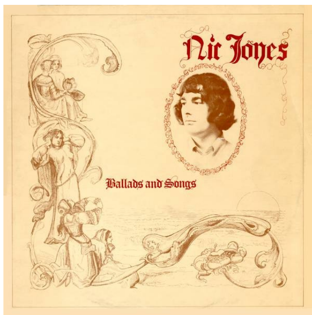
Figure 4: Cover of Nic Jones's Ballads and Songs album (1970) by Janet Kerr.

ballad "Annan Water" has been fetched (and "altered and simplified . . . considerably", as stated in the sleeve notes) from "an appendix of volume 4 of the Child Ballads [sic]", where it was "found tucked inconspicuously away". The name of the album unmistakably recalls the tradition of collections from Sharp back to the Romantics, and is complemented by a medieval-inspired cover art which evokes the historically inaccurate but stubborn identification of the ballad with romanticized medieval times 18 . The three Child ballads are "Sir Patrick Spens" (58), "The Outlandish Knight" (4) and "Little Musgrave" (81), all