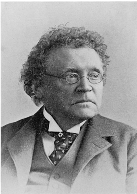
Figure 1 : Francis J. Child, c. 1890.