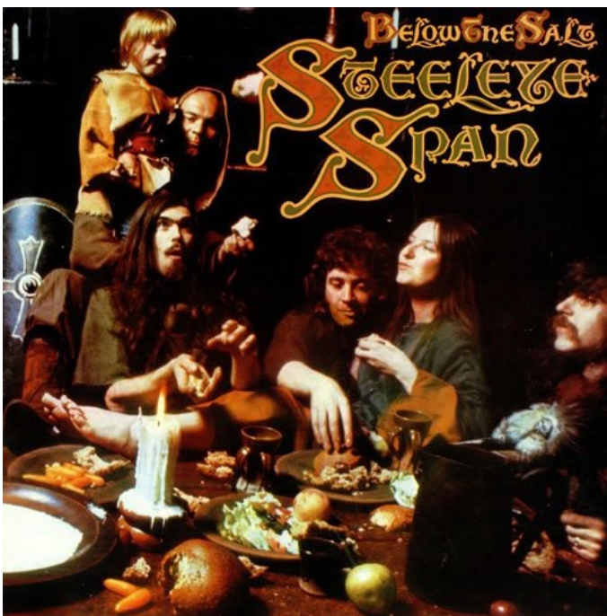
Figure 5: Cover art for Steeleye Span's Below the Salt album (1972), by Grahame Berney.

If a historical haziness was the necessary attribute of a revival creating its continuity with the past, folk-rock also seemed to violate this, paradoxically, by plunging head-first into a medieval fantasy distinctly removed from the here and now. This was done in a self-aware, tongue-in-cheek