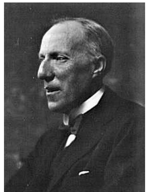
Figure 2: Photograph of Cecil J. Sharp. 1916.

The entry of Sharp at the Society provided a welcome impetus, and introduced what has been looked back on as “the golden age of English and Scottish folk song collecting”