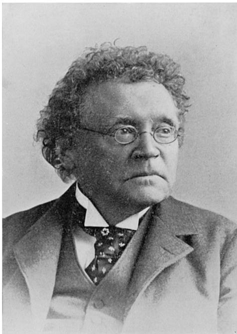
Figure 1 : Francis J. Child, c. 1890.