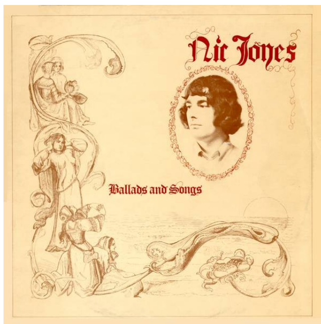
Figure 4: Cover of Nic Jones's Ballads and Songs album (1970) by Janet Kerr.

ballad "Annan Water" has been fetched (and "altered and simplified . . . considerably", as stated in the sleeve notes) from "an appendix of volume 4 of the Child Ballads [sic]", where it was "found tucked inconspicuously away". The name of the album unmistakably recalls the tradition of collections from Sharp back to the Romantics, and is complemented by a medieval-inspired cover art which evokes the historically inaccurate but stubborn identification of the ballad with romanticized medieval times 18 . The three Child ballads are "Sir Patrick Spens" (58), "The Outlandish Knight" (4) and "Little Musgrave" (81), all