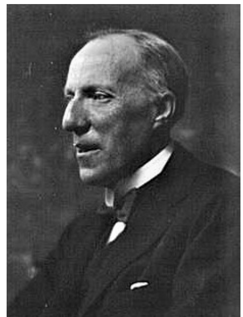
Figure 2: Photograph of Cecil J. Sharp. 1916.

The entry of Sharp at the Society provided a welcome impetus, and introduced what has been looked back on as "the golden age of English and Scottish folk song collecting"