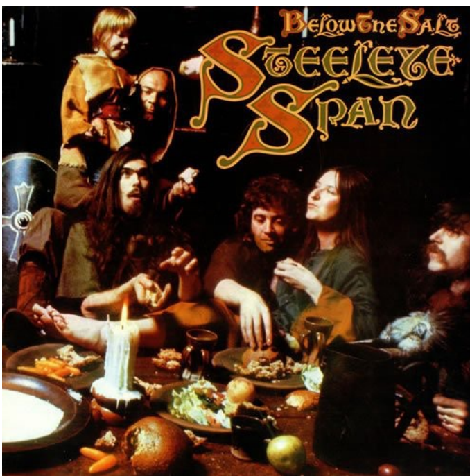
Figure 5: Cover art for Steeleye Span's Below the Salt album (1972), by Grahame Berney.

If a historical haziness was the necessary attribute of a revival creating its continuity with the past, folk-rock also seemed to violate this, paradoxically, by plunging head-first into a medieval fantasy distinctly removed from the here and now. This was done in a self-aware, tongue-in-cheek