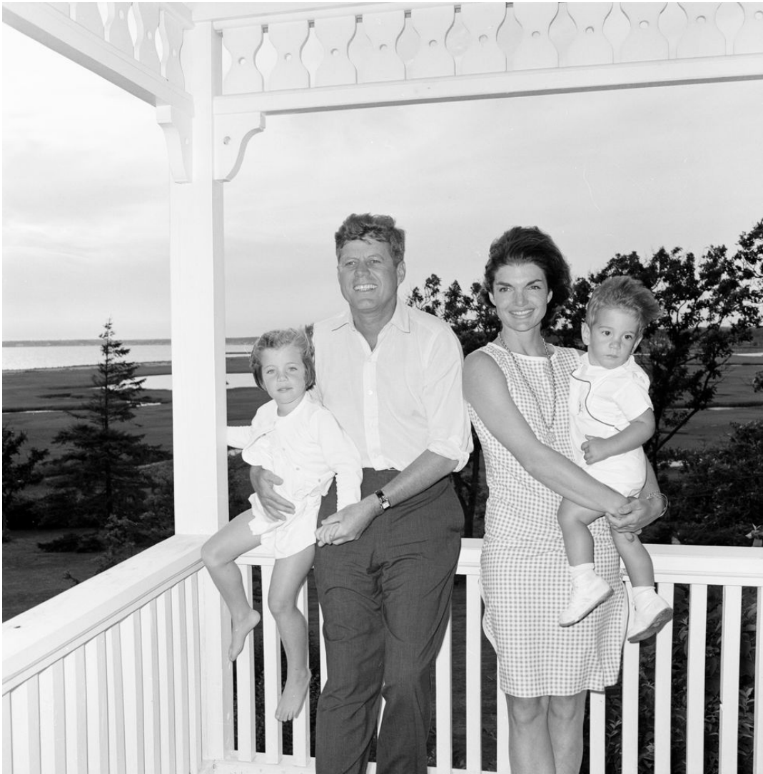
Figure 3. President John F. Kennedy and First Lady Jacqueline Kennedy pose for a portrait with their children, Caroline Kennedy and John F. Kennedy Jr., on a porch in Hyannis Port, Massachusetts. August 4 th, 1962.