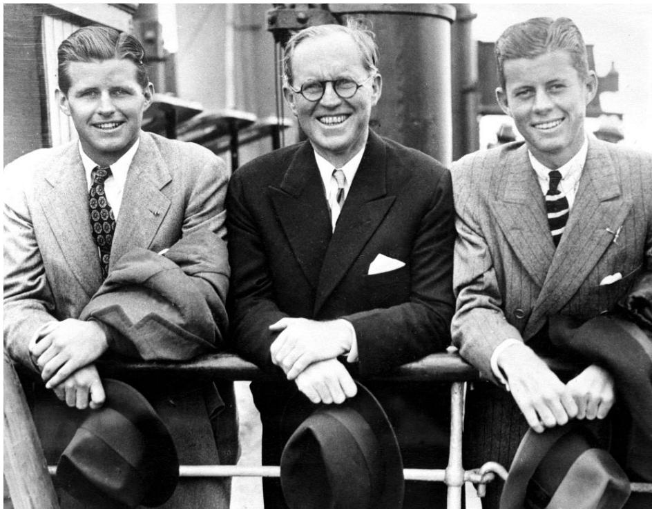
Figure 1. (From left to right) Joseph P. Kennedy Jr., Joseph P. Kennedy Sr., and John F Kennedy arriving at Southampton, England. 2 nd July 1938.