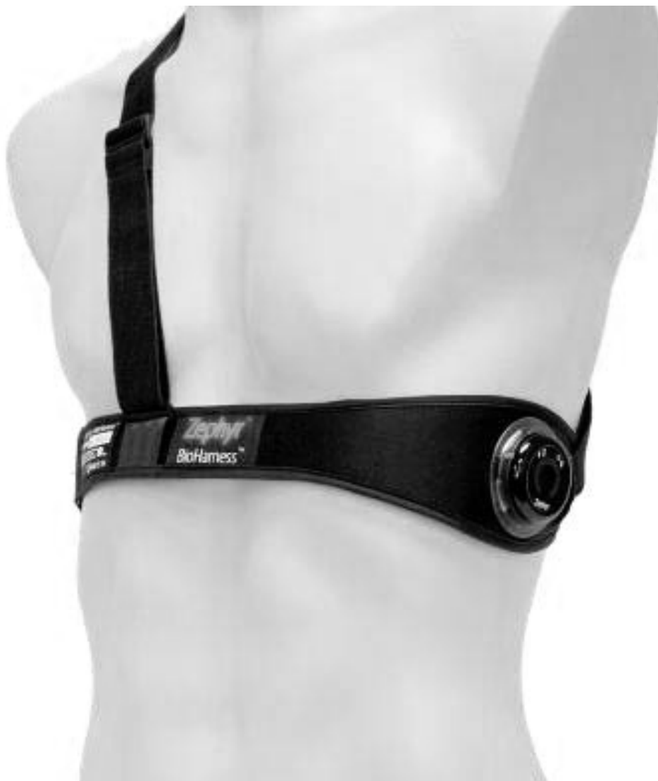
Figure 2: Zephyr BioHarness 3.0®