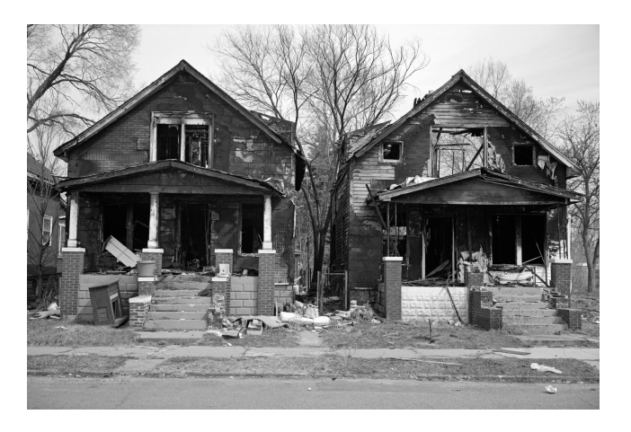
Illustration 1. Foreclosed homes in Detroit, Michigan. Photo from Bruce Gilden's Foreclosures (2013).

The foreclosure crisis is a crisis of invisibility. Many people who lose their homes to foreclosure, will, at least temporarily, be unavailable for any conventional survey sample, because such samples are typically drawn from lists of residential addresses or landline telephone numbers. Because conventional survey methods begin by sampling households, people who do not have fixed membership in a household - whether because they are "doubling up with friends or family, moving to another city, couch-surfing, living in shelters, or living in motels or some other informal dwelling arrangement - can simply disappear from our statistical view.<sup>13</sup>