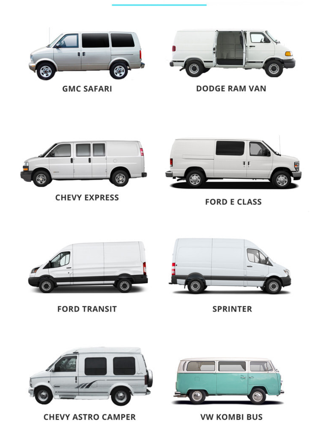
Illustration 2. Common van models used for conversion.