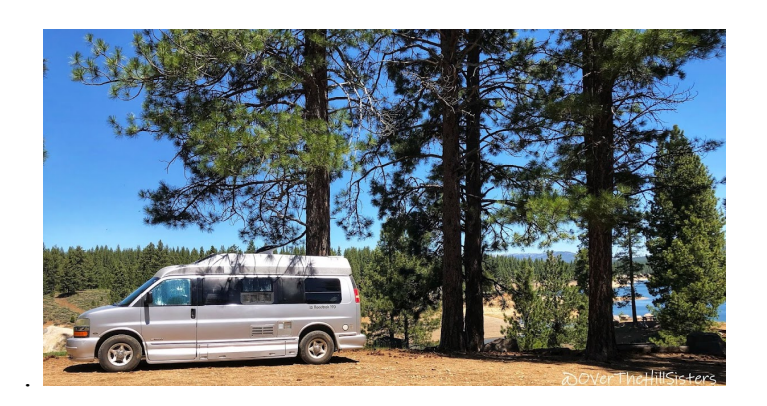
Illustration 4. Van in Boca Campground, Tahoe National Forest, California.