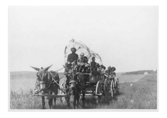
Figure 5. Pioneers in a covered wagon pulled by mules, near Colby, Kansas (1879).

This extract is of interest in the study of vandwelling. Indeed, to a certain extent, nomads follow in the footsteps of the settlers who moved West.