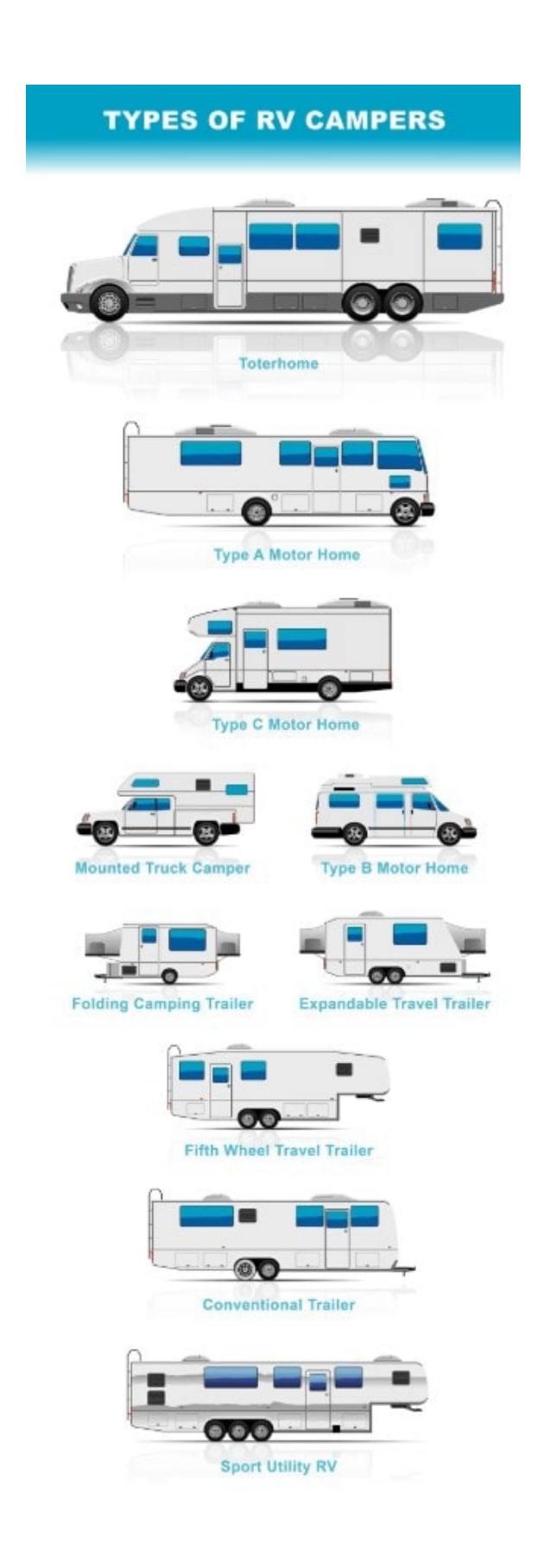
Illustration 3. Type of RV campers.