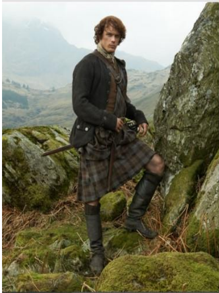
James Fraser in Outlander