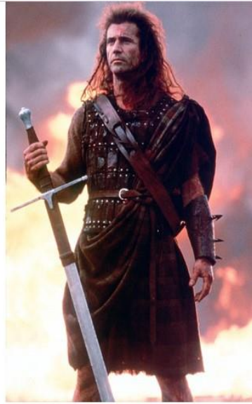
William Wallace in Braveheart