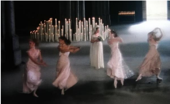
Figure 6: Ballerinas, seen in Claude's imagination, Hair (Forman, 1979)

They disguised and revealed themselves in costumes that were avatars of theatrical or historical or mythological identities, rather than the easily legible roles recognized by contemporary society. 51