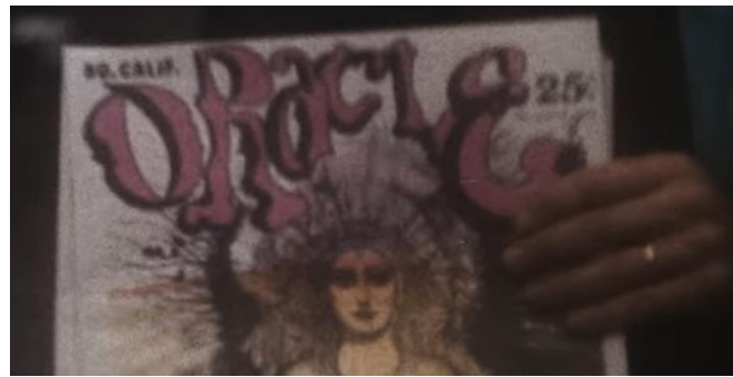
Figure 37: close-up on the cover of The San Francisco Oracle , in Haight Ashbury, Psych-Out (Rush, 1968)