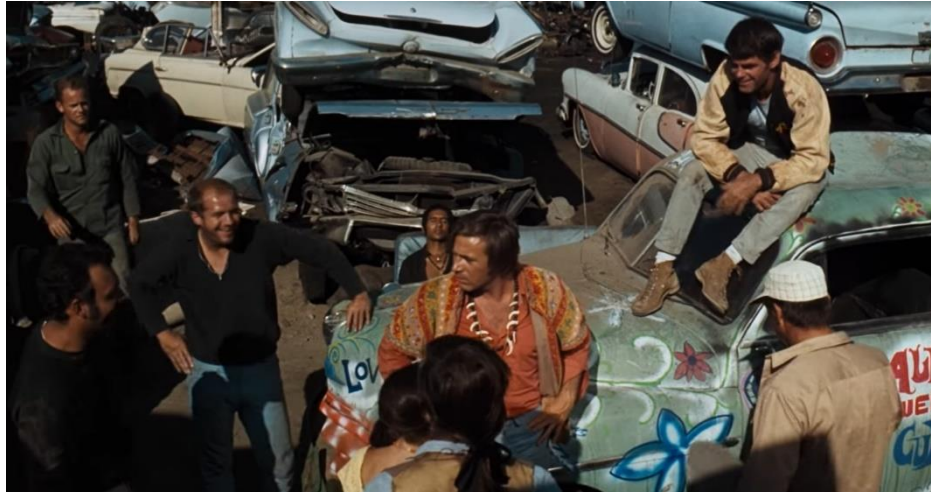
Figure 32: Hippies surrounded by people from the dominant culture at a landfill site, Psych-Out (Rush, 1968)