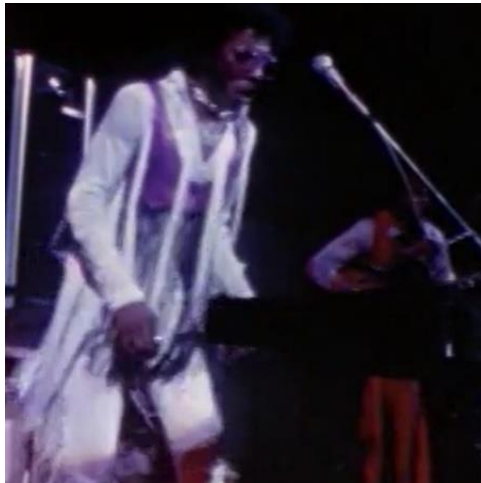
Figure 8: Sly Stone in Woodstock (Wadleigh, 1970)

This eccentricity could be felt when they dressed in bright colours, special fabrics, with original clothes shapes, and when they wore big accessories and colourful glasses.