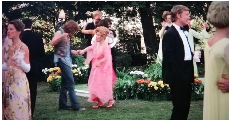
Figure 23: Berger arriving at Shella's party and contrasting with the elegantly dressed crowd, Hair (Forman, 1979)

In Figure 22, Shella and her friends are wearing white ballgowns and have their hair perfectly done. However, they are smoking and hiding from Shella's parents. It foreshadows her befriending hippies later in the film since she rebels against her parents' authority right at the beginning of the film. Besides, there is a parallel here between Shella and the hippies. Indeed, she is shown hiding to smoke in an elegant white attire reminiscent of purity. It highlights a sharp contrast. And just before, the hippies are shown arriving at the banquet dressed in hippie fashion, which underlines a sharp contrast with the elegantly dressed crowd (Figure 23). She seems interested in the hippies during this banquet and then interacts with them throughout the film.