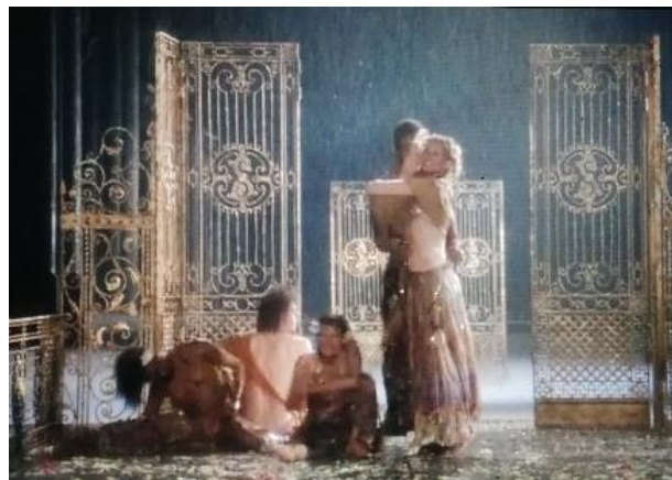
Figure 13: People dressed in an Oriental manner in Claude’s imagination, Hair (Forman, 1979)

When Harold (Figure 12) is discussing philosophy with a more experienced hippie, both are wearing clothes that are inspired by Eastern traditions. Indeed, they are wearing Indian inspired tunics, draped cloths, beads and artefacts that are reminiscent of “monks draped in linen”. What also shows that they could have been inspired by the East is the subjects they discuss. Indeed, they are evoking a connection with nature and hatha yoga, which are practices that are linked to Eastern religions and philosophies. At this time of the film, Harold is supposed to be an actual