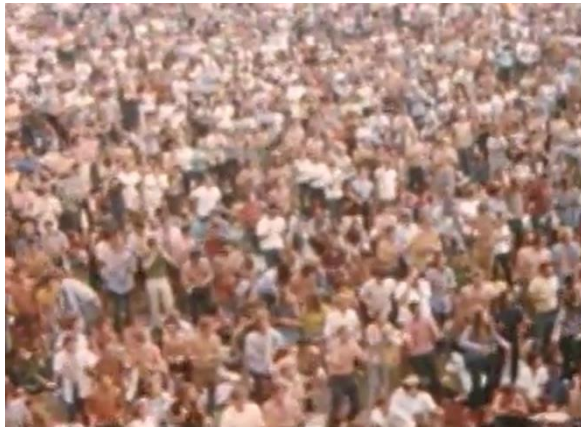
Figure 1: A crowd of festivalgoers, Woodstock (Wadleigh, 1970)

In these two images taken from the documentary, a huge crowd of festivalgoers is visible in a long shot. The dominant colours are blue and beige, the colours of jeans and of white skin.