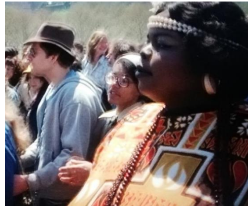
Figure 11: A black woman at a party in a park, Hair (Forman, 1979)

In figure 11, a woman is wearing a blouse with an ethnic and colourful pattern. This garment seems to be an African traditional garment. The fact of wearing traditional garments allowed black people to assert their individuality, but also to claim their African heritage and to fight for their rights and recognition. Indeed, the development of the Black Pride and Black Power movements, led by groups such as the Black Panther Party, took place. The Black Power movement advocated for equality between white people and black people and for the assertion of the African American identity and social and political power 56 . It defended the African American heritage and culture and promoted an African American self-sufficiency through the “deconstruction of white power structures” 57 . Their cause was marked by the slogans “Black Power for Black People”, used by the political organization Lowndes County Freedom