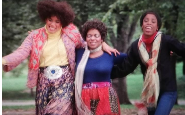
Figure 43: women from the dominant culture in a parc, Hair (Forman, 1979)

In the first image, the two women on the right are dressed in a rather classical way, in comparison to the woman on the left. However, the woman in the middle is wearing golden boots and a jacket that stands out from her look. The woman on the left is wearing boots with golden heels, a pair of mini shorts, a jacket and a peacock patterned loose blouse. On the second picture, the two women on the left are dressed in oriental patterned skirts. The woman on the left is also wearing a large, ornamented belt, and an oriental patterned jacket. The woman on the right is dressed in a rather simple manner. These looks are reminiscent of the looks that I presented in my typology of the hippies. They feature colourful and patterned, loose and fluid clothes. The fact that these scenes show gradations in the inspiration from the hippies, it proves that their looks inspired the dominant culture in different ways: from tiny details to an entire outfit. And because people from the mainstream culture began to incorporate hippie inspired clothes to their everyday outfit, designers and shops produced more and more clothes that were inspired by the hippies' way of dressing. Therefore, it became mainstream. Everyone began to let their hair grow as Yvonne Connickie explains. She also says that luxury designers and high fashion, were inspired by hippies,