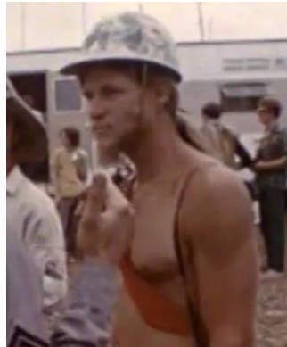
Figure 18: A man wearing a war helmet, Woodstock (Wadleigh, 1970)