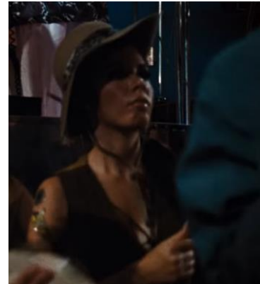
Figure 19: A woman dressed like a cowboy, Psych-Out (Rush, 1968)