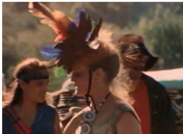
Figure 5: A woman with a feather hat, Woodstock (Wadleigh, 1970)

I will be using the term “eccentric”, in its etymological sense – the word comes from the Greek ek and kentron giving ekkentros , meaning “out of the centre” - to evoke hippies who defied fashion the most. These hippies, as we can see in the films of the corpus, wore extravagant accessories and clothes, bright colours or clothes that seemed to be completely in contrast with the time period, context and reality they were worn in. Examples of this eccentricity can be found in the documentary Woodstock .