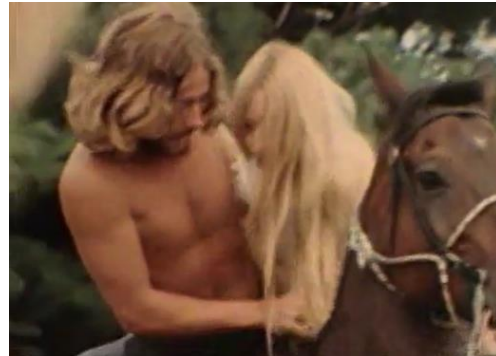
Figure 21: A man and a woman riding a horse, Woodstock (Wadleigh, 1970)

They are bare chested and are wearing cowboy hats. These images were chosen to be the opening of the film and were the first images the audience was to see as a sort of presentation of the festival and its goers. This representation of the hippies as close to nature and animals, as free and even close to traditional cowboys is interesting. It was a way for them to subvert an important symbol of the history of America and provoke the dominant society by revisiting and reinterpreting an important symbol of the Frontier and thus of the American history. These scenes can thus be seen as a form of provocation. They also have been created to display an idealised past, which was created by this counterculture that wished to create a better society out of diverse inspirations after a wave of radicalism in the New Left and other political movements.