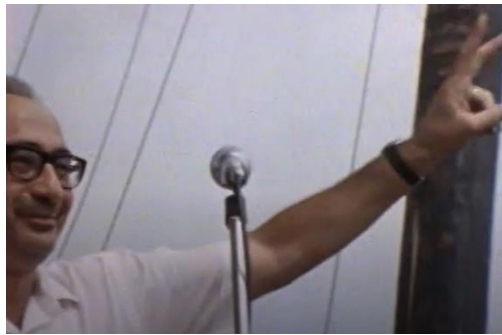
Figure 35: the owner of the field where the festival was organised addressing the festivalgoers and making the peace sign with his fingers, Woodstock (Wadleigh, 1970)

of the farm, who lent his field to the organisers of the festival to bring it to life even addressed the festival goers and made the peace sign with his fingers, as a sign of support.