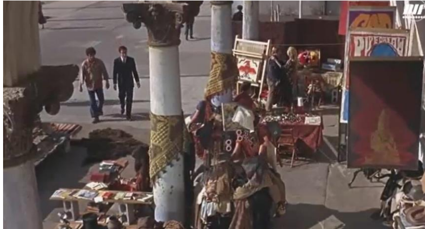
Figure 38: A hippie market, I Love You, Alice B. Toklas! (Averback, 1968)

If the hippies sold the items that they handcrafted, second hand clothes, accessories, cannabis, or newspapers, as this scene shows, they still sold things, and thus participated in consumerism. As Nadya Zimmerman says, “The counterculture was engaged in consumerism – buying and selling – the main mode of action in a capitalist system” 99 . Woodstock also shows that the hippies sold and bought.