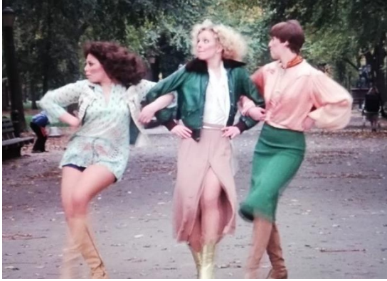
Figure 42: women from the dominant culture in a parc, Hair (Forman, 1979)