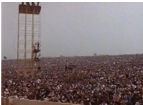
Figure 39: Panorama of the immense crowd of Woodstock, Woodstock (Wadleigh, 1970)

If the hippies sold the items that they handcrafted, second hand clothes, accessories, cannabis, or newspapers, as this scene shows, they still sold things, and thus participated in consumerism. As Nadya Zimmerman says, “The counterculture was engaged in consumerism – buying and selling – the main mode of action in a capitalist system” 99 . Woodstock also shows that the hippies sold and bought.