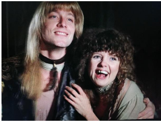
Figure 10: Woof wearing eccentric clothes like Lafayette, Hair (Forman, 1979)

member of the hippie group of friends (Figure 9). In this scene, his style contrasts with that of the white characters, who are wearing rather simple and natural toned clothes. Indeed, he, and the other black people on the image, are wearing more colourful and decorated clothes than the others. They are wearing silk, velvet, fringes, feathers, fur, and clothes with ethnic patterns. The only white person in this scene, who is wearing similarly eccentric clothes is Woof (Figure 10), but he is the only one. In this way, African Americans stand out. Moreover, in this scene, the characters sing two songs called “Colored Spade”, which deals with the skin colour of African Americans and their stigmatization, and “I’m Black, Ain’t Got No”, which promotes the acceptance of diversity. The eccentricity of the black community could thus be found in garments such as Sly’s and Lafayette’s, but also through their use of traditional, ethnic garments.