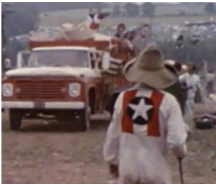
Figure 17: A man wearing an overall with the American symbol, Woodstock (Wadleigh, 1970)