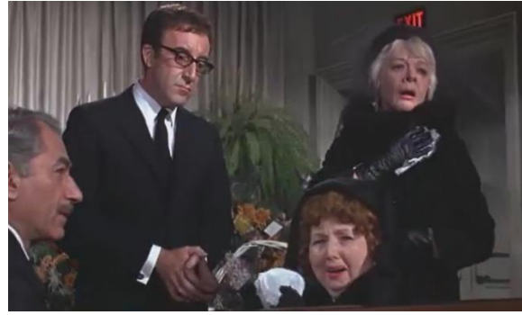
Figure 34: Harold's brother wearing a Hopi attire at a funeral, I Love You, Alice B. Toklas! (Averback, 1968)