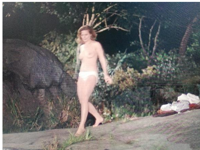
Figure 27: Shella has undressed at the lake, Hair (Forman, 1979)

However, she finally undresses and swims in the lake. This scene marks the beginning of her inclusion in the group, even if her clothes are stolen by Jeannie and she must go home without her clothes on, which makes her angry. Just before she undresses, she is wearing a white blouse with a sophisticated pant suit and her hair brushed out (Figure 26). But then, she is shown almost