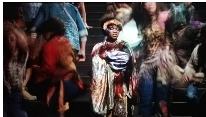
Figure 16: A woman surrounded by colourful hippies, Hair (Forman, 1979)

Since their lifestyle was linked to the consumption of drugs and free love 69 , it led them to wear comfortable clothes 70 in order not to be hindered by them when taking drugs or to wear clothes that did not match just because they felt that they were drawn towards them and wanted to wear them 71 , when they were under the influence of drugs for instance. Indeed, “they set the seal on the “anything goes” attitude, which had been building in force for some time, happily mixing up ethnic and psychedelic influences.” 72 . Every hippie in the films under study wears loose clothes. In image 14, people are wearing either a loose shirt or just a pair of shorts. They thus are wearing something comfortable while taking drugs. Besides this notion of comfort, the artistic influence of psychedelic effects is even represented in the film Psych-Out , when Jenny and Stoney are making love (Figure 15). Indeed, psychedelic patterns are projected on their nude bodies, and mirror effects are used, suggesting the effects of drugs on one’s perception.