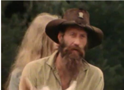
Figure 20: A man and a woman riding a horse, Woodstock (Wadleigh, 1970)

each other. An inspiration from the cowboy imagery can be found in the introduction to the film Woodstock . Indeed, in this introductory scene, showing the building of the structures of the festival, hippies are shown galloping on a horse, with almost no harness.