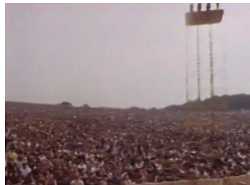
Figure 40: Panorama of the immense crowd of Woodstock, Woodstock (Wadleigh, 1970)

Indeed, in order to come to the Woodstock festival, they had to pay for tickets. If we take into consideration that this festival had an extraordinary success, and that it welcomed half a million of festival goers, it must have created profits. Besides, the artists, who performed at Woodstock had to be paid for their shows. Janis Joplin, Jimi Hendrix and other famous artists took part in the festival and were paid a huge amount of money for their performance 100 , because they were