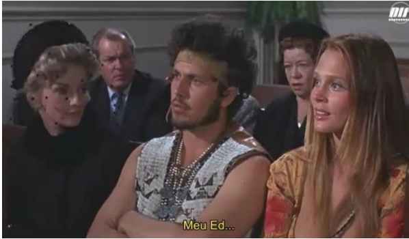
Figure 33: Harold's brother wearing a Hopi attire at a funeral, I Love You, Alice B. Toklas! (Averback, 1968)

hippies and people from the mainstream and shows that their relationship can be rather aggressive.