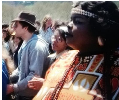
Figure 11: A black woman at a party in a park, Hair (Forman, 1979)

In figure 11, a woman is wearing a blouse with an ethnic and colourful pattern. This garment seems to be an African traditional garment. The fact of wearing traditional garments allowed black people to assert their individuality, but also to claim their African heritage and to fight for their rights and recognition. Indeed, the development of the Black Pride and Black Power movements, led by groups such as the Black Panther Party, took place. The Black Power movement advocated for equality between white people and black people and for the assertion of the African American identity and social and political power 56 . It defended the African American heritage and culture and promoted an African American self-sufficiency through the “deconstruction of white power structures” 57 . Their cause was marked by the slogans “Black Power for Black People”, used by the political organization Lowndes County Freedom