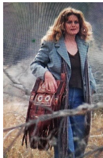
Figure 25: Shella wearing hippie items at the end of the film, Hair (Forman, 1979)

Her clothes then evolve as the film progresses. Indeed, the first time that she meets the hippies, she is wearing a white ballgown, her hair done in a sophisticated bun with expensive jewellery.