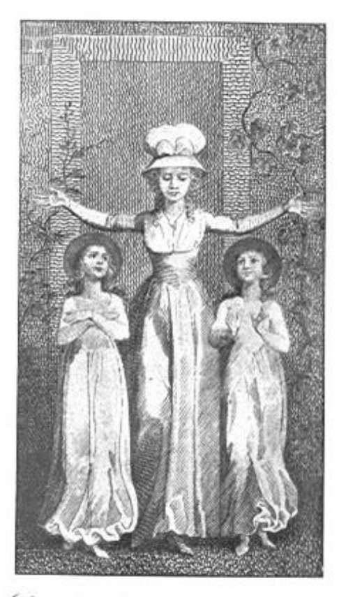
Lock what a fine morning it is ... Insects. Birds & Animals, are all enjoying existence

Spinning bees: community gatherings to spin yarn, homespun production to support the patriotic cause during the American Revolution. Unknown artist.