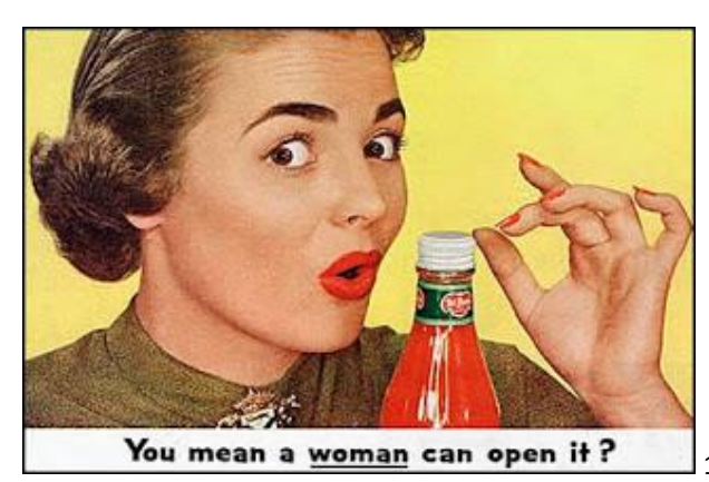
1953 Alcoa Aluminum

Do you think ads can influence the way we see gender equality? How?