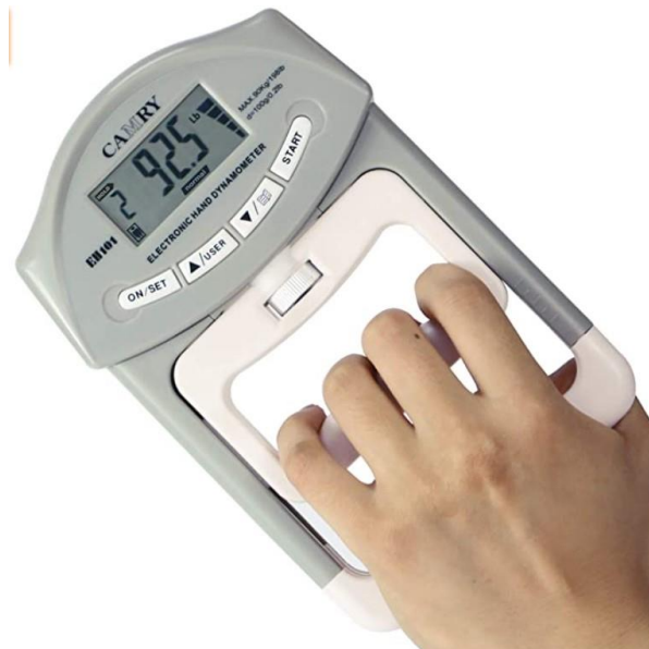
Figure 3- Handgrip dynamometer

The patient had to be sitting. The patient had to grip the dynamometer as hard as possible, during 5 seconds, using her/his dominant hand. The arm had to be bend at 90°, without pressing the instrument against the body or helping with the other hand. Three tests were performed and the best performed was used for the analysis. Handgrip strength was considered low, i.e. in favor of malnutrition, if < 16 kg in females and < 26 kg in males.