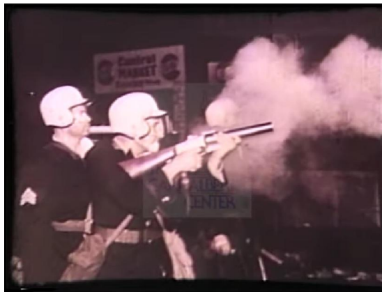
Figure 2 : Richard Nixon’s “Law and order” advertisement campaign (1968) (0:06)

It also depicts images of cops, guns, destroyed streets with debris as well as firefighters extinguishing a fire in a building. The images alternating with each other, the piercing music as well as Richard Nixon’s voice-over convey a very clear message in this advertisement: Nixon “pledge[s]” to be the president who will bring order back to the United States.