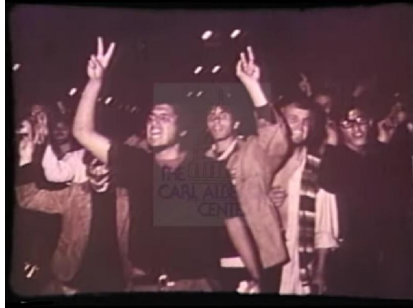
Figure 1 : Richard Nixon’s “Law and order” advertisement campaign (1968) (0:12)

order in the United-States 1 . This campaign, which is almost dystopian-like in its atmosphere, depicts images of protesters from an anti-war protest, as we can most likely interpret from one image from the advertisement: two adults making a peace sign.