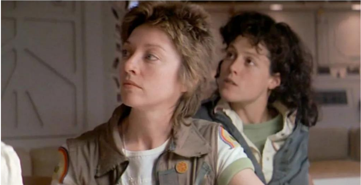
Figure 2: Lambert and Ripley in Alien , (00:11:05)

So, while Ripley and Lambert share some characteristics with traditional Final Girls, Alien stands out as a departure from the Final Girl trope. As previously said, Lambert and Ripley are both boyish by their names, and are by their appearance and behavior. Lambert has short blond hair while Ripley has black and curly mid-length hair. They do not correspond to the stereotype of the blond Final Girl such as Laurie in Halloween , Trish in Slumber Party Massacre and other several Final girls of the 70s and 80s. Unlike them, the shorthaired Lambert and the black-haired Ripley are both physically different from Final Girls. Furthermore, Ripley's status as the sole survivor lets us believe that a new "type" of female survivor has entered the Hollywood Industry.