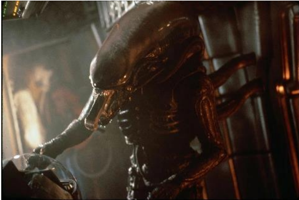
Figure 9: Bolaji Badejo and Percy Edwards in Alien

Badejo. It has a first jaw that opens revealing a second jaw with a row of teeth and exerting a deadly pressure on its victim like a slaughter gun by perforating its victim.