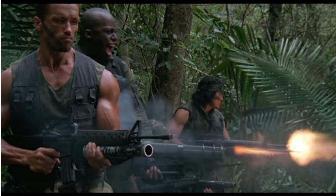
Figure 8: Dutch in Predator , (00:46:05)

the Predator which is a massive monster with the ability to become invisible. The differences between Dutch and Vasquez are largely minor, but the major one is indeed their gender.