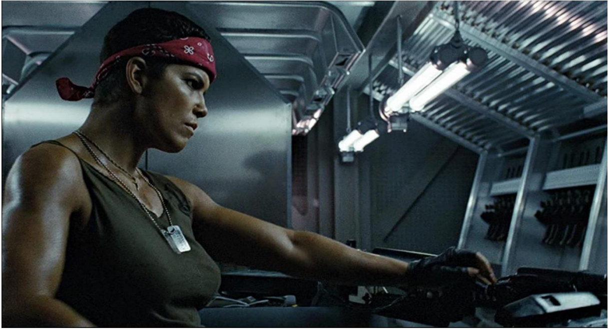
Figure 7: Private Vasquez in Aliens , James Cameron, Director's cut, 2003, (00:35:45)

Indeed, her physical appearance matches with her profession: as a marine, she has a similar appearance to her male colleagues, especially large camouflage cargo pants, dust on their faces, and a fierce aspect. The utilization of cargo pants with a camouflage pattern is worth examining. Camouflage patterns are utilized by the military and hunters to hide in the woods, but on LV-426 in Aliens , there are no woods.