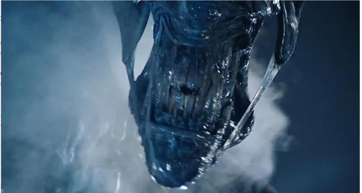
Figure 4: Dripping Alien Queen in Aliens (02:18:18)