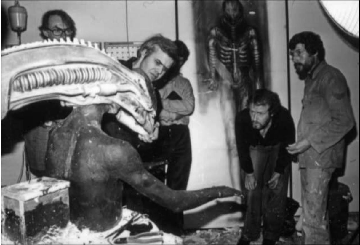
Figure 10: Bolaji, Giger and Scott

Giger then designed a monster with a phallic head shape, a jaw which can thus be related to the Vagina Dentata , and again can therefore be a hybrid of two genders, female and male, thus would be a non-binary creature. Even though Ridley Scott declared that the Xenomorph has no gender (Interview Ridley Scott), the creature still shows female and some male features. The female features can be seen in the Alien Queen in the second movie, but about the Xenomorphs themselves, they can be seen as a personification of patriarchy, not only by their physical appearances, but also their behaviors.