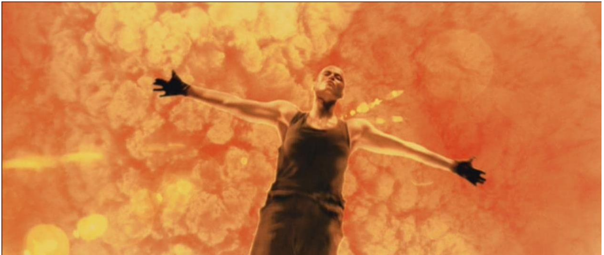
Figure 12: Ripley's suicide in Alien 3 , (02:11:50)

3) Alien 3 , the fate of Ripley, no abortion possible, mandatory to give birth.