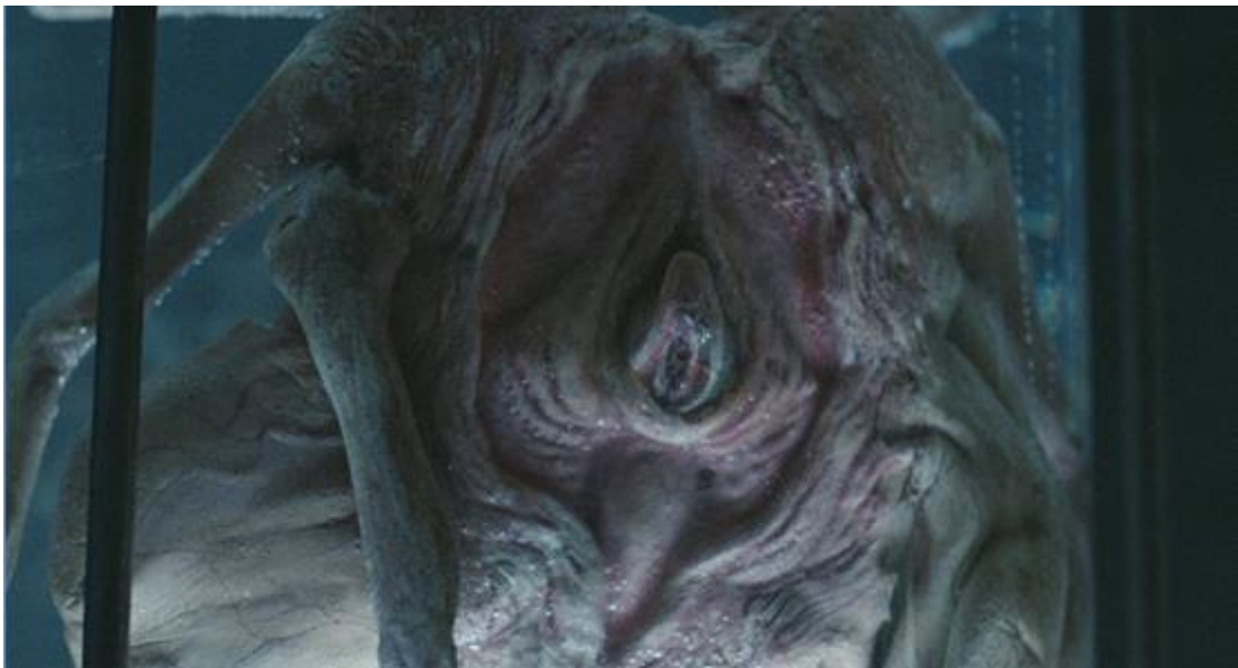
Figure 6: Facehugger in Aliens (00:53:22)

The corporation strategically distances itself from the perceived "danger" associated with the female body by issuing orders to the crew members to investigate LV-426. They are pawns in some silly game being played by Weyland-Yutani, the firm behind all Alien movies, video games, and comic books. When employing the crewmembers to explore the derelict ship, this entity gives the impression that there is disdain when confronted with women's bodies. The crewmembers are like minions who will risk their lives, while the corporation only takes what benefits them.