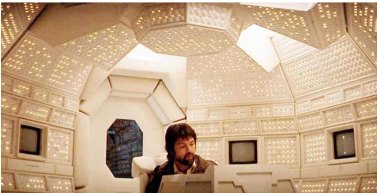
Figure 3: Mother in Alien (00:08:10)