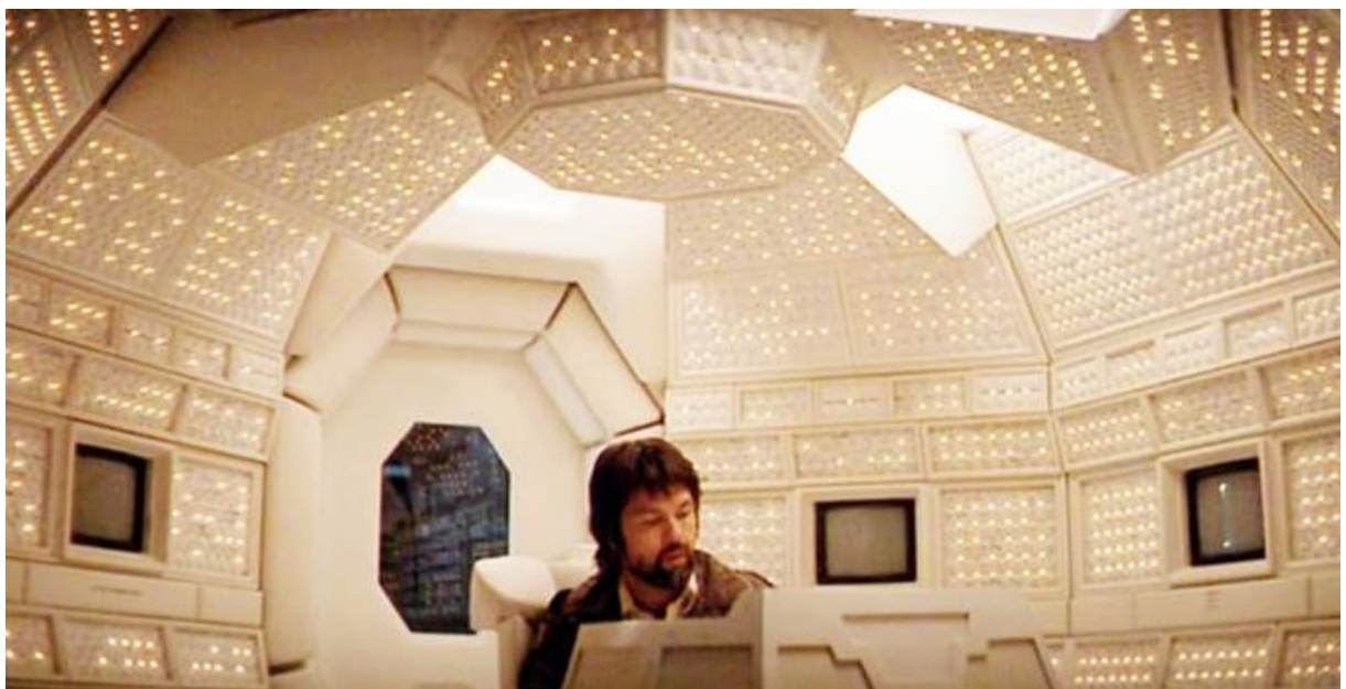
Figure 3: Mother in Alien (00:08:10)