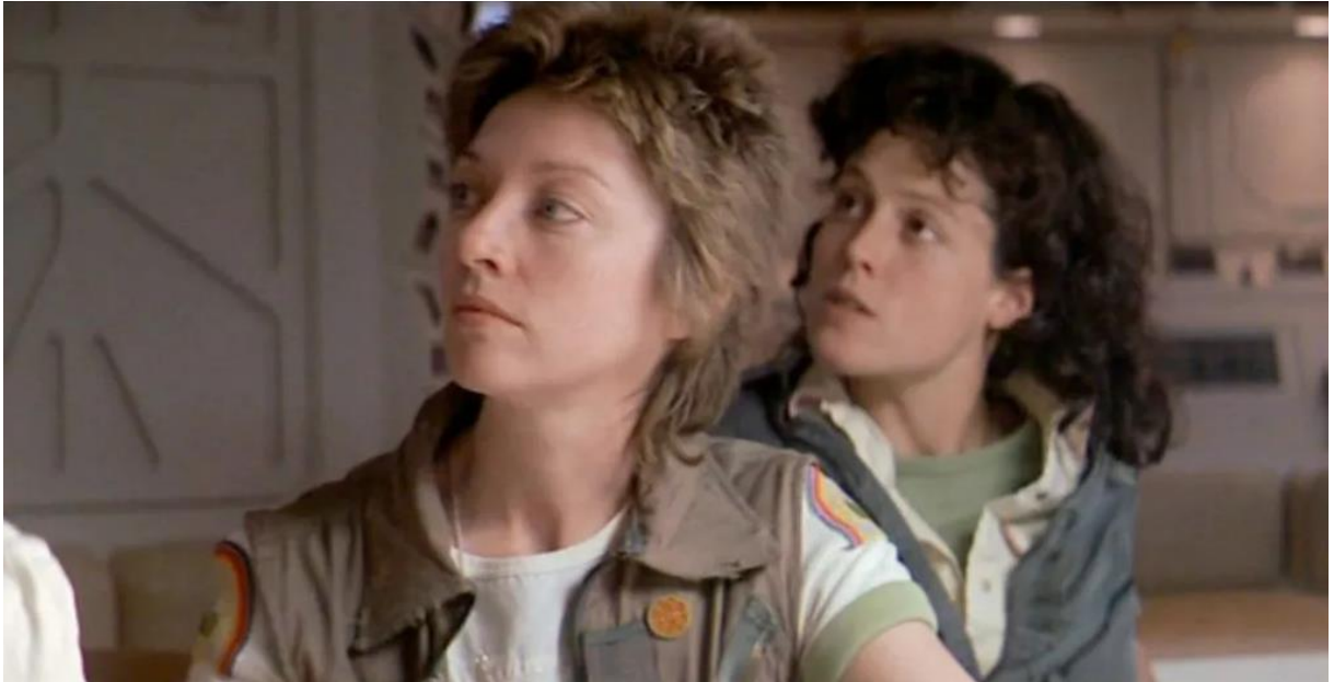
Figure 2: Lambert and Ripley in Alien , (00:11:05)

So, while Ripley and Lambert share some characteristics with traditional Final Girls, Alien stands out as a departure from the Final Girl trope. As previously said, Lambert and Ripley are both boyish by their names, and are by their appearance and behavior. Lambert has short blond hair while Ripley has black and curly mid-length hair. They do not correspond to the stereotype of the blond Final Girl such as Laurie in Halloween , Trish in Slumber Party Massacre and other several Final girls of the 70s and 80s. Unlike them, the shorthaired Lambert and the black-haired Ripley are both physically different from Final Girls. Furthermore, Ripley's status as the sole survivor lets us believe that a new "type" of female survivor has entered the Hollywood Industry.