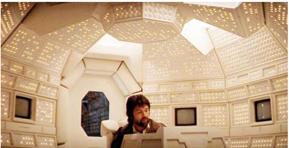
Figure 3: Mother in Alien (00:08:10)