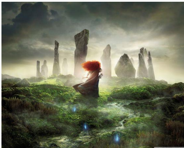
Figure 3 : The Standing Stones