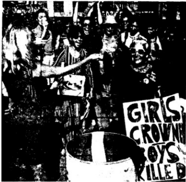
THEY'RE BURNED UP — Protesting Miss America Pageant on grounds not altogether clear to bystanders, 75 New York women discarded parts of their wardrobes into a trash can in some symbolic action of sorts.