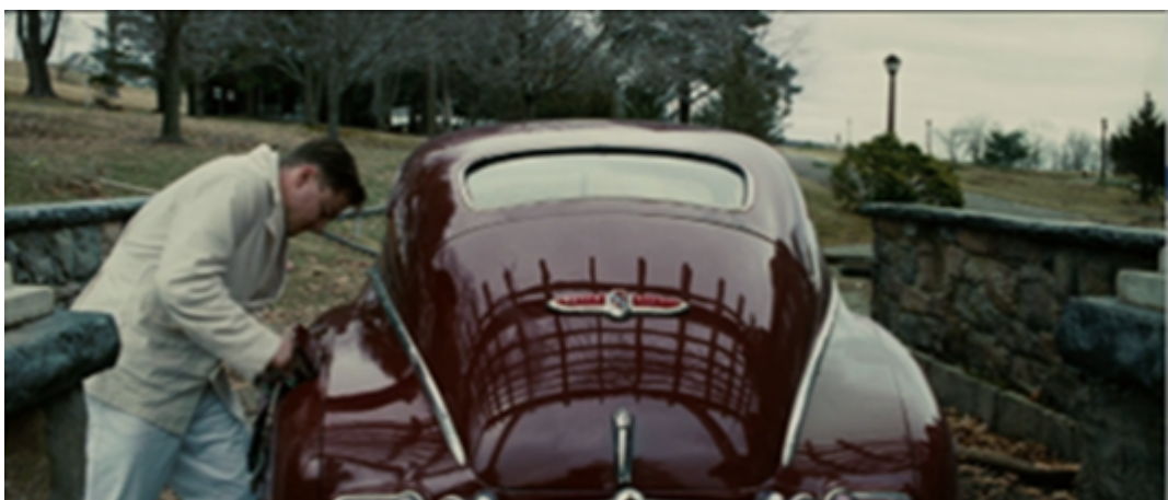
Illustration 22, extracted from Shutter Island , 1:41:10