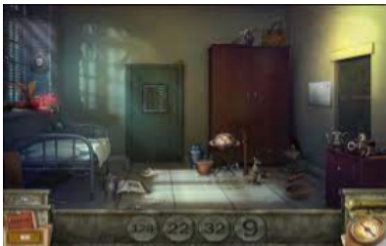
Illustration 24, extracted from Shutter Island, the Adventure Game

In addition, a video game based on Shutter Island exists: Shutter Island, the Adventure Game , and was launched in 2010, right after the release of the film. In this game, the player is once again in Andrew's head and has to discover the mysteries of Ashecliffe. The aim is mostly to find objects hidden into backgrounds that look a lot like the film's setting. In the following pictures (illustrations 24 and 25) we can recognize Rachel Solando's cell and Cawley's office. Furthermore, the characters of the game are taken from the film itself, as shown in illustration 26.