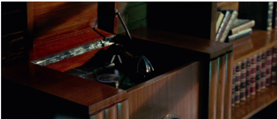
Illustration 4, extracted from Shutter Island , 00:23:03

A brief sequence analysis will illustrate this point. In the scene of the discussion that Andrew has with Chuck, Nahering and Cawley in the office (00:21:00), they remark that the music playing is “quartet for piano and string in A minor” and then move onto another discussion while the music continues to play. This links two scenes and focuses our attention on the importance of music in the film. The scene goes from a medium shot of Andrew and his interlocutors to a few shots of his memories of the liberation of Dachau, when he entered the SS office. The attention of the viewer is drawn to a turntable in the office of the dying commander of the camp, by putting four shots, closer and closer to the turntable, forcing the viewer to take notice of it (illustrations 4 to 7).