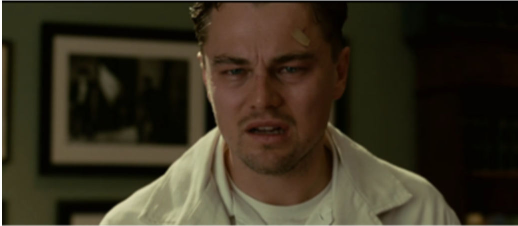
Illustration 1, extracted from Shutter Island , 00:55:45