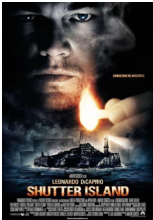
Illustration 23, Shutter Island (Martin Scorsese) poster

The aim of a film poster (illustration 23) is to show to the viewers what to expect of a film. It is also supposed to make them want to see the film. Shutter Island's poster is really dark: there is a picture of Leonardo DiCaprio on it. He is the only character represented, which immediately gives him the role of the main character that viewers will look for as the pillar of the story. It only shows a part of his face, which represents the mystery of the story, and a zone of shadow around him. Furthermore, we can see a lit match in front of DiCaprio's face, in order for him to see before him. Below the match and the face, we can see the island of the film, very darkly represented in black. Leonardo DiCaprio's name is also written in white, right above the title in brown colors: Shutter Island . The most striking detail of this poster, even though it seems to be the smallest one, is the sentence: "Someone is missing". If it seems clear that the "someone" is Rachel Solando in the beginning, the question becomes more and more: who is missing? Rachel Solando? Dolores Chanal? The children? Teddy Daniels? Andrew Laeddis? It definitely sets the ambiguity of the story and the mystery around Andrew.