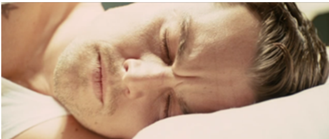
Illustration 14, extracted from Shutter Island , 00:27:28

As will show the next captions, the scene is a clear hallucination. Indeed, the first shot is a close up of Andrew's face while he closes his eyes and falls asleep. The next shot is a medium shot that shows an apartment. Instead of starting the hallucination at that moment, Scorsese decides to add another shot of the real Andrew, asleep in his bed, and a close up of the same turntable that was shown in the hallucination of the SS office. This element emphasizes the idea that the following scene is not real, by bringing the viewer back to the last hallucination of three minutes before. Then, the hallucination really begins with Dolores's image. Another thing to remark is the change of color. While the scenes with Andrew's face are light with white and skin color, the hallucinations have very vivid colors, especially the apartment with this almost electric green on the walls and the yellow flowery dress of Dolores in the middle of the screen. Finally, music is also a hint of the hallucination. Indeed, before the dream, there was no music, only the sound of the rain and the storm in the dorm. When Andrew starts to fall asleep in the first shot, a sort of vibrating sound can be heard and becomes louder and louder. When the apartment appears on screen, the weird sound is overpassed by music and disappears when Dolores starts to talk, while the music stays in the background of their talk.