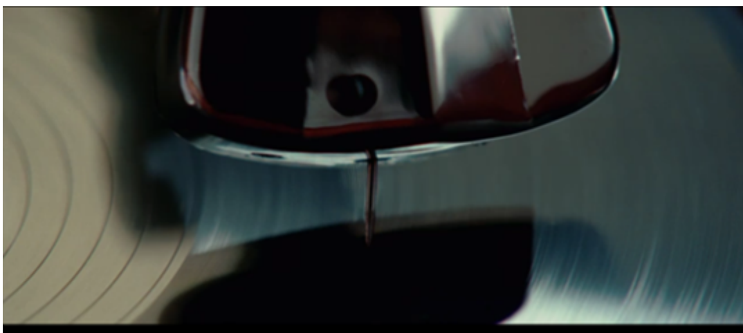
Illustration 7, extracted from Shutter Island , 00:23:05

Why is music then blurring and confusing? Opposingly to what Jorgen Bruhn said, in Shutter Island , music blurs the line between the diegetic and the meta-diegetic, between