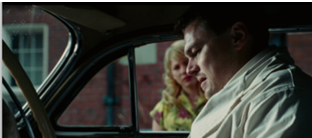
Illustration 19, extracted from Shutter Island , 01:40:46

This second analysis shows how flashbacks and hallucinations become more and more difficult to discern from reality throughout the story. In this extract, shown through the next captions, reality and hallucination meld and are hard to dissociate. During the scene, there is no music, only a background deep sound or a few noises that Andrew makes. There is no clear change of sound nor music between the moments where we see Dolores and where she disappears. Furthermore, there is no change of colors, on the contrary to the first studied scene, which provides a feeling of a complete intrusion in the real world. Dolores appears and disappears without a change of background, she does not disturb her environment. The only things that make us understand that she is not real are the fact that she is dead and that she disappears and reappears from one shot to the other.