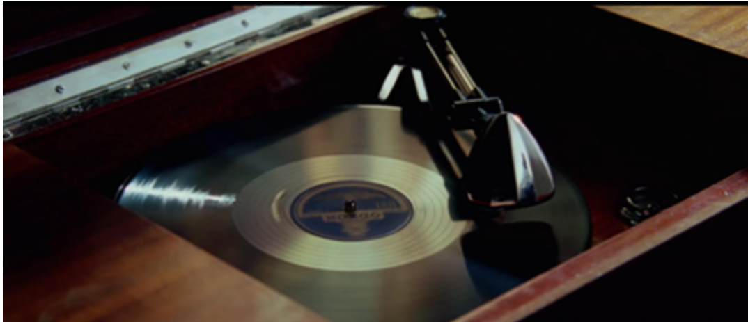
Illustration 5, extracted from Shutter Island , 00:23:04