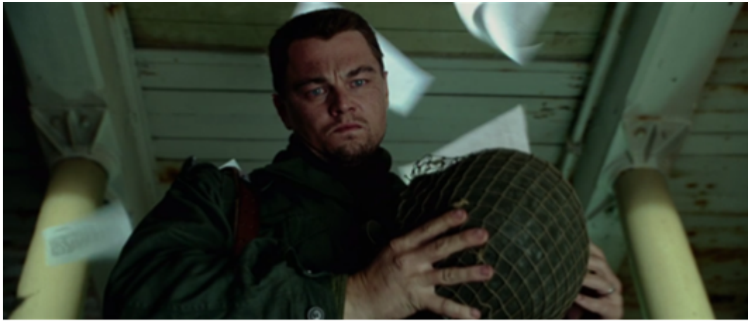
Illustration 11, extracted from Shutter Island , 00:23:49

A second scene adds to this idea: Andrew finding the SS commander. When he comes into the office, hundreds of pieces of paper are flying in the air, while there does not seem to be much wind. Pieces of paper fall continually, as if people were throwing them from the roof for long minutes, which is impossible and unrealistic (illustration 11).