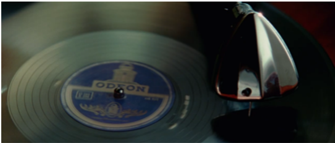
Illustration 6, extracted from Shutter Island , 00:23:04