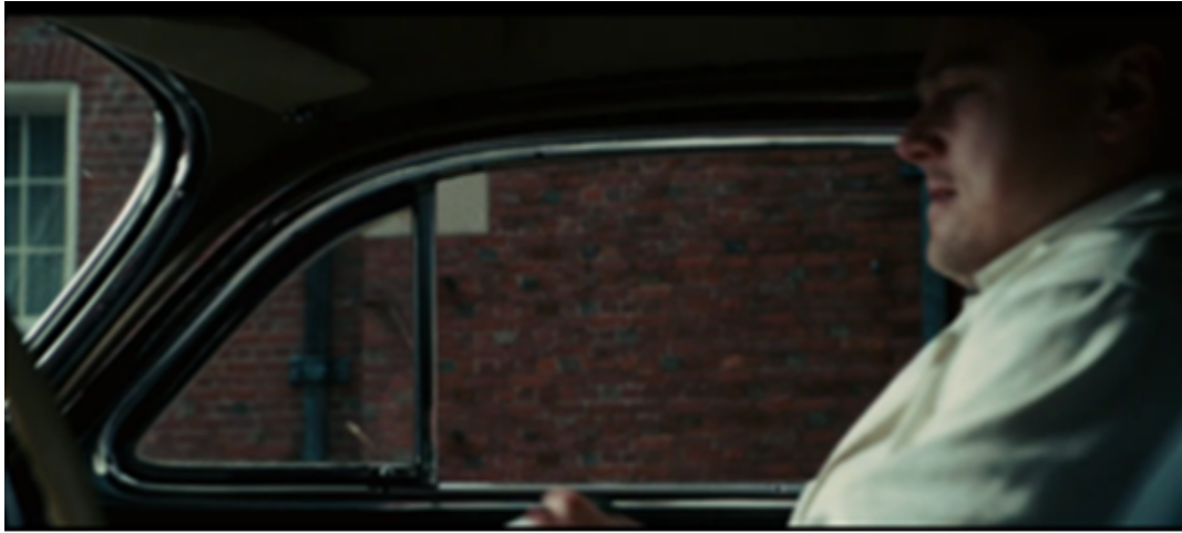
Illustration 20, extracted from Shutter Island , 01:40:54