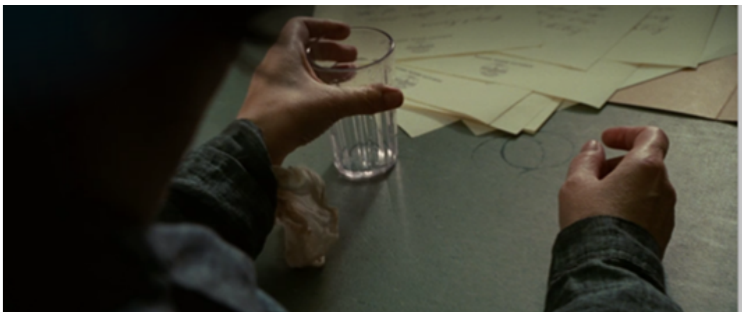
Illustration 10, extracted from Shutter Island , 00:37:28