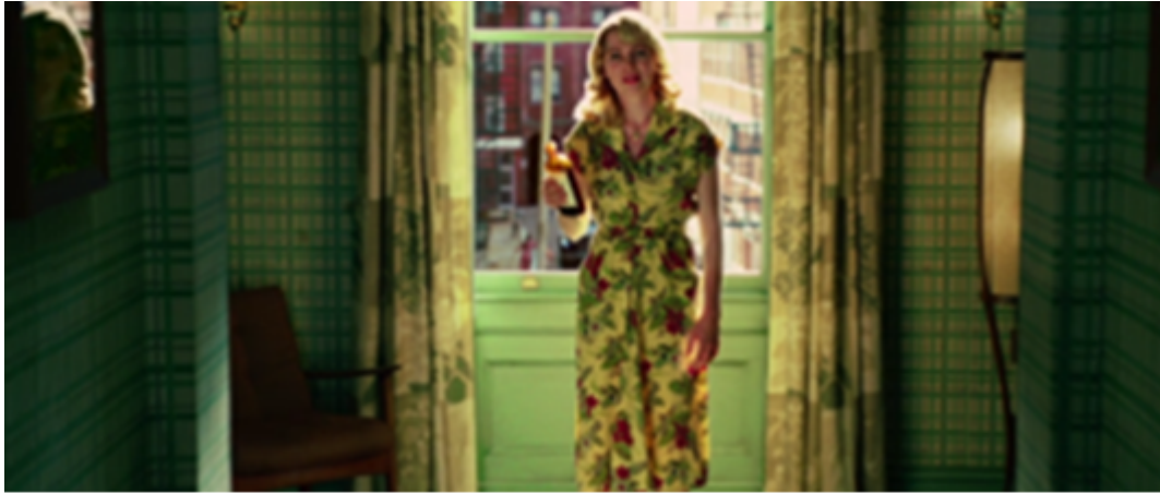
Illustration 18, extracted from Shutter Island , 00:27:41