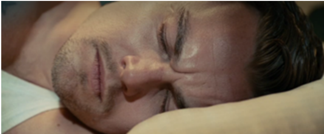
Illustration 16, extracted from Shutter Island , 00:27:34