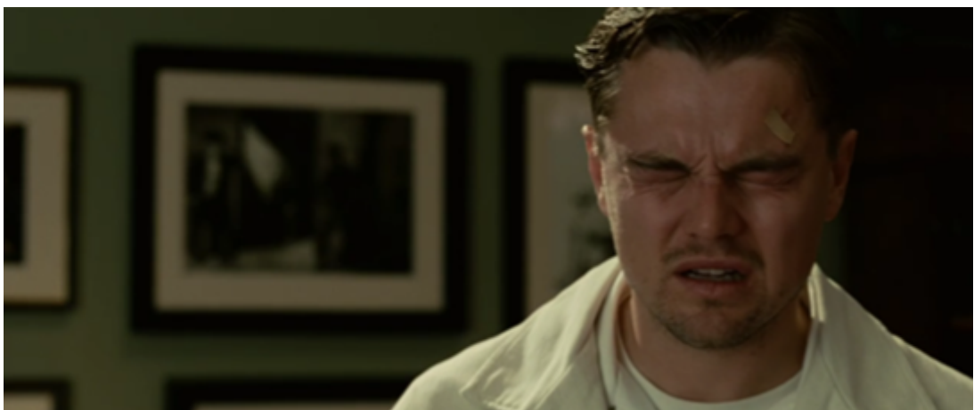
Illustration 3, extracted from Shutter Island , 00:55:47