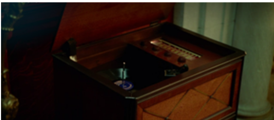
Illustration 17, extracted from Shutter Island , 00:27:35