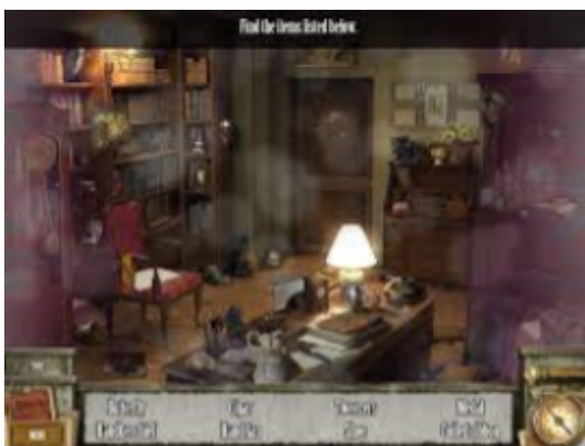
Illustration 25, extracted from Shutter Island, the Adventure Game