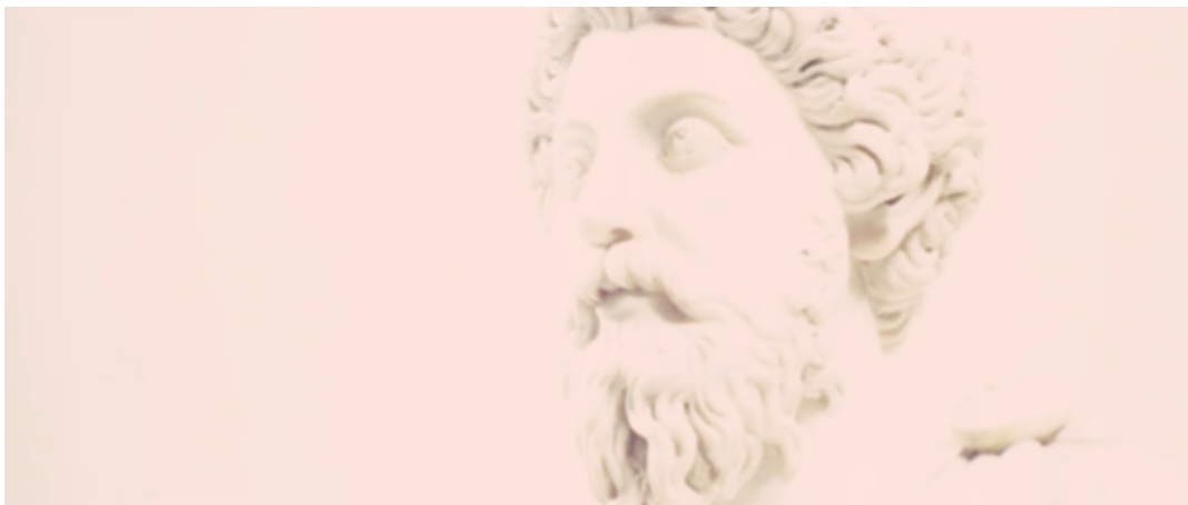
Illustration 2, extracted from Shutter Island , 00:55:46