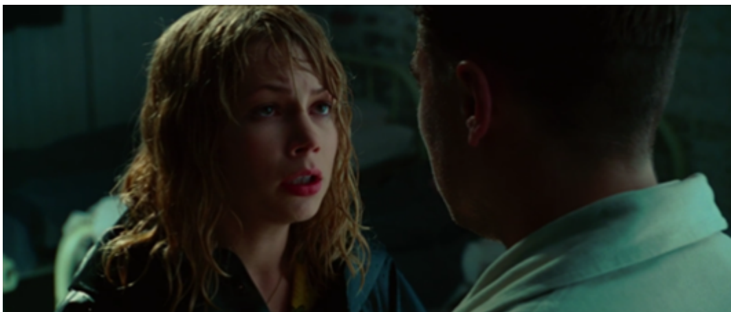
Illustration 13, extracted from Shutter Island , 1:03:23