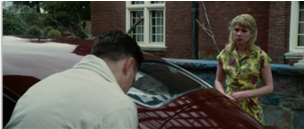
Illustration 21, extracted from Shutter Island , 01:41:08