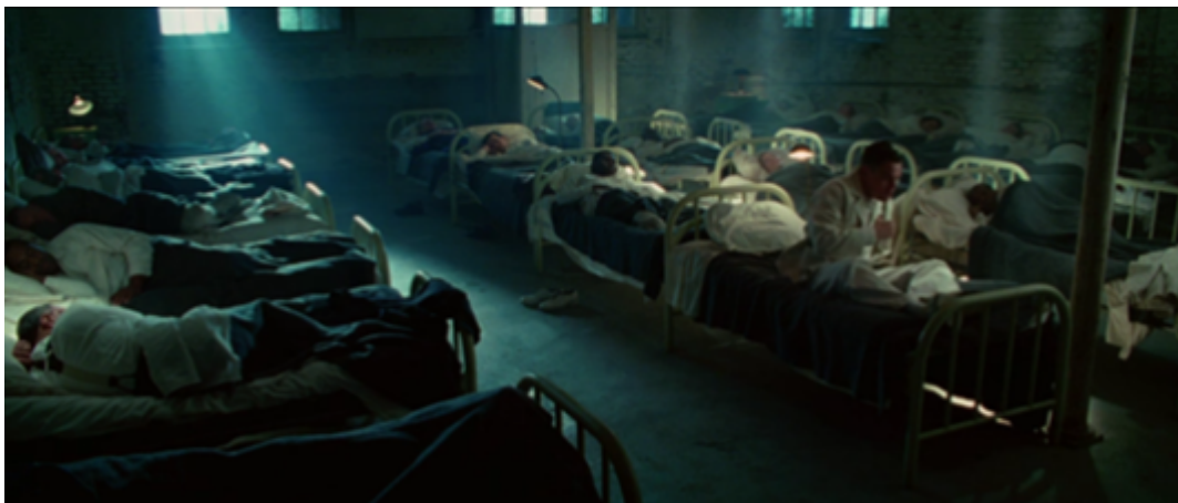
Illustration 12, extracted from Shutter Island , 1:02:28

do not make us as viewers understand that the scene is not real, only the context and the fact that we know about Andrew's past make us think that the vision is not real. For example, during the storm, Andrew wakes up in the dorm and sees Dolores coming in and talking to him. By preceding the scene of their discussion by a scene of awakening, the viewer almost thinks that Dolores is really here and that she is not just a memory (illustrations 12 and 13). His memories from Dachau also blend into his reality, much more than in the adapted text. Even though the text talks about Andrew's participation in the war, it is the film that focuses on his trauma. Scenes have been added to the book's story. In the film, there are many flashbacks of Dachau, of how Andrew found all the bodies dead, how he found the SS commander almost dead and let him suffer, and how he and the other American guards executed all the Nazis present at that moment. The audience experiences these flashbacks and hallucinations almost like any other scene of the film: the audience sees and hears his imagination and is then put straight into his head and point of view, as if all of this was real.