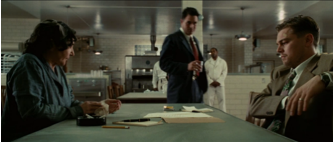
Illustration 8, extracted from Shutter Island , 00:37:21