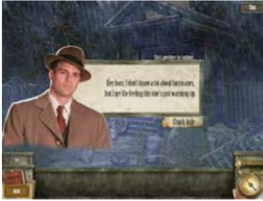
Illustration 26, extracted from Shutter Island, the Adventure Game

The game is composed of seven levels and twenty environments. In addition to these treasure hunts, there are also mini-games that make the player interact with the characters from the film or solve codes, etc. Along the game, the players discover that the goal is not only to find the clues and the missing patient, but also to escape the island. The game is faithful to the original plot and tries to follow it all along, some lines of the game are also directly taken from the novel or the film's text.