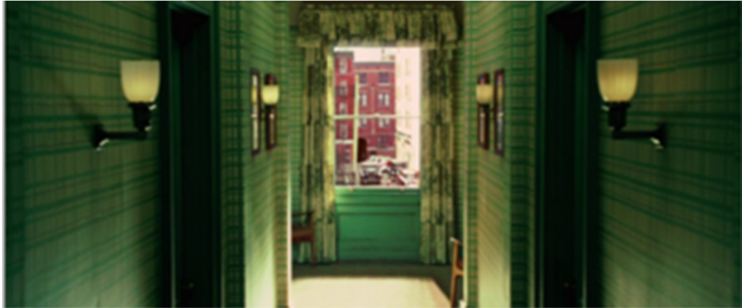
Illustration 15, extracted from Shutter Island , 00:27:31