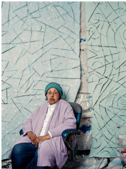
Figure 3 - Howardena Pindell

Howardena Pindell is an American artist, born in Philadelphia in 1943. She is also a curator, Professor, and critic: Pindell studied painting at Boston University and Yale, before working in the Department of Prints and Illustrated Books at the MoMA, then becoming a Professor at Stony Brook University, New York. On the whole, her work is regarded as abstract: