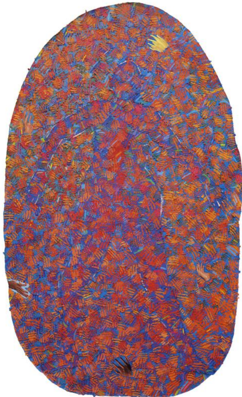
Figure 5 - Howardena Pindell, Autobiography: Fire, Suttee (1986–1987)

scratches from a fork, may find an explanation in Fire , in which images of human hands seem to find an echo in the stripes, as though distorting them into fingers. In Water , the scratches convey a feeling of entrapment, similar to the bars of a prison. This perhaps suggests the physical limits that Pindell faced after her head injury, as well as her powerlessness facing the limits of her memory.