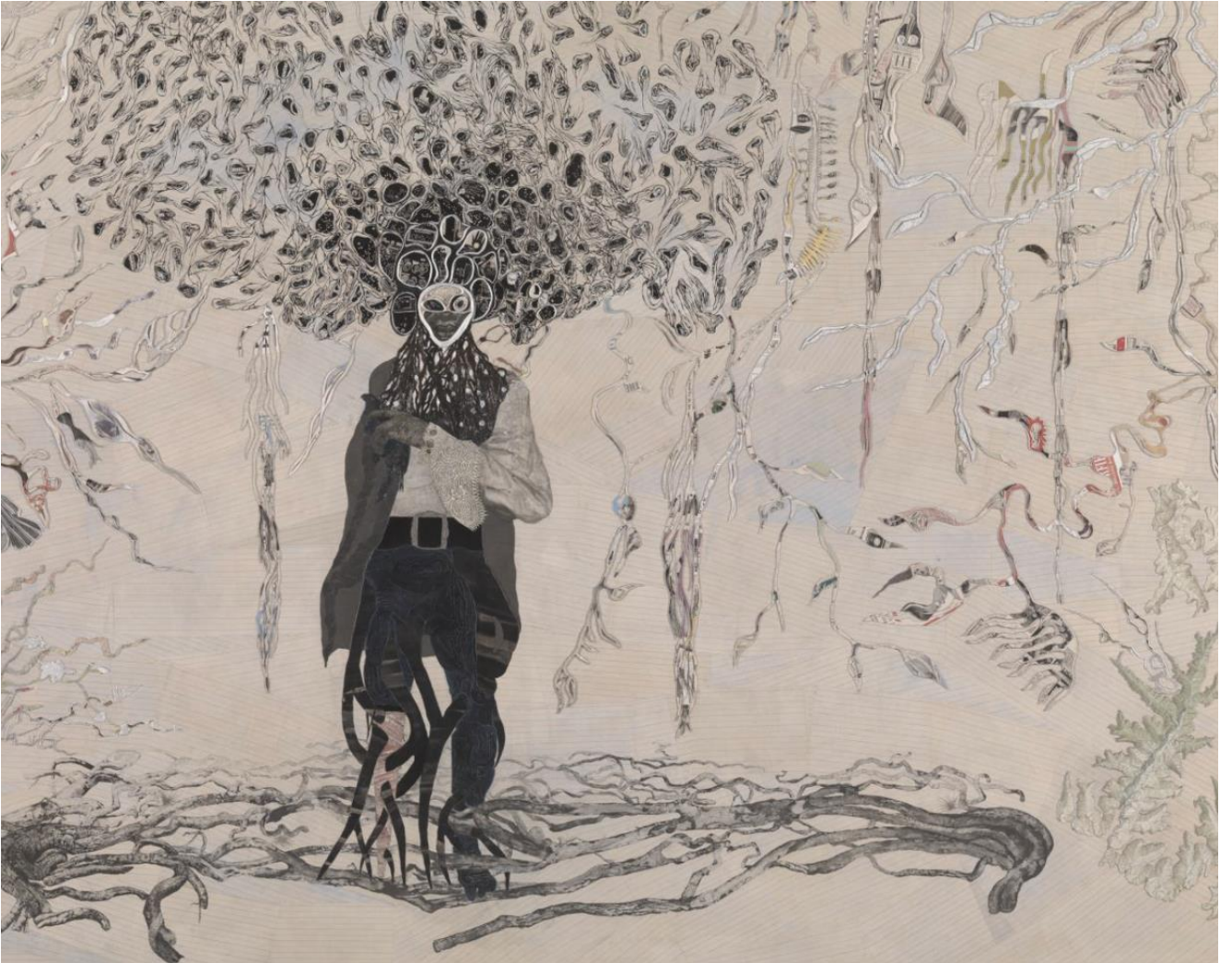
Figure 16 - Ellen Gallagher, Bird in Hand (2006)