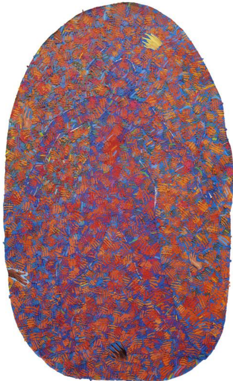
Figure 5 - Howardena Pindell, Autobiography: Fire, Sutte (1986–1987)

scratches from a fork, may find an explanation in Fire , in which images of human hands seem to find an echo in the stripes, as though distorting them into fingers. In Water , the scratches convey a feeling of entrapment, similar to the bars of a prison. This perhaps suggests the physical limits that Pindell faced after her head injury, as well as her powerlessness facing the limits of her memory.