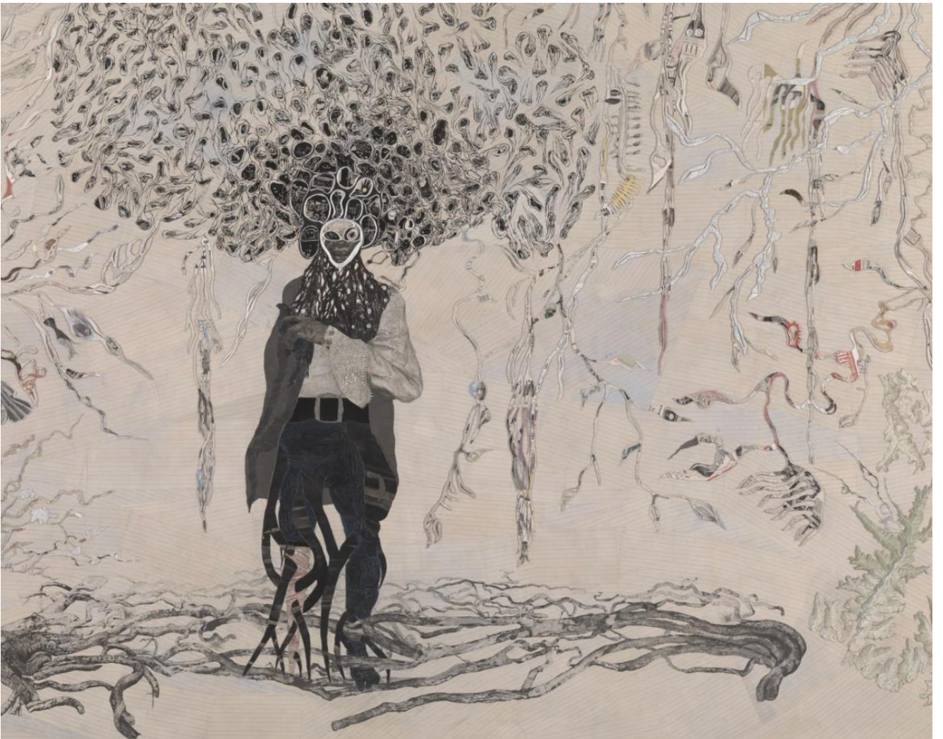
Figure 16 - Ellen Gallagher, Bird in Hand (2006)