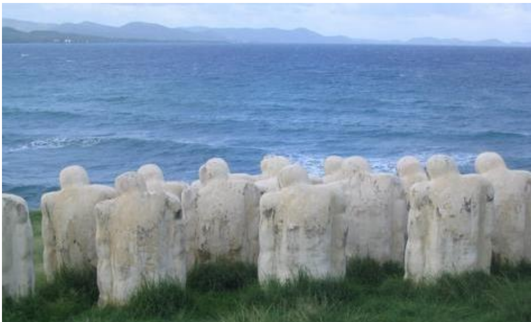
Figure 2 - Anse Caffard Memorial, Le Diamant, Martinique