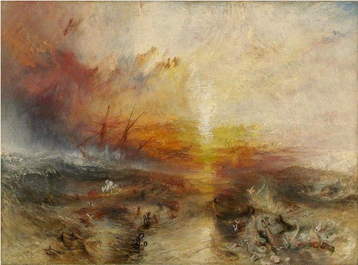
Figure 9 - J. M. W. Turner, The Slave Ship (1840)