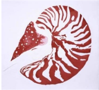
Figure 14 – Ellen Gallagher, Watery Ecstatic (2004)