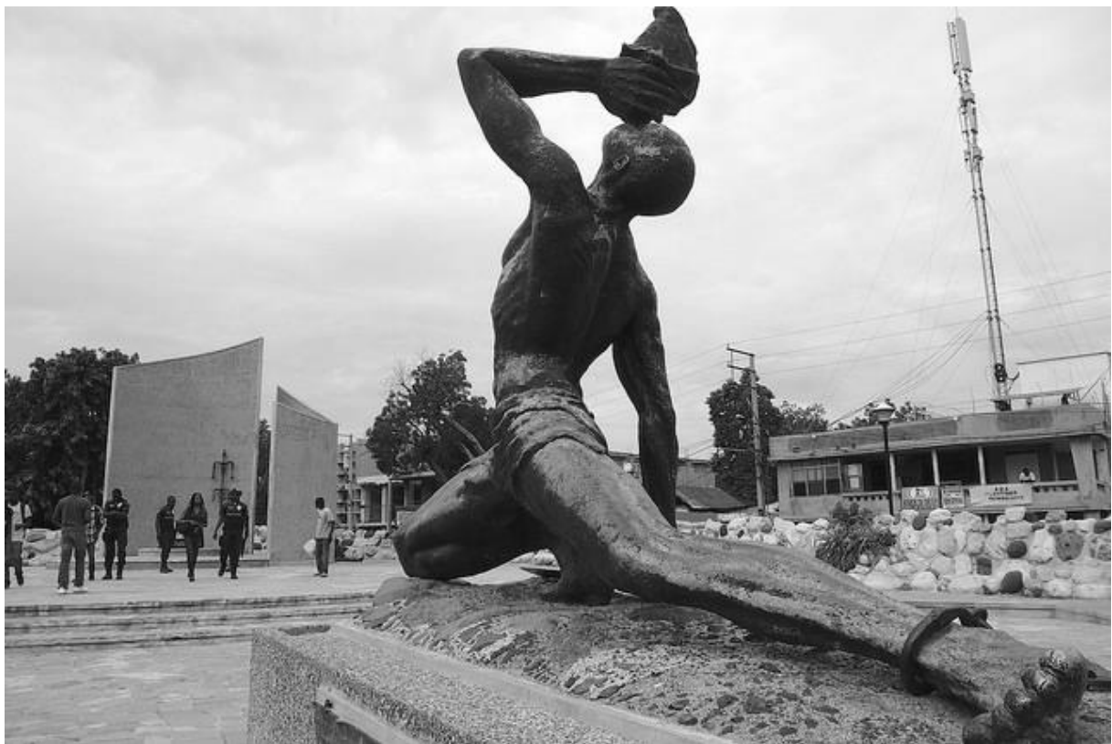
Figure 11 - The Unknown Maroon, Haiti