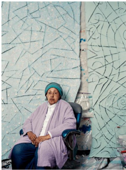
Figure 3 - Howardena Pindell

Howardena Pindell is an American artist, born in Philadelphia in 1943. She is also a curator, Professor, and critic: Pindell studied painting at Boston University and Yale, before working in the Department of Prints and Illustrated Books at the MoMA, then becoming a Professor at Stony Brook University, New York. On the whole, her work is regarded as abstract: