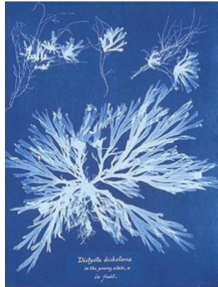
Figure 12 - Anna Atkins, Cyanotype Impressions (1843)