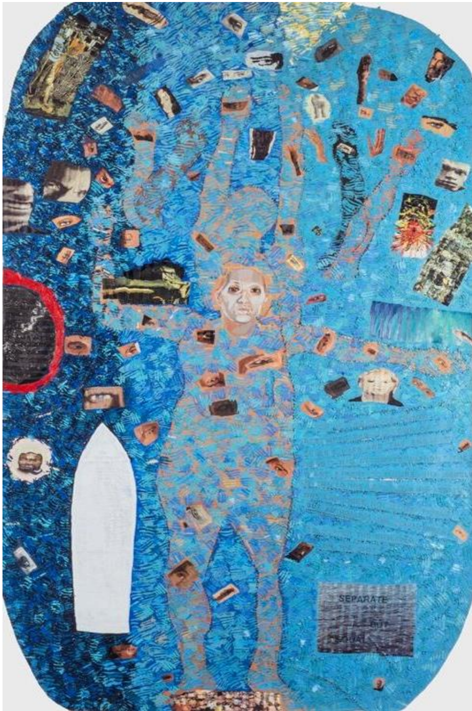
Figure 6 - Howardena Pindell, Autobiography: Water/Ancestors/Middle Passage/Family Ghosts (1988)