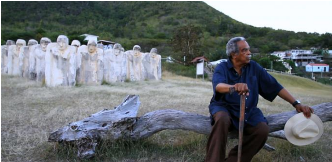
Figure 1 - Édouard Glissant at the Anse Caffard Memorial