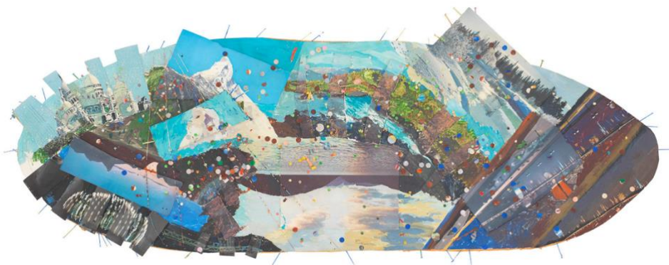
Figure 4 - Howardena Pindell, Autobiography: Oval Memory (1980-1981)

In 2019, the exhibit Howardena Pindell: Autobiography at the Garth Greenan Gallery singled out a singular series from Pindell's body of work. Covering pieces from the 1980s up until 1995, the exhibition displayed the artist's Autobiography series, spreading from very abstract pieces to more figurative ones, whose only common point is the recurrent resort to an oval-shaped framing. In fact, the series was sparked by a car accident which nearly killed the artist in 1979, and led to a partial amnesia. As a result, Pindell moved towards more personal