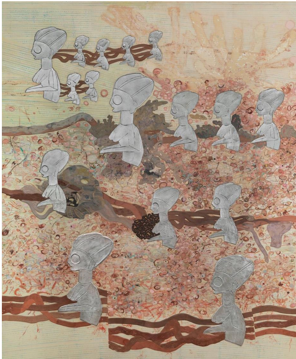
Figure 7 - Ellen Gallagher, Ecstatic Draught of Fishes (2020)

deceptive peacefulness of the islands 75 , and beneath the “turquoise dress” of the sea 76 , hides a deadly history. Nichols warns her readers against the “Palm-Tree Seductions”: “No need to know that sea / does not always keep up / this front of blue serenity” (135).