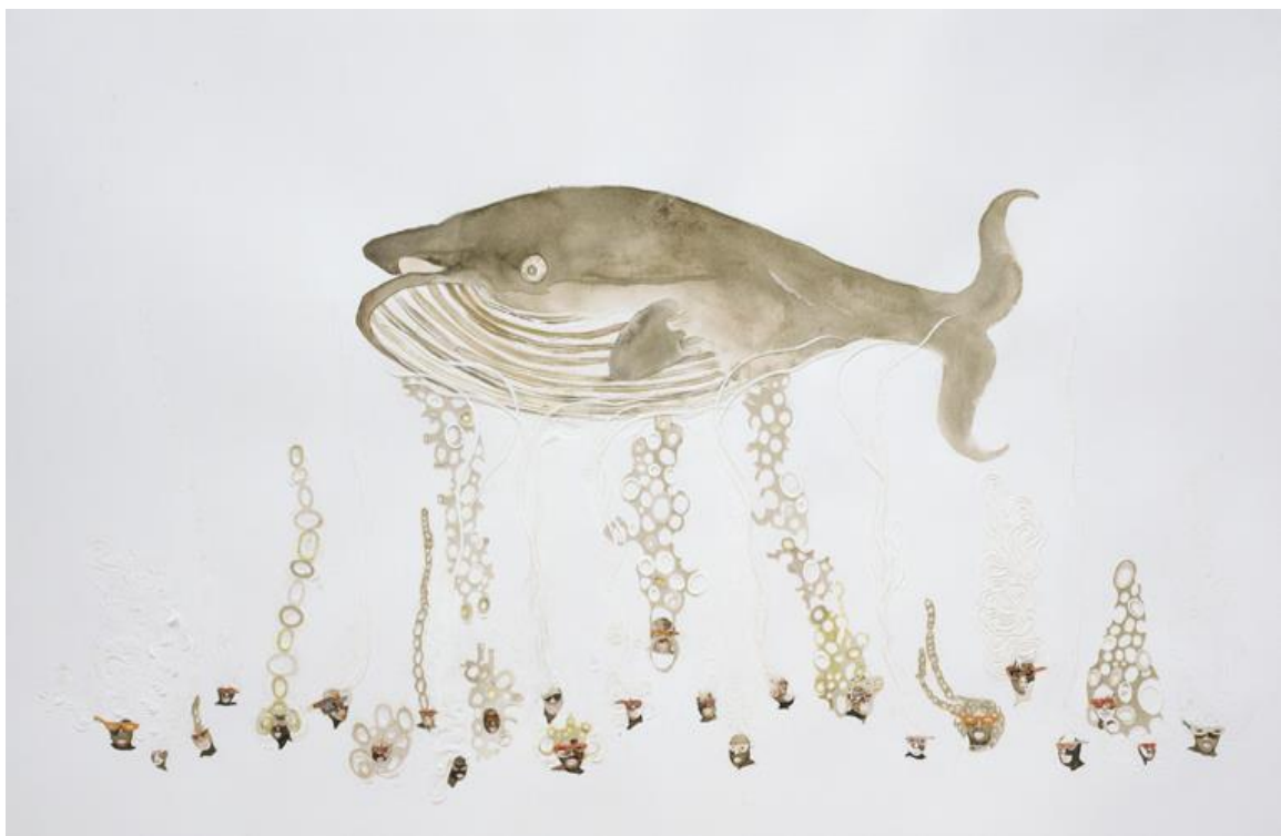
Figure 15 - Ellen Gallagher, Watery Ecstatic (2004)