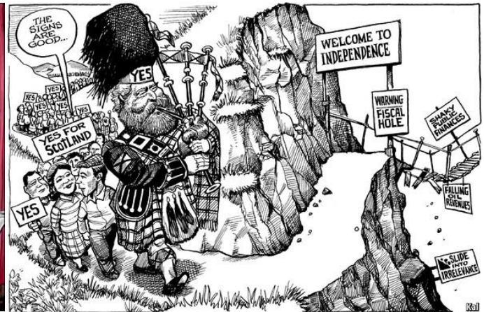
KAL's cartoon in The Economist