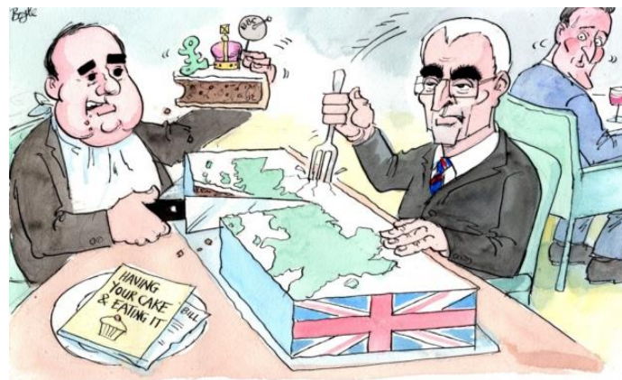
Frank Boyle's cartoon in Edinburgh News

Ces caricatures seront distribuées aux élèves qui travailleront en binômes. En effet, chaque binôme devra prendre des notes sur une des trois caricatures à partir de consignes simples : « Describe, explain, find the message ». Après un moment de réflexion, les caricatures seront projetées au tableau et les élèves pourront alors mettre en commun leurs idées lors d'une Expression Orale en Interaction. Une trace écrite commune sera donc réalisée : les élèves présenteront les documents puis en feront la description ainsi qu'un début d'analyse. Des mots comme « caricature, cartoon, Scotland, separate, England, Queen, currency, BBC, independence, vote, criticizing » seront attendus. Ces documents