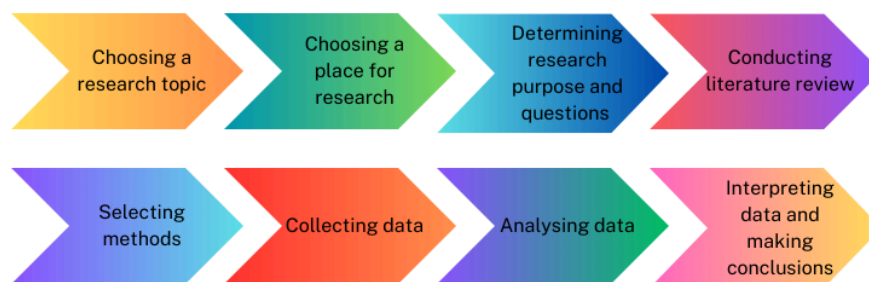
Figure 1. Study overview

The framework of research was developed including following steps (Figure 1):