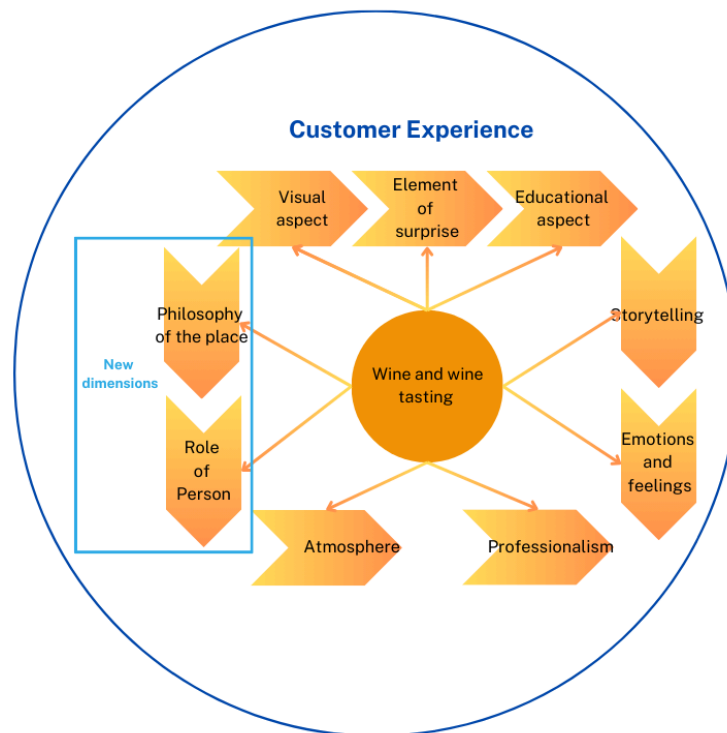
Figure 3. Dimensions of CX in wine tourism

According to the obtained results numerous dimensions contribute to the overall CX in wine tourism (Figure 3). This phenomena can be depicted in the following way: