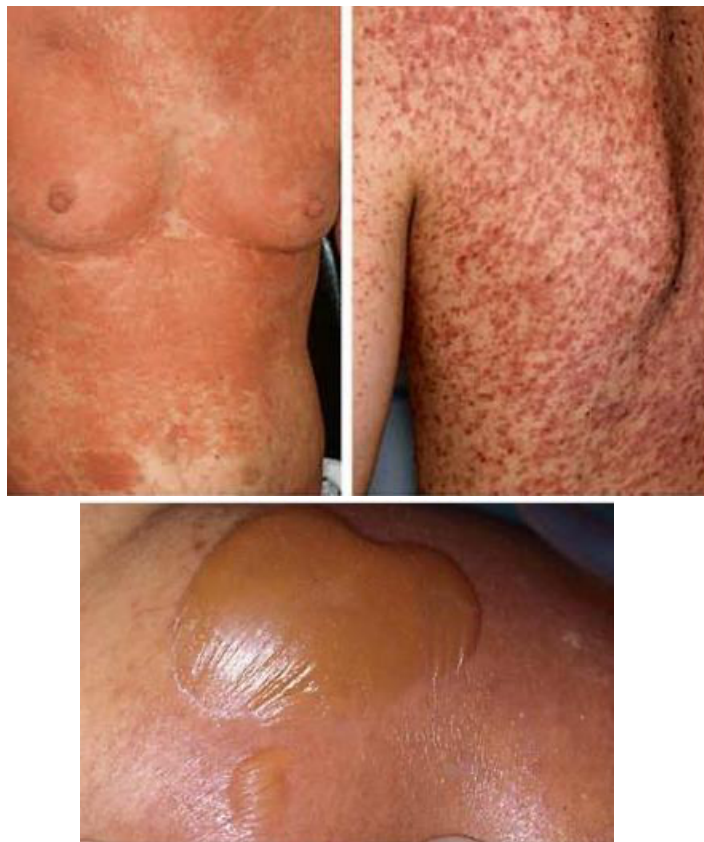
Figure 1 – examples of acute cutaneous GvHD lesions.

The 3 main organs involved in acute GvHD are the skin (81%), the liver (50%) and the digestive system (54%). Based on Glucksberg's classification, acute GvHD is clinically graded from I (mild) to IV (very severe) according to the extent and severity of damage to these 3 organs (3,14).