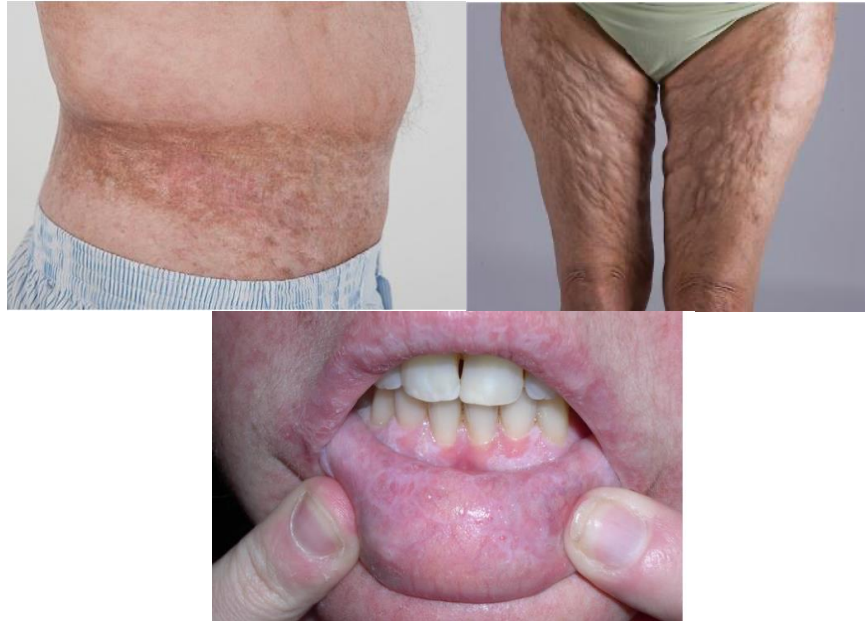
Figure 1 – examples of chronic cutaneous and buccal GvHD lesions.

The definitive diagnosis of chronic GvHD requires the exclusion of other possible diagnoses such as infection, drug effects, malignancy and residual post-inflammatory damage and scarring.