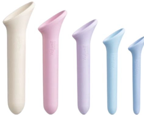
Figure 3 – example of vaginal dilators

To prevent their formation, it is recommended to continue having sexual intercourse. If this is not possible, the regular use of vaginal dilators, more or less induced by creams containing hyaluronic acid, estrogens, corticosteroids or immunosuppressants, can help maintain vaginal capacity (18,20,21,26).