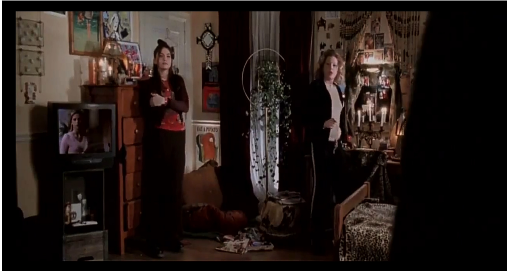
Figure 9: Sarah and Molly watching Scream 2 in Halloween H20: Twenty Years Later (Miner, 1998, 00:48:08)

They are watching the movie Scream 2 (Craven, 1997), as we can see on the TV on the left-hand side of the shot. The Scream franchise renewed the audience's interest for the slasher genre in the nineties. It criticized the stereotypical slasher conventions related to gender 37 while redefining new conventions of the genre during a time of third-wave feminism. It created a new, stronger version of the Final Girl embodied by Sidney Prescott (Neve Campbell). Halloween H20: Twenty Years Later follows in Scream's steps in terms of remaking the genre. This film is more feminist because film-making at this time had been affected by feminist film criticism, Carol Clover's work for example, and the popularization of gender studies. 38 Hence the creation of this improved, albeit imperfect, slasher movie that takes previous gender issues into consideration.