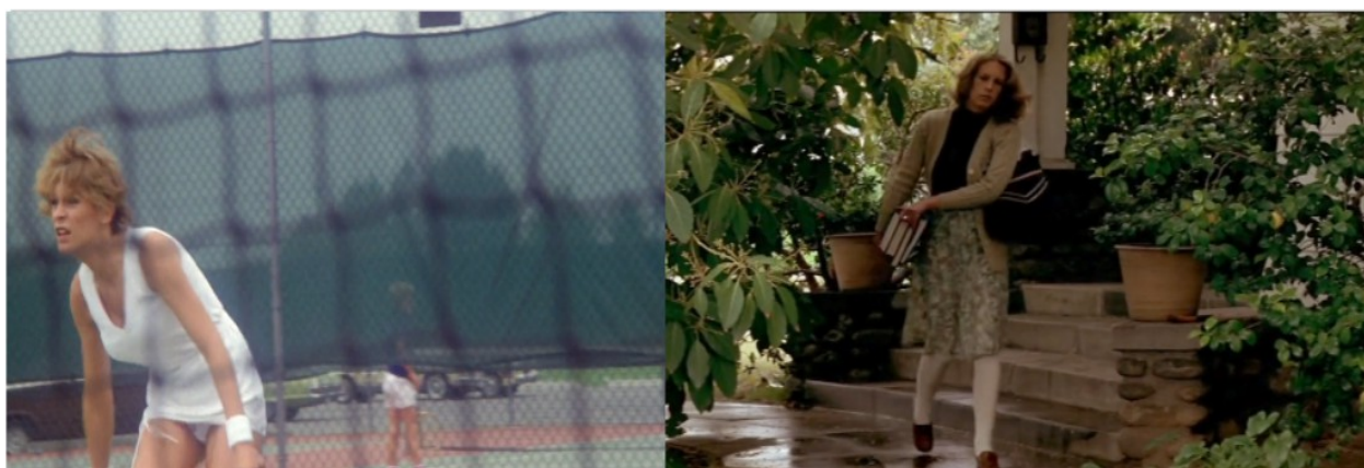
Figure 42: Kim in Prom Night (Lynch, 1980, 00:35:33) compared to Laurie in Halloween (Carpenter, 1978, 00:25:56)

Since Kim does not have a defined purpose in the movie, it is clear that her body and beauty are at the center of her role.