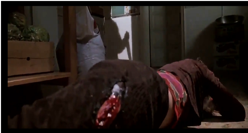
Figure 5: Sarah crawling on the floor in Halloween H20: Twenty Years Later (Miner,1998, 01:00:50)

tortured on screen more than the men, there is no sense that they are punished for their sexuality anymore. However, the way in which Sarah dies suggests that there remains a certain inequality between men and women.