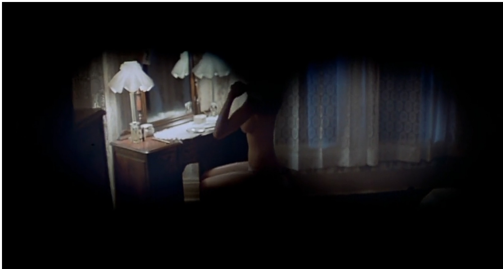
Figure 23: Looking at Judith Myers through Michael's mask in Halloween (Carpenter, 1978, 00:05:36)

within the diegesis”. 47 The display of the female characters is a way for the audience to feel as though they are the ones observing them in their vulnerable moments, especially naked, and that they are about to overpower them.