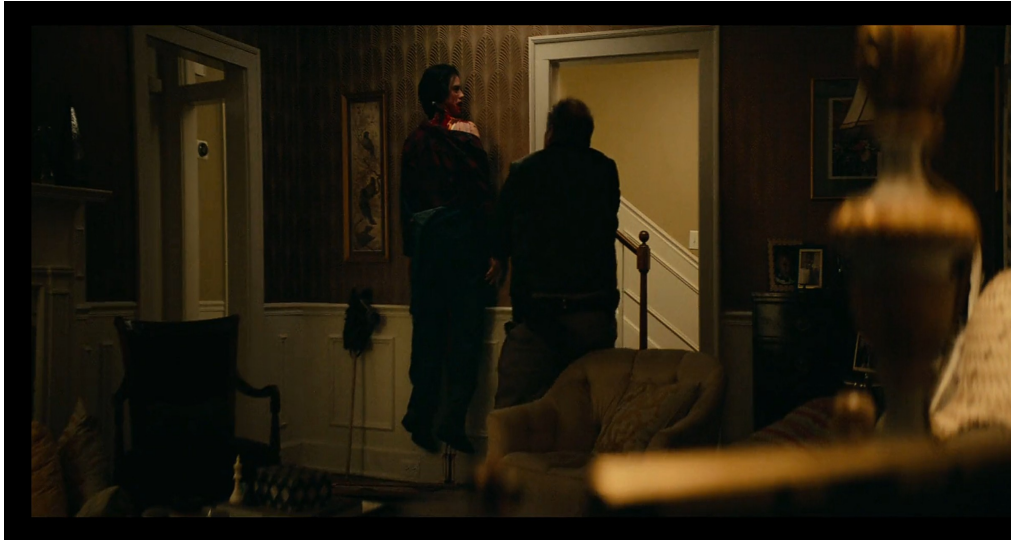
Figure 16: Dave is pinned to a wall in Halloween (Green, 2018, 01:02:43)

Moreover, Vicky (Virginia Gardner), Allyson's friend, does not receive any help from her boyfriend when she gets killed. Since he did not help her, he is killed too.