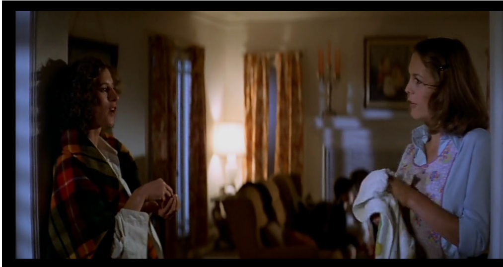
Figure 26: Annie leaving Lindsey with Laurie in order to go meet her boyfriend (Halloween, Carpenter, 1978, 00:51:55)

Moreover, Laurie is the voice of reason. She reassures Tommy when he is scared by telling him that the boogeyman does not exist. In this sense, she is already taking on the role of a mother. While her friends are out with their boyfriends, she has to take care of Tommy and Lindsey.