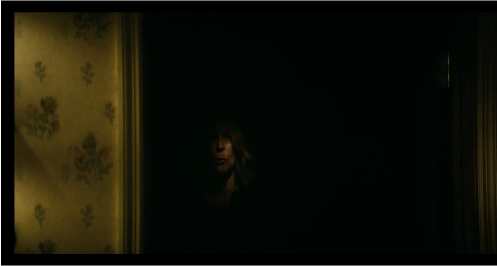
Figure 34: Laurie could be mistaken for Michael in Halloween (Green, 2018, 01:37:22)

In addition, in this shot, Laurie is at the center in a chiaroscuro.[01:37:22] Only her face is visible in the darkness. She seems to be lurking in the dark. This type of shot is also usually used for Michael. Laurie changes her role as she starts actively chasing Michael. They are now both hunters. She even breaks into her daughter's house who is scared because she thinks it might be Michael.[00:42:44] Michael and her are more similar in this movie than they have ever been. She is not a passive grandmother as she is as violent and scary as Michael himself.