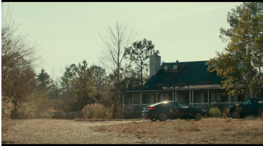
Figure 39: Laurie's house in Halloween (Green, 2018, 00:10:50)

previous movie, her asylum was the school, in this one it is her house.