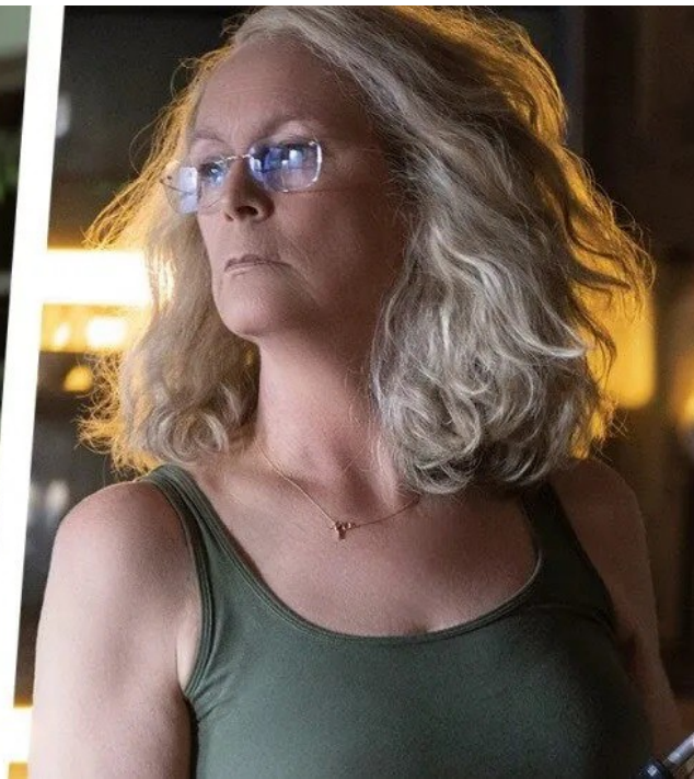
Halloween , David Gordon Green, 2018