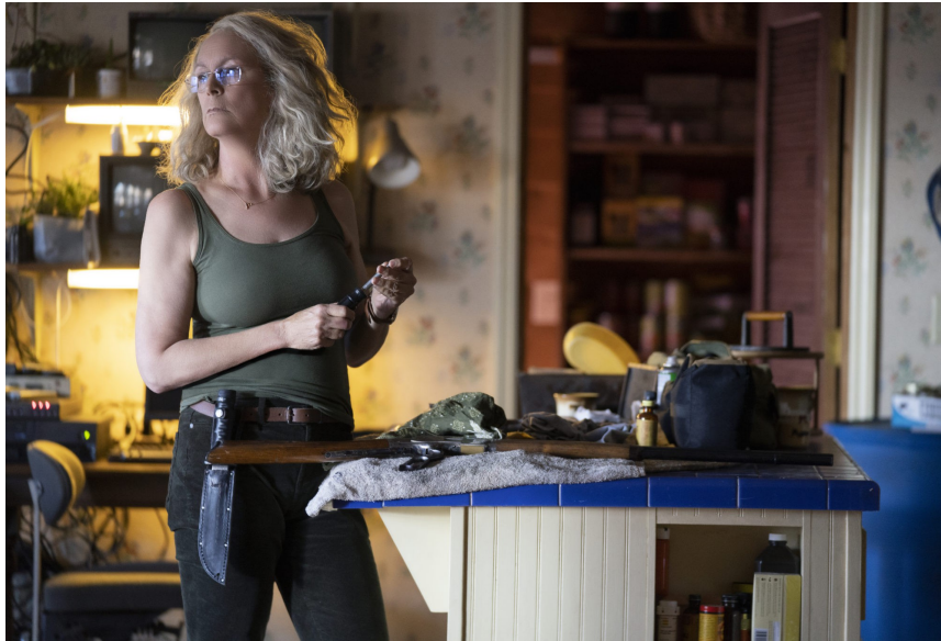
Figure 45: Laurie in Halloween (Green, 2018, 00:21:00)

In this shot, [00:21:00] Laurie is not wearing clothes that older women are often told they should be wearing. She does not cover herself, she is in a tank top that shows her arms. Women her age are often expected to cover up or wear a lot of makeup. Laurie does not. Moreover, the lighting is striking because it emphasizes the image of a Laurie who does not hide herself. The lighting does not try to hide her body, it helps Laurie to proudly show it and therefore does not vilify her aging body in the way that a dark environment would.