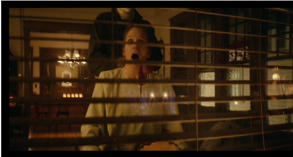
Figure 13: A woman killed in her house in Halloween (Green, 2018, 00:48:22)

two reporters in quite a violent way.[00:40:10] He also chooses a random house and enters it to kill the woman who lives in it.