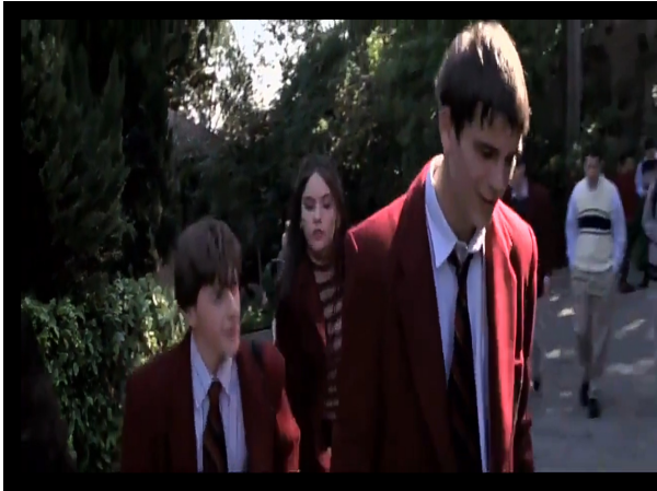
Figure 11: John walking with his friends in Halloween H20: Twenty Years Later (Miner, 1998, 00:17:35)

Girl has a group of friends 39 who become the victims of the killer, which does not apply to Laurie in this movie. However, it fits her son John.