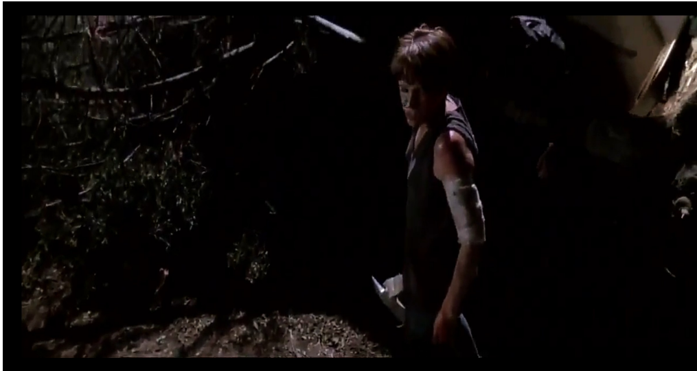
Figure 8: Laurie has decapitated Michael (Halloween H20: Twenty Years Later, Miner,1998, 01:20:29)

This medium shot from the end of the movie is particularly striking. Laurie is standing in the center. She is holding an axe. Behind her is the car that she has driven off a cliff. She is looking at Michael's head which is off-screen, because she has just decapitated him. She has a expression of rage on her face. From the crashed car to the axe and the decapitation, this shot includes many elements that portray Laurie's extreme violence in this movie. Interestingly, Halloween ended with a shot of Laurie sat on the ground crying followed by a shot of Dr. Loomis. Here, the movie ends on this exact shot of Laurie in one of her most violent and strongest moments.