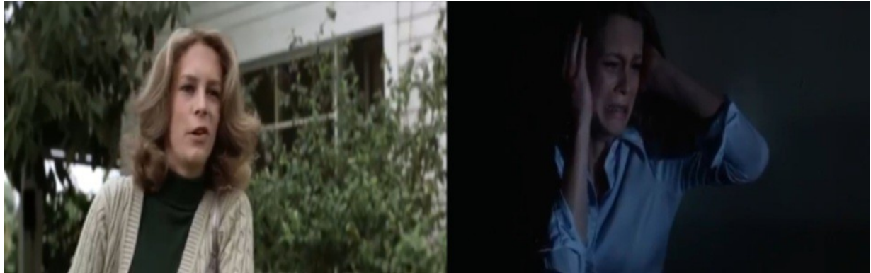
Figure 36: Laurie in the morning (00:26:11) then at night in Halloween (Carpenter, 1978, 01:27:10)

While these movies both portray main characters who are treated as crazy, they also both use lighting to underline their growing madness. The medium of light is used in cinema to provide information about what is happening in the scene. 71 Indeed, in horror movies, light usually represents hope, while darkness represents evil and madness. The scenes that are intended to be scary will therefore usually take place in a darker setting. Halloween takes place over a single day. As it begins in the morning and ends during the night, it is a perfect portrayal of Laurie's mental state.