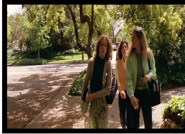
Figure 10: Laurie walking with her friends in Halloween (Carpenter, 1978, 00:20:42)

This shot of John walking with two friends mirrors perfectly the shot of Laurie doing the same in Halloween . Moreover, he is the same age as she was. While Laurie's friends were teasing her for not having a boyfriend, John's friends are teasing him for having an overprotective mother. He encounters the killer multiple times but never fights him to the point of killing him. He survives but in the end, he is saved by Laurie who becomes the hero. In Halloween , Dr. Loomis was the one to appear and save Laurie. Here, the woman becomes the savior and the young man becomes the last survivor. The gender stereotypes have switched. John is the actual “Final Girl” of this movie, not Laurie.