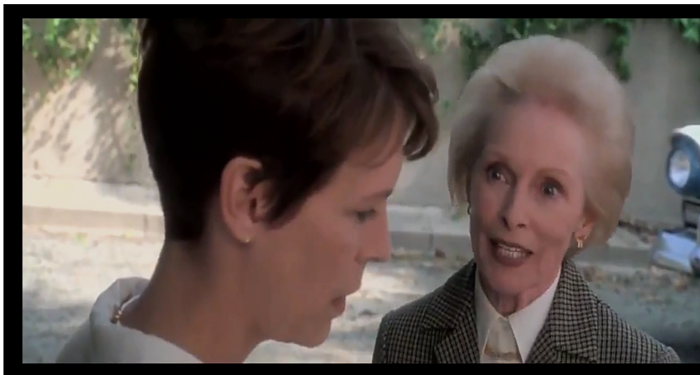
Figure 30: Laurie mirroring her secretary in Halloween H20: Twenty Years Later (Miner, 1998, 00:41:28)

However, although Laurie is portrayed as a good mother for sacrificing everything for her child, her abilities as a mother are still somewhat questioned. Laurie is an alcoholic, which is shown several times in the movie. Her son himself mentions it and tells her: “mom I am not responsible for you”[00:31:58] In this scene, the roles are reversed. He is lecturing her for making a mistake. Him not being “responsible” for her reflects that he is the parent here, which he should not be. Moreover, she is overprotective of John. He repeatedly tells her that he has no freedom but she does not give him any which leads to multiple arguments. Women's legitimacy as single mothers is often questioned 62 and in this movie, Laurie's aim is to prove her worth as such.