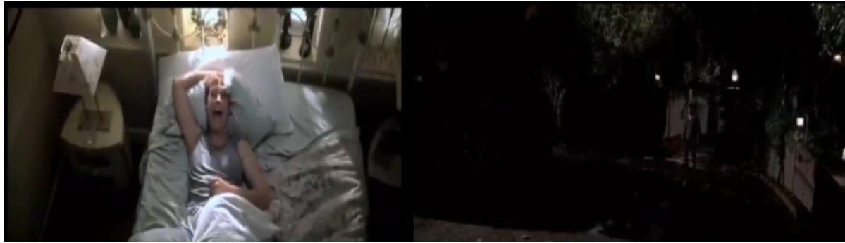
Figure 38: Laurie in the morning (00:14:12) then at night in Halloween H20: Twenty Years Later (Miner, 1998, 01:09:28)