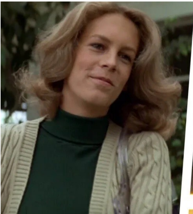
Halloween , John Carpenter, 1978