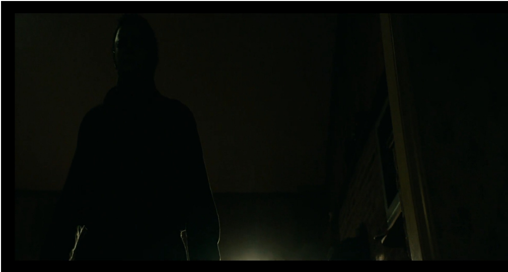
Figure 19: The Shape in the darkness in Halloween (Green, 2018, 01:27:26)

This low angle shot of Michael standing in the dark perpetuates his role as the “shape”.[01:27:26] His features are barely visible. He is dehumanized, even by the characters who call him “this thing” or “it”. However, in other shots, his face without the mask is slightly visible. This had not been done a lot before as it reminds the audience that he is in fact, human. Therefore, Michael oscillates between a faceless monster and a human. The constant shift between the two faces is very powerful. Indeed, he is capable of such terrible violence that we want to believe that he is not real, but he is in fact a human being like the rest of us.