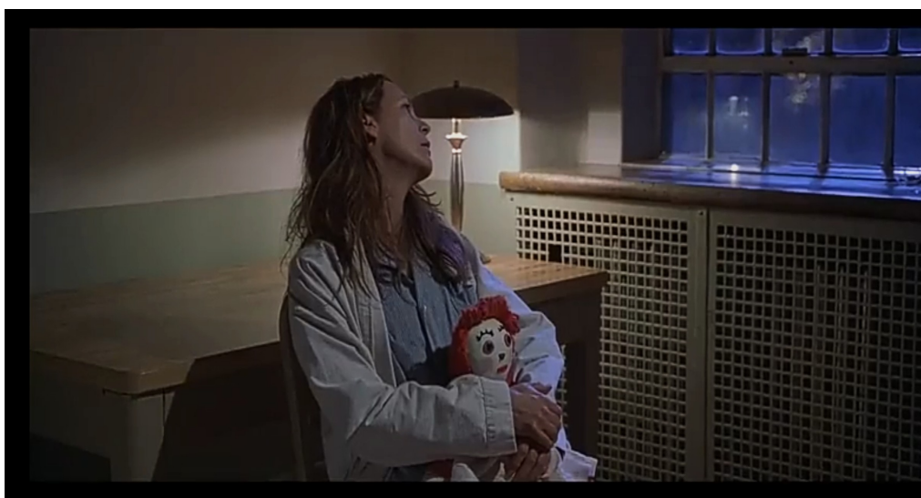
Figure 31: Laurie is in a mental hospital in Halloween: Resurrection (Rosenthal, 2002, 00:41:28)

Unfortunately, in Halloween: Resurrection , Laurie's portrayal implies that she did become mentally unstable. She was placed in a mental hospital alone.