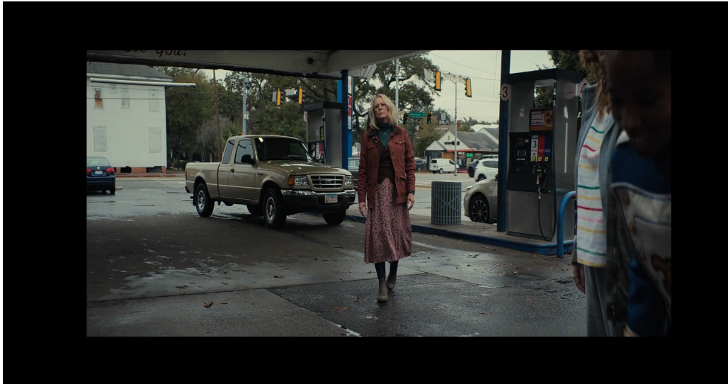
Figure 35: Laurie wearing modest clothes in Halloween Ends (Green, 2022, 00:20:35)

In this long shot, Laurie is wearing an outfit that is much more modest than in the previous movies [00:20:35]. She is wearing a long shirt with tights, boots, a turtle neck and a jacket. She is completely covered. Although her appearance still seems to encourage a natural aging for women, her outfit fits stereotypical images of elderly women having to hide their bodies. Moreover, her hobbies are now knitting and cooking which are very cliché activities for women her age to do. The change in her appearance may be due to the loss of her daughter in the previous movie and the disappearance of Michael. Since she has an opportunity to live an ordinary life, she is trying to conform to the stereotypical role of the grandmother. Especially now that she has lost her daughter, all she has left is her role as a grandmother. Therefore, she is trying to be the perfect grandmother to Allyson. She does not mention her mental trauma or her alcoholism anymore. As a matter of fact, her personality has not changed too much as she is still the same strong hunter as in the previous movies when Allyson is not present. However, for Allyson, she has molded her appearance to look like the representation of the “perfect” grandmother according to society's standards.