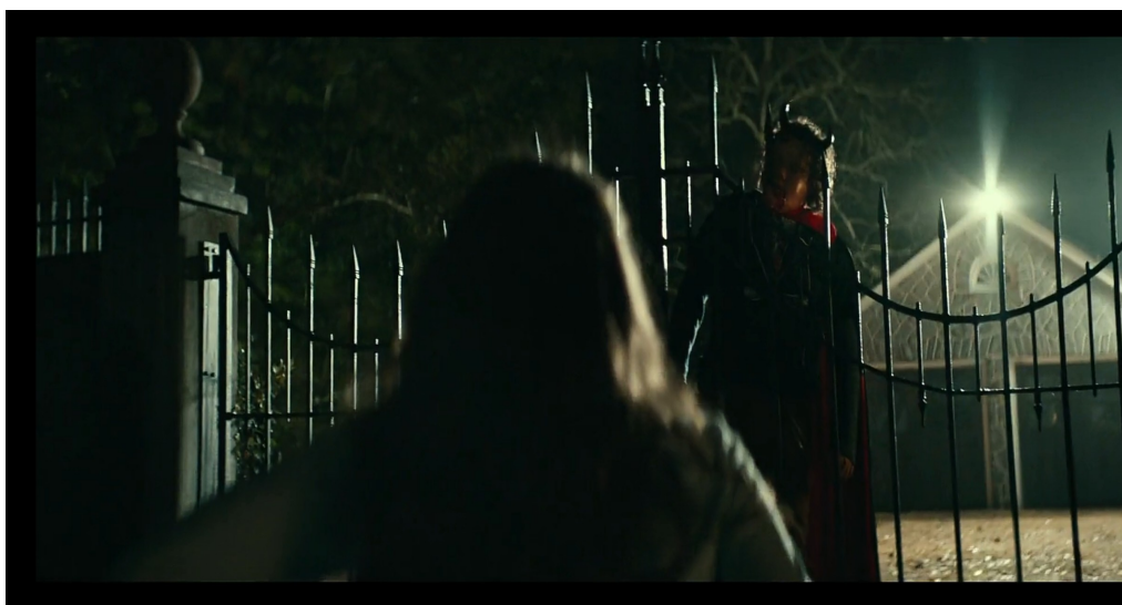
Figure 15: Oscar is impaled on a gate in Halloween (Green, 2018, 01:11:27)

It is therefore interesting to understand the meaning behind these men's deaths. One of these men is Oscar (Drew Scheid), Allyson's friend.