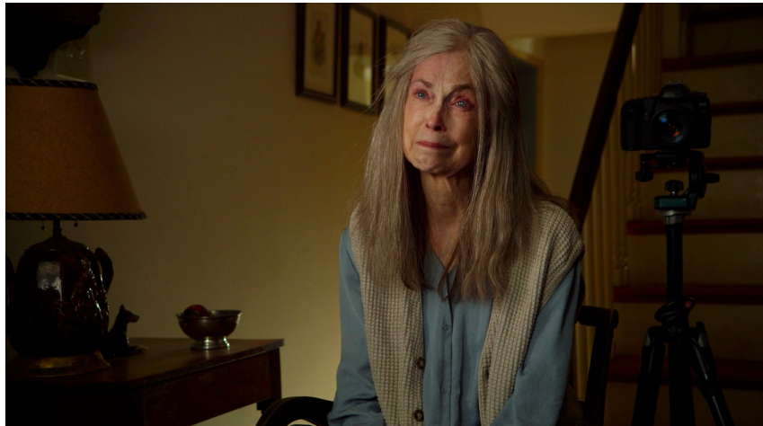
Figure 46: Nana in The Visit (Shyamalan, 2015, 01:01:31)

In this shot, [00:21:00] Laurie is not wearing clothes that older women are often told they should be wearing. She does not cover herself, she is in a tank top that shows her arms. Women her age are often expected to cover up or wear a lot of makeup. Laurie does not. Moreover, the lighting is striking because it emphasizes the image of a Laurie who does not hide herself. The lighting does not try to hide her body, it helps Laurie to proudly show it and therefore does not vilify her aging body in the way that a dark environment would.