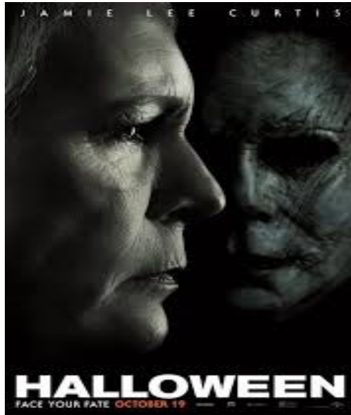
Figure 33: Poster of the movie Halloween (Green, 2018)

Laurie and Michael are in the center of this image. The right side of Laurie's face is visible while Michael's left side is visible. They are the two sides of the same face. This reveals that they share a very similar role in the movie. Moreover, Laurie's wrinkles mirror the marks on Michael's mask. The wrinkles are assimilated to scars. They are the marks of time as well as the marks of what happened to her. The marks on Michael's mask indicate the same things. They have both aged together and have fought each other, therefore they have now grown into two very similar people. This idea is displayed several times in the movie through some of the shots in which Laurie appears.