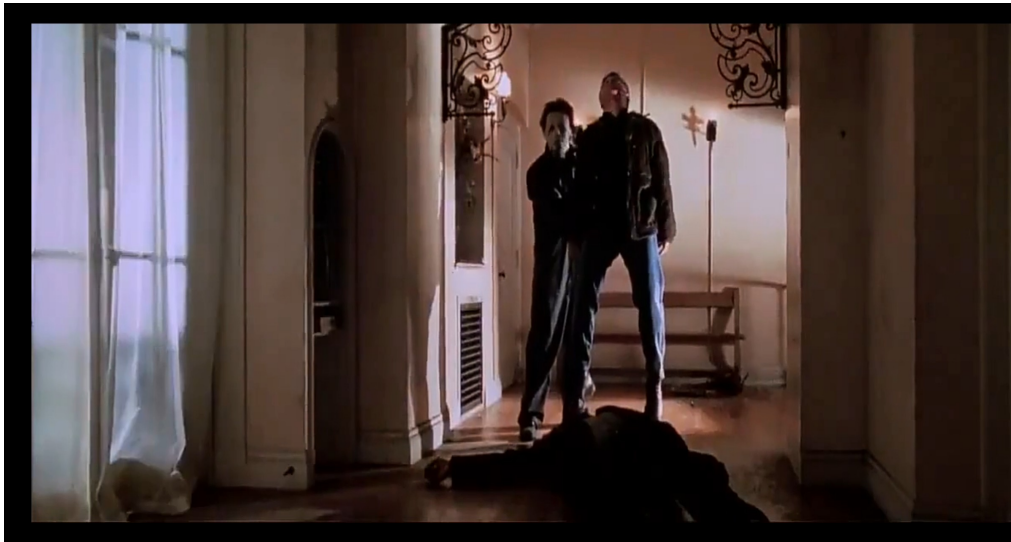
Figure 7: Michael displaying Will's body in front of Laurie in Halloween H20: Twenty Years Later (Miner;1998, 01:06:46)

The most important change is that of the Final Girl. Laurie takes matters into her own hands. She is the one who takes the lead and she does not need to be rescued. It is indicated in the beginning that Dr. Loomis is dead. This clearly states that there will be nobody to take her place as the hero. Will's death also confirms this idea.