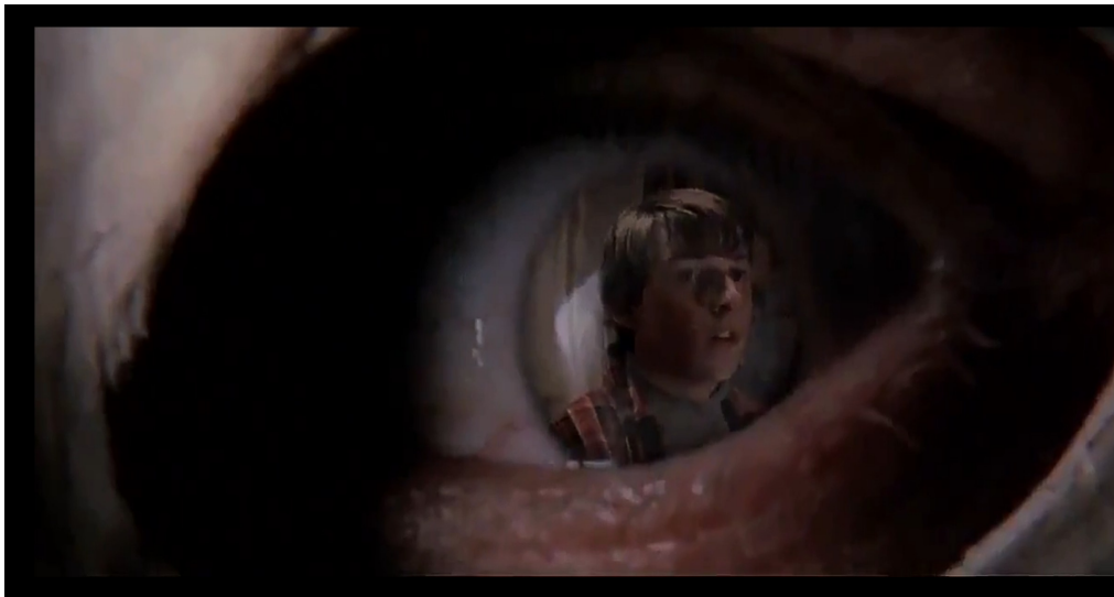
Figure 6: Charlie's reflection in Michael's eye in Halloween H20: Twenty Years Later (Miner, 1998, 00:58:17)