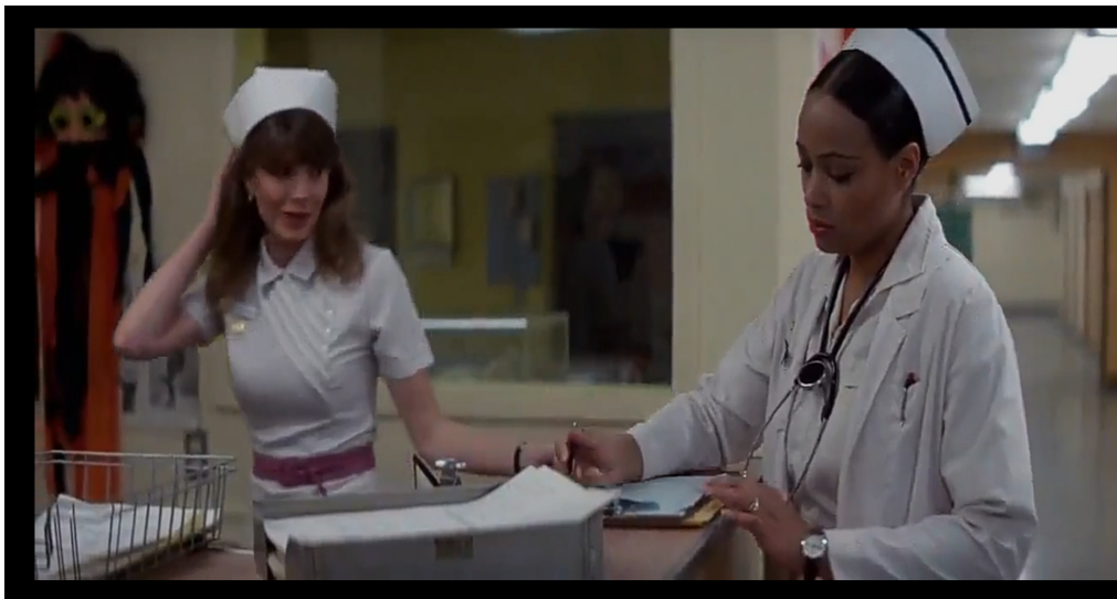
Figure 24: Nurse Alvez reprimanding Nurse Karen in Halloween II (Rosenthal, 1981, 00:31:51)

Consequently, women are frequently divided into two stereotypical categories: the “virgin” and the “whore”, or the “good girl” and the “bad girl”. 50 This dichotomy offers the vision that a female's sexuality is what defines them. The “virgin” expresses her sexuality within marriage and “women who fail to embody this ideal are 'whores’”. 51 These two stereotypes are at the core of slasher movies. As Linda Williams explained, “teen horror films kill off the sexually active 'bad' girls, allowing only the non-sexual 'good' girls to survive”. 52 The difference between the “good girl” and the young women as “bad girls” is very apparent in Halloween II with Nurse Alvez and Nurse Karen.