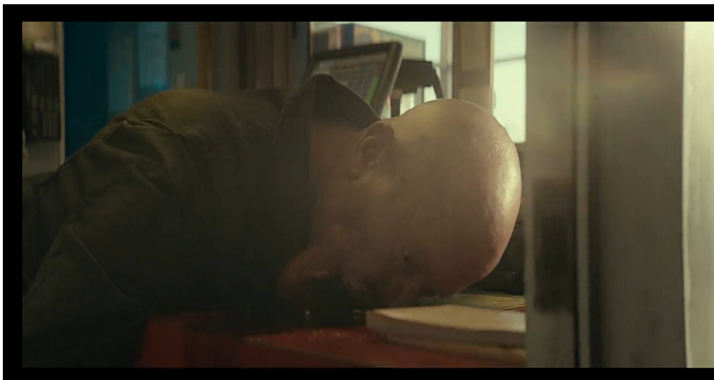
Figure 14: A man's body is discovered in a gruesome position in Halloween (Green, 2018, 00:38:09)

However, men's deaths are now more bloody and there are more male victims than female.