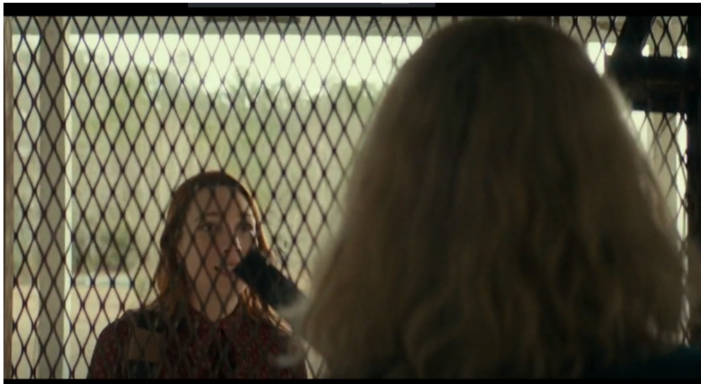
Figure 40: Laurie locking the journalists out in Halloween (Green, 2018, 00:11:11)

Her house, as previously mentioned, is very secluded. We can see in this shot [00:10:50] that it is in the middle of the forest. It is surrounded by a fence, has a gate controlled with cameras and her door has several locks. It is extremely secure. It almost resembles a military base and she rarely leaves it.