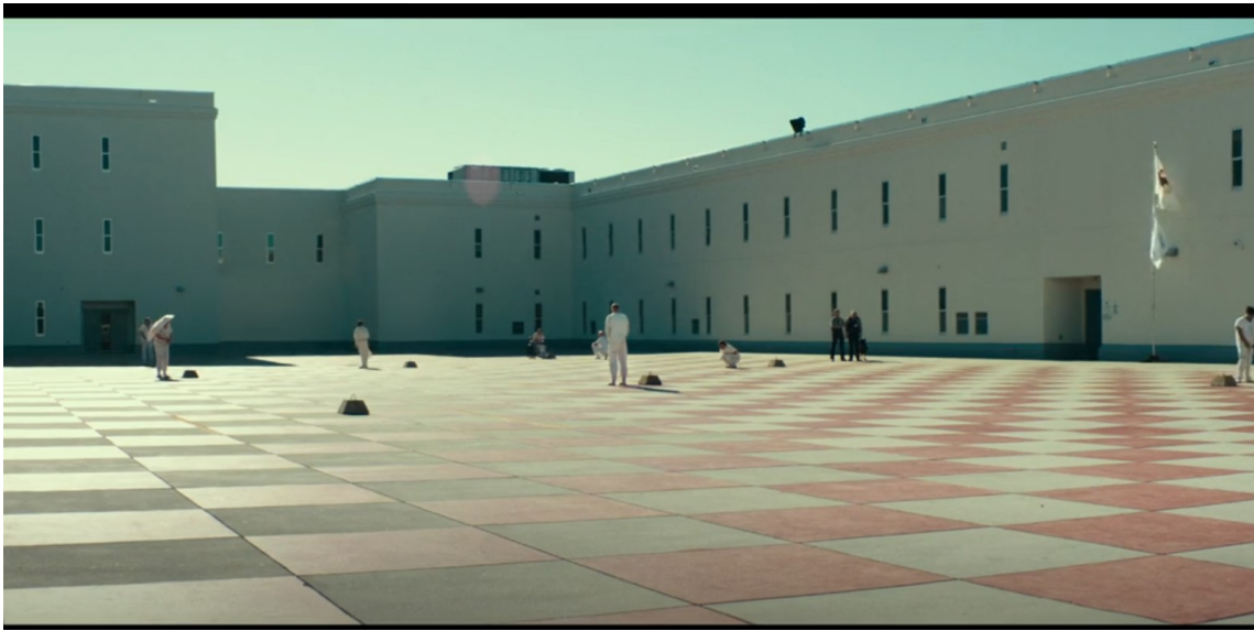
Figure 41: Michael in the asylum in Halloween (Green, 2018, 00:03:54)

like in the actual asylum at the very beginning of the movie.