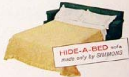
HIDE-A-BED sofa made only by SIMMONS

1956 Simmons Hide a Sofa- Bed original vintage advertisement. Simmons convertible sofa beds begin as low as $169.50.