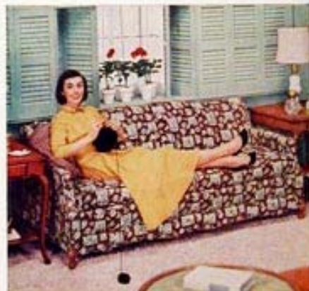
HIDE-A-BED SOFA in gay Provincial print. Quilted effect in cream brown. Also in forest green, gray, gold. Full size shown, $299.50. Apartment size, $269.50.

Remember, no other sofa bed can be called a Hide-A-Bed sofa. A Hide-A-Bed sofa is made only by Simmons.