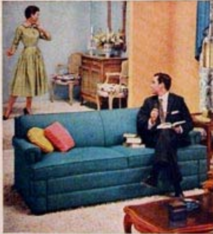
LAWSON HIDE-A-BED sofa in turquoise installa. Also in dark green, persimmon, beige, sage green. Full size shown, $219.50. Apartment size, $209.50.

Prices for other Simmons convertibles begin as low as $169.50. Convenient terms are usually available.