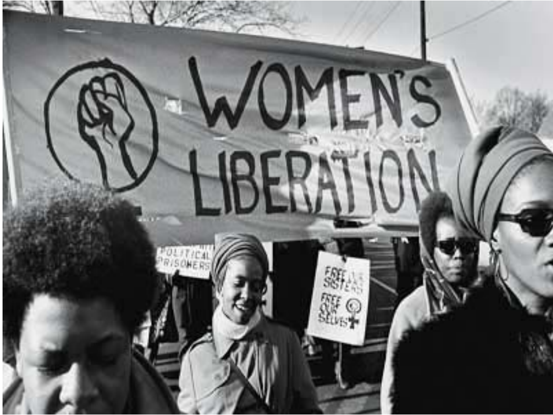
Feminist March for Women's Right, 1966.