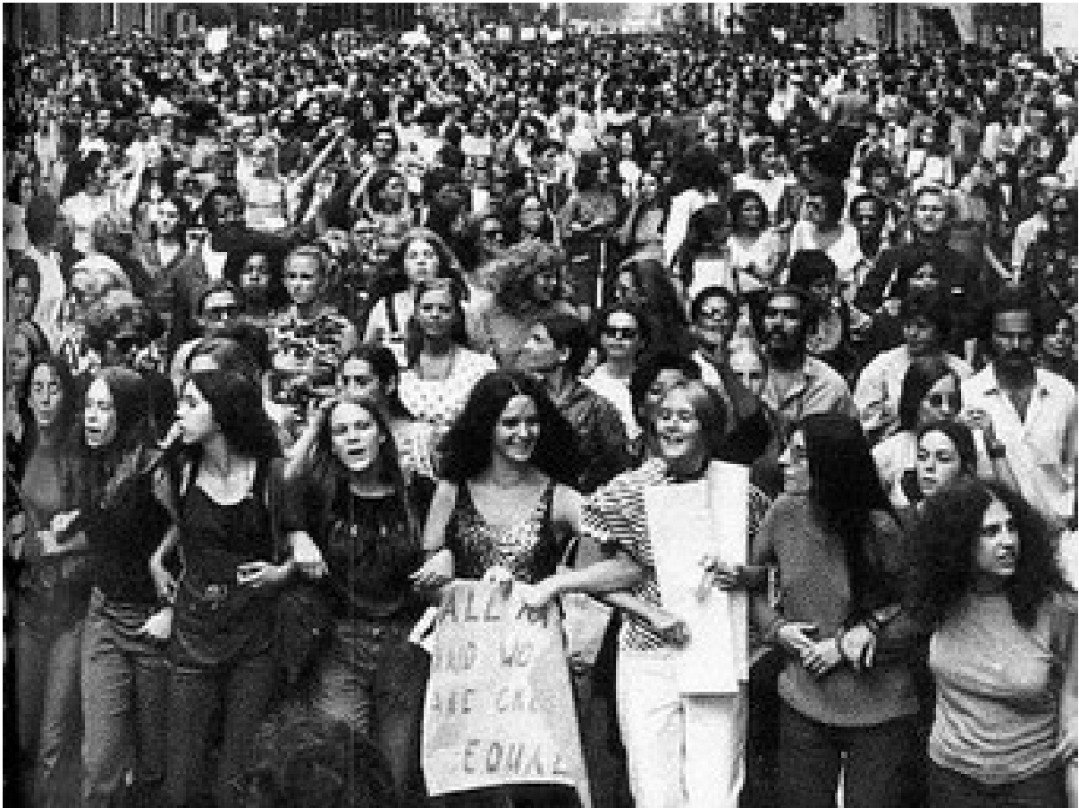
Lesbian march in the 1970's.