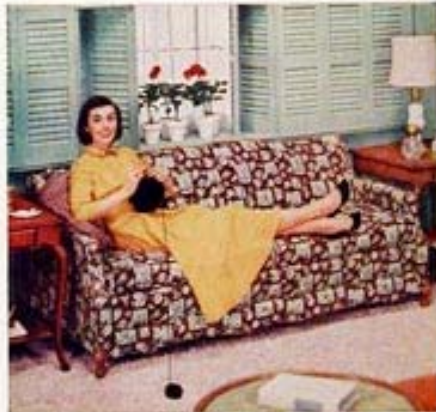
HIDE-A-BED SOFA in gay Provincial print. Quilted effect in cream brown. Also in forest green, gray, gold. Full size shown, $299.50. Apartment size, $269.50.

Remember, no other sofa bed can be called a Hide-A-Bed sofa. A Hide-A-Bed sofa is made only by Simmons.