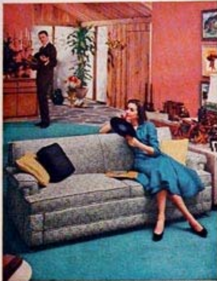
MODERN HIDE-A-BED sofa in black and white metallic wood. Also in turquoise, beige, pink, green. Full size shown, $299.50. Apartment size, $269.50.