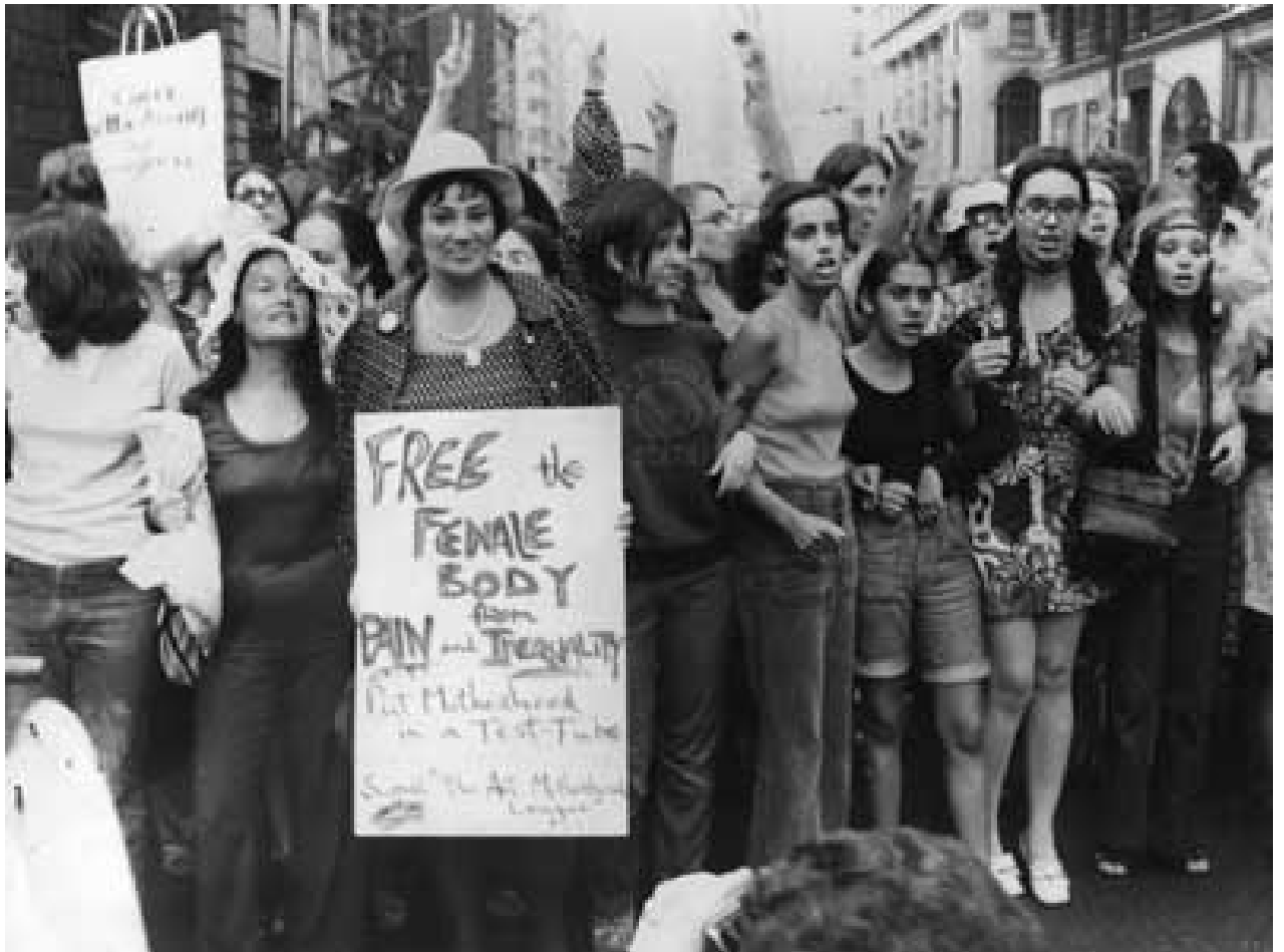
Second-wave feminists march during the Women's Liberation parade in 1970.