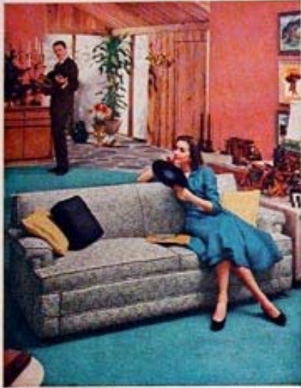
MODERN HIDE-A-BED sofa in black and white metallic wood. Also in turquoise, beige, pink, green. Full size shown, $299.50. Apartment size, $269.50.